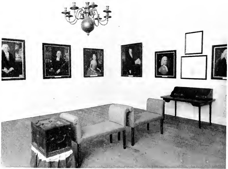
Steward's Museum, Hartford State House.