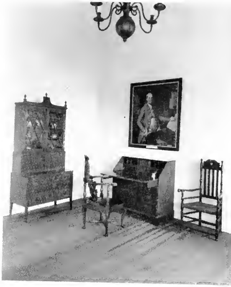
Governor's Office, Hartford State House.