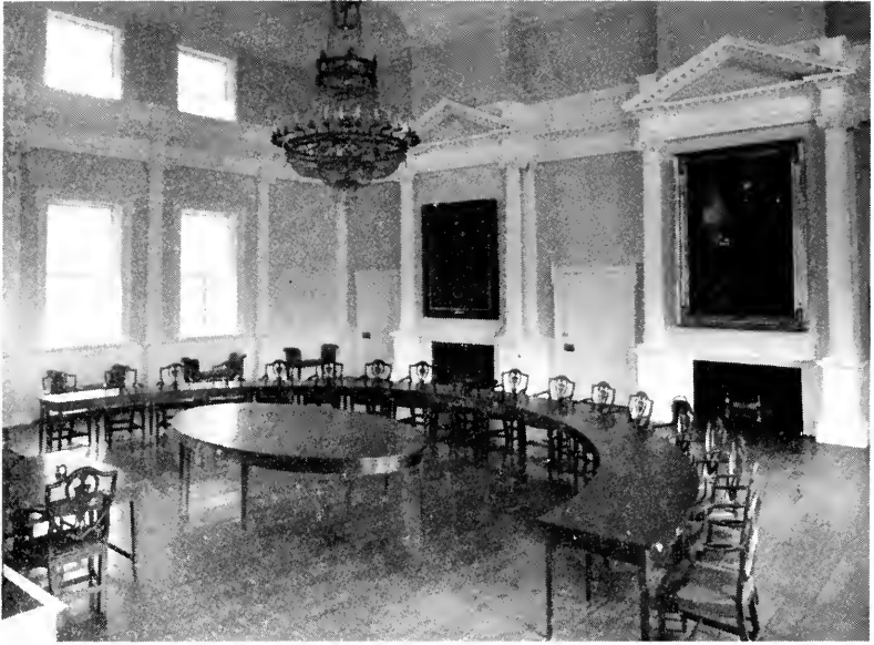
Senate Chamber, Hartford State House.