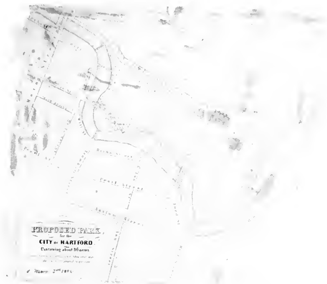
Map of proposed park, Hartford, 1854, now Bushnell Park.