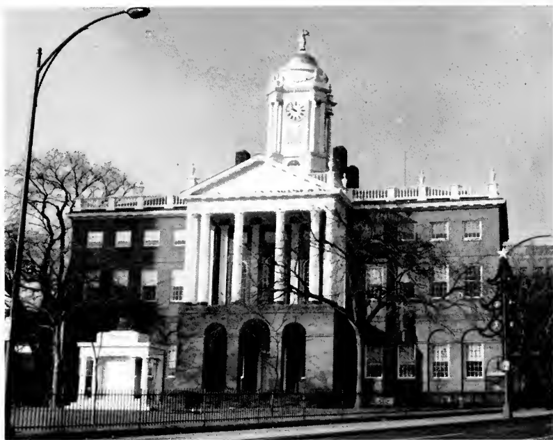
Hartford State House.