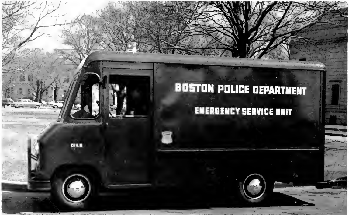
EMERGENCY SERVICE UNIT — "ON THE WAY"

† Included in the total of 14 trucks there is a car-crane and a fork-lift at Division 8.