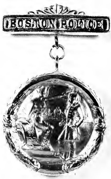
DEPARTMENT MEDAL OF HONOR