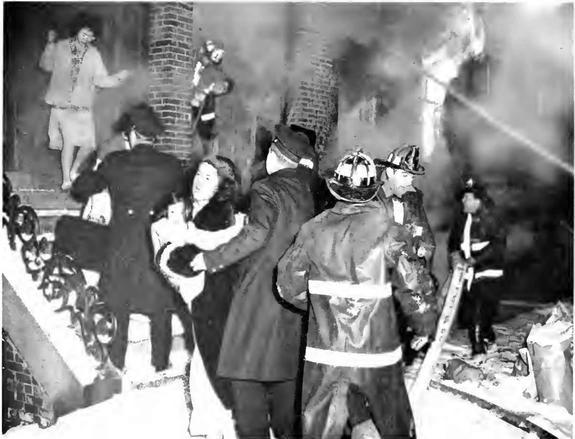
POLICE RESCUE AT HEIGHT OF SOUTH END FIRE

Amount of money ordered by the various courts to be paid through the Probation Departments in cases of arrests for nonsupport of family and illegitimate children during the past year amounted to $221,700. In addition to this amount, $132,558.82, made up of reimbursements in cases of larceny by fraud, totals $354,267, which has been saved the City of Boston.