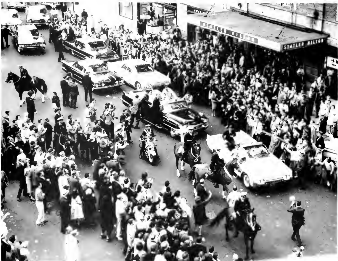
TIGHT-KNIT SECURITY FOR PRESIDENT KENNEDY

Escorts were provided for President John F. Kennedy on the occasions of his visits to our city. Escort service was provided also for the Prime Minister of Great Britain, Ambassadors from Israel, Sweden, and the Philippines, the Secretaries of Navy and Agriculture, the Cardinal of Tanganyika, the Bishop of Lebanon, the Mayor of Palermo, Italy, the personal representative of the President of Tunisia, the Governor of Nevada, high-ranking officers of the armed services and veterans' organizations, and police officials from Italy, Japan, and Iran.