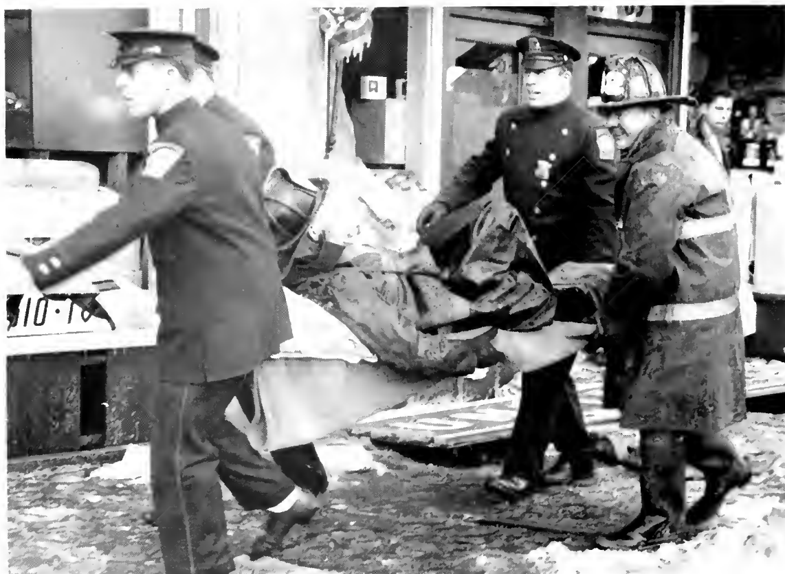
WILLING HANDS AID DISABLED FIRE FIGHTER

The drillmaster, with his assistants, is responsible for the Police Academy and its activities and maintaining at high efficiency the Police Department Band and Drill Team.