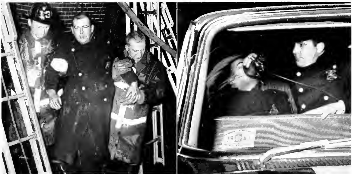
HEROIC OFFICER AIDED AFTER RESCUING THREE

It will be noted that a comparison with the annual report submitted in the year 1960 shows that the juvenile pattern has taken a downward trend in the City of Boston, when it is public knowledge that the trend is upward in the greater part of the country today.