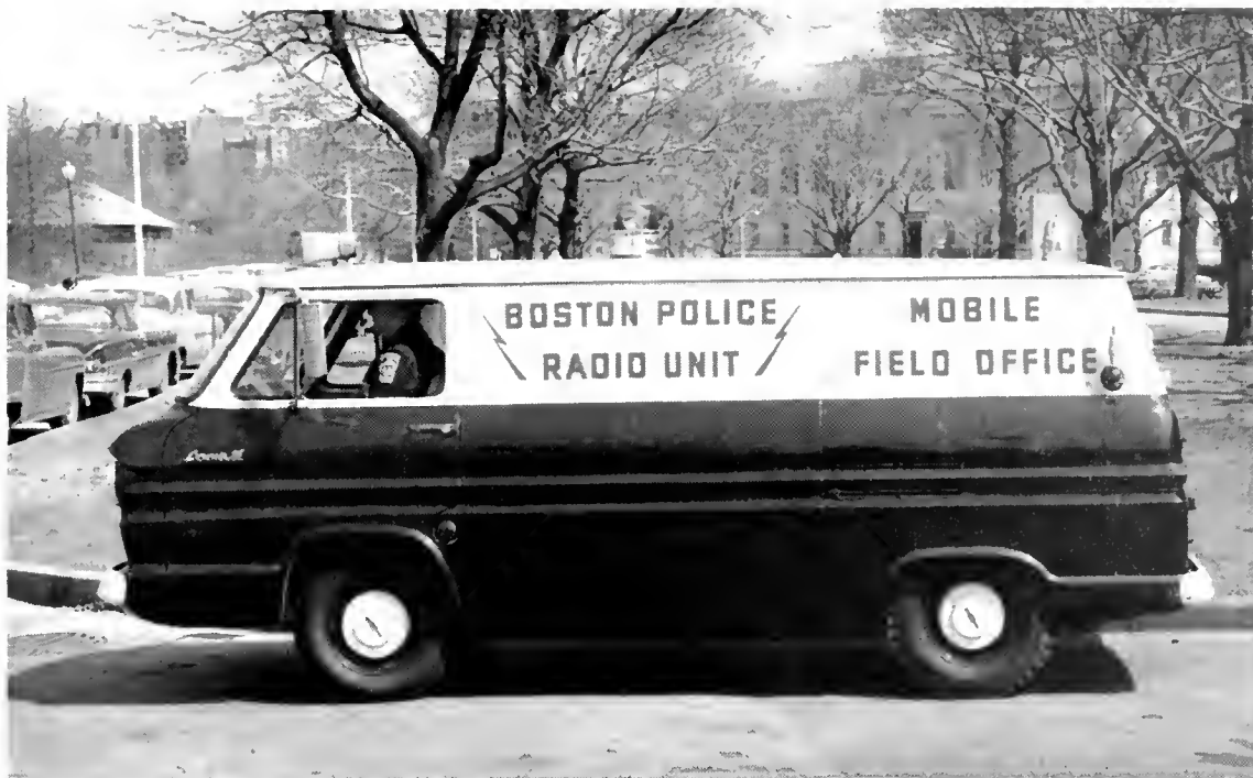
NEW BPD MOBILE FIELD RADIO UNIT