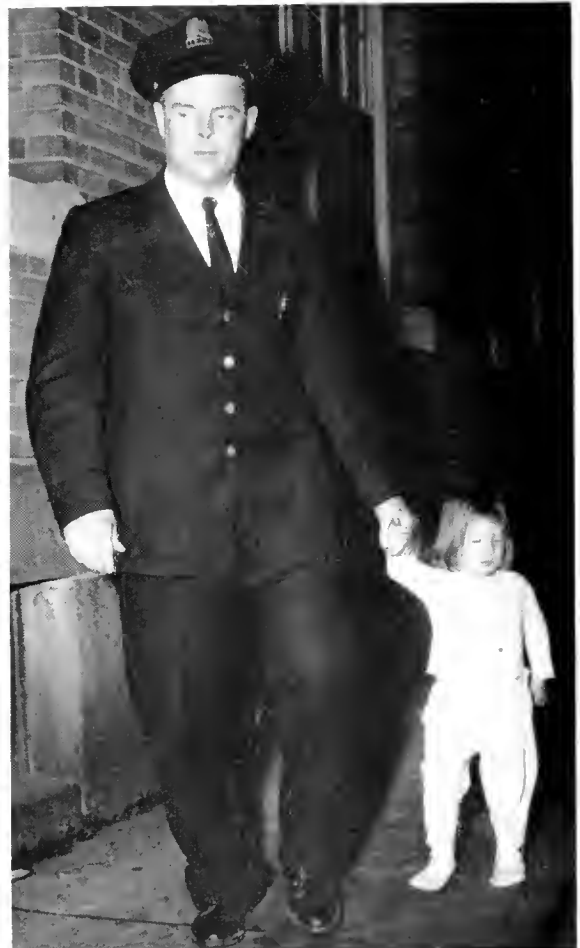
NOCTURNAL STROLL COMES CROPPER AS OFFICER TAKES OVER IN CHARLESTOWN

This unit also has a high-speed electric addressograph machine and two electric mimeograph machines which are used to make daily manifolds, warrant manifolds, bulletins, and circular letters for the various units and divisions, including Police School lessons.