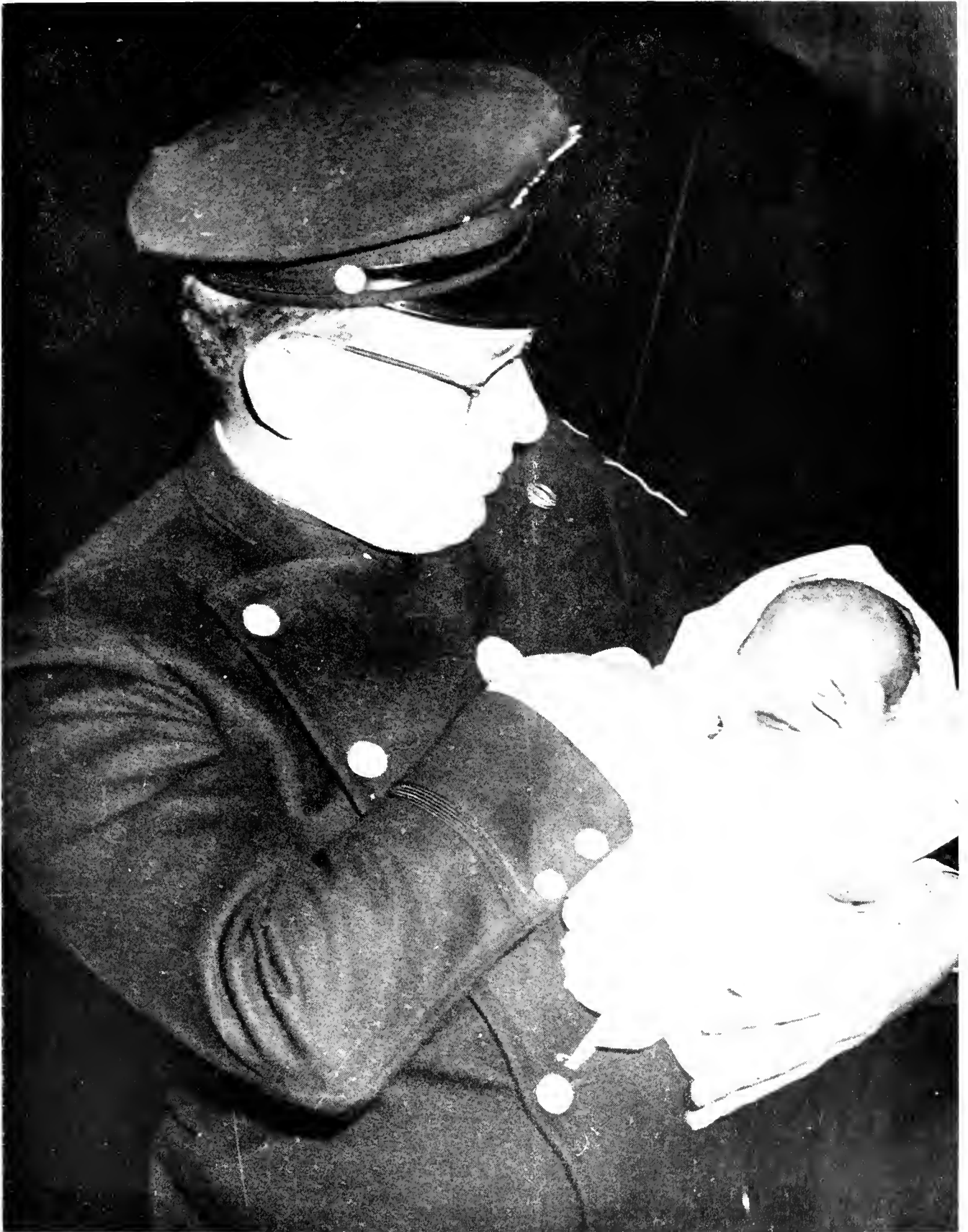
NEW ARRIVAL