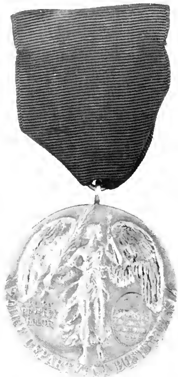
WALTER SCOTT MEDAL FOR VALOR