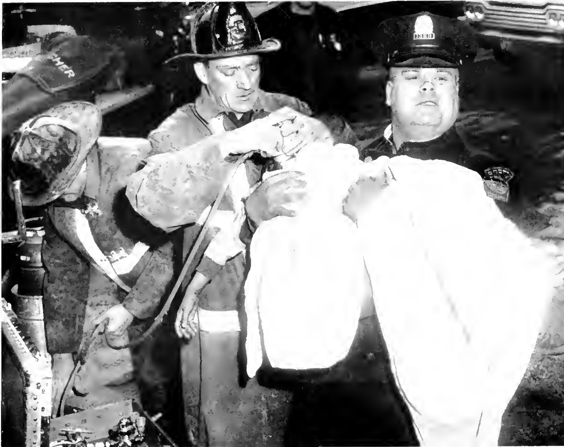
POLICE AND FIRE FIGHTERS COMBINE TO SAVE CHILD