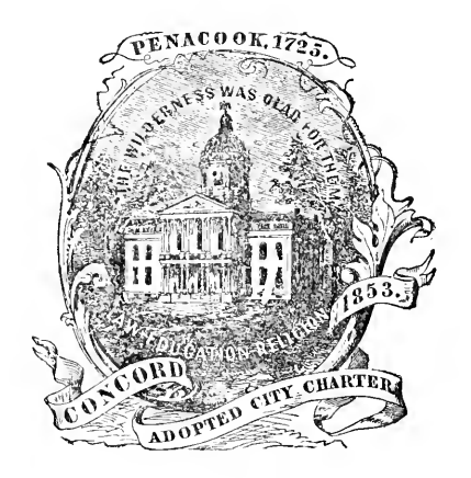
CONCORD, N. H.: PRINTED BY THE REPUBLICAN PRESS ASSOCIATION. 1883.

TOGETHER WITH OTHER ANNUAL REPORTS AND PAPERS RELATING TO THE AFFAIRS OF THE CITY.