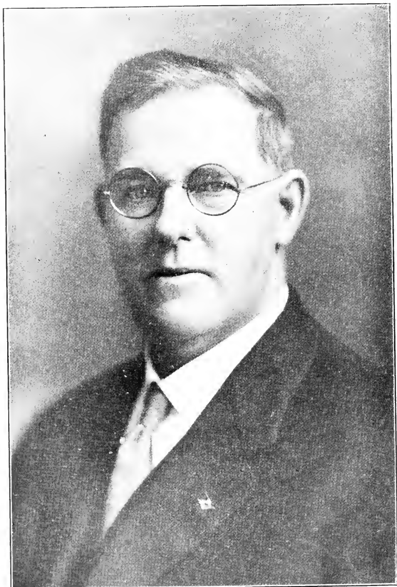
HON. FRED NATHAN MARDEN Inaugurated Mayor January 26, 1926 Born July 10, 1865 Died November 23, 1927