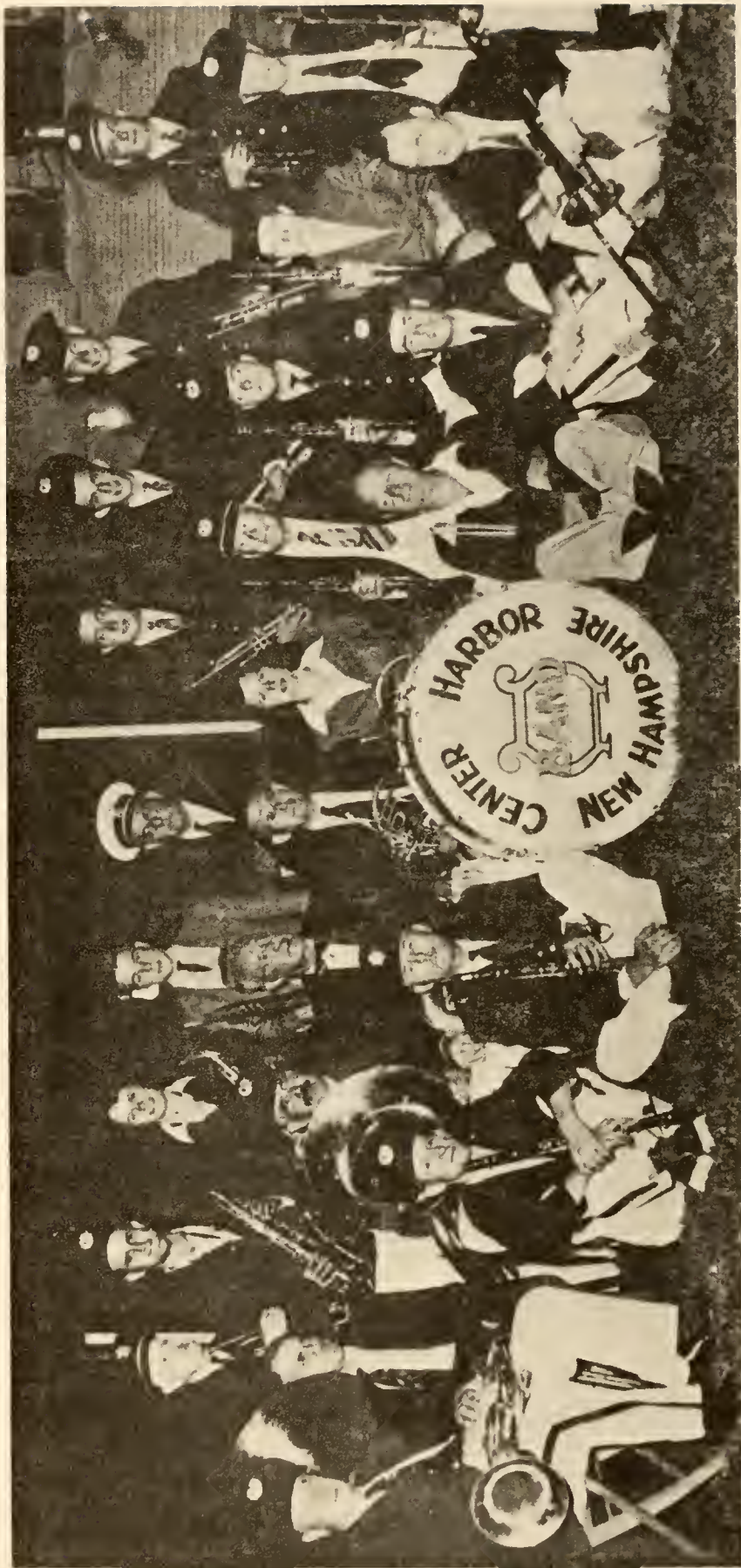
OLDEST BAND IN THE STATE