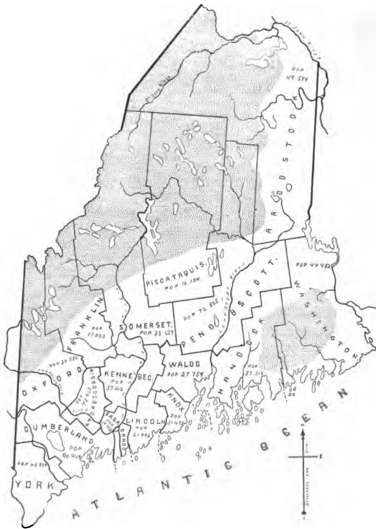
THE SHADED PARTS INDICATE THE UNSETTLED, OR TIMBERED PORTIONS OF THE STATE.