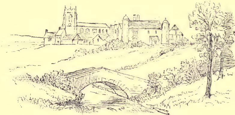
ASHTON MANOR, FROM A DRAWING DATED 1777.

extraordinary privileges, exercised them with great rigour in exacting fines and forfeits. It was his custom to ride in a suit of black armour with his retinue, taking strict cognizance of every infraction of his baronial rights. He is said to have been slain by a woman in his own house, in a corridor, the spot being still pointed out. From the time of his death, so great was the hatred he excited that a figure was carried in effigy on horseback to Ashton Manor, and afterwards torn to pieces and burnt in the market-place. This custom is continued annually on Easter Monday to the present day, the figure being always represented in black armour. The custom is called "riding the