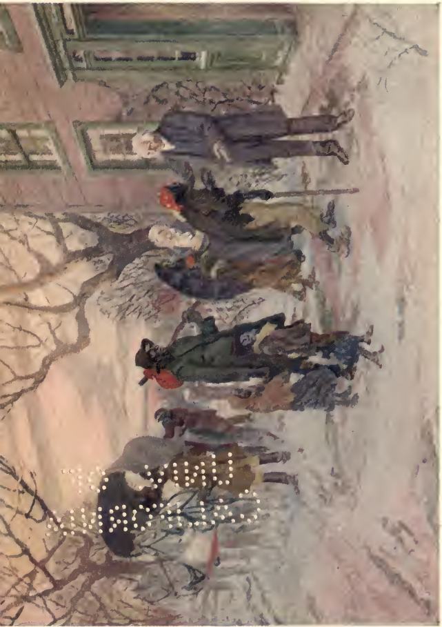
FUGITIVE SLAVES ARRIVING AT A STATION ON THE UNDERGROUND RAILWAY