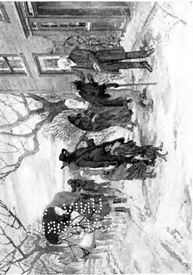
FUGITIVE SLAVES ARRIVING AT A STATION ON THE UNDERGROUND RAILWAY