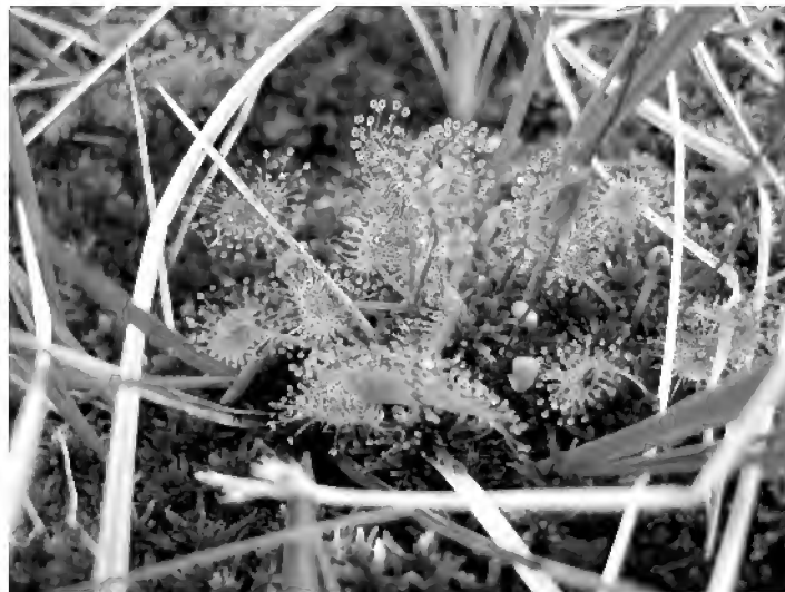
Round Leaved Sundew.

The 25 participants were split into five teams. A total of five sites were visited as a result of this effort, three of which had documented round leaved sundew occurrences, the other two supported similar habitat. Each team was assigned a leader who ensured the following five deliverables were accomplished at each site: 1) confirm sundew occurrences and update