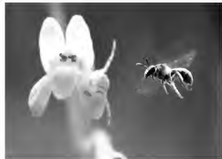
Penstemon degeneri Degener's beardtongue