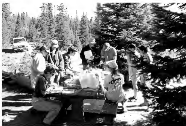
Group Plant Keying Session.

If you are interested in participating in this years Field Studies Project, see announcement for volunteers on page 11.