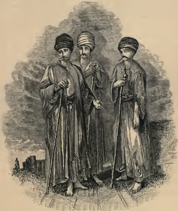
THE THREE ROYAL MENDICANTS.