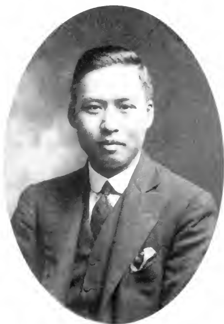
My father, the Inspector of Vernacular Schools, 1920s