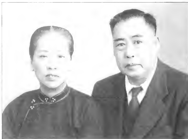
My parents in their sixties