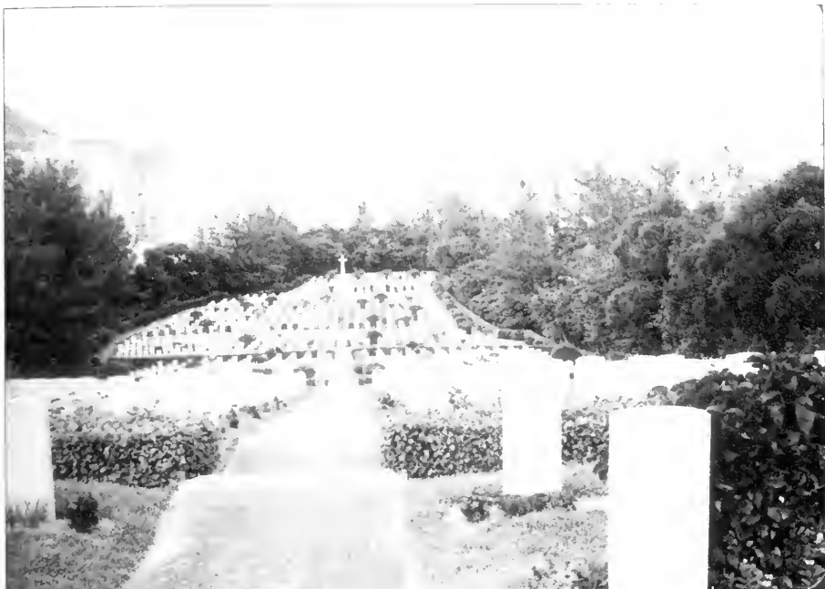
Sai Wan War Cemetery (Hong Kong)