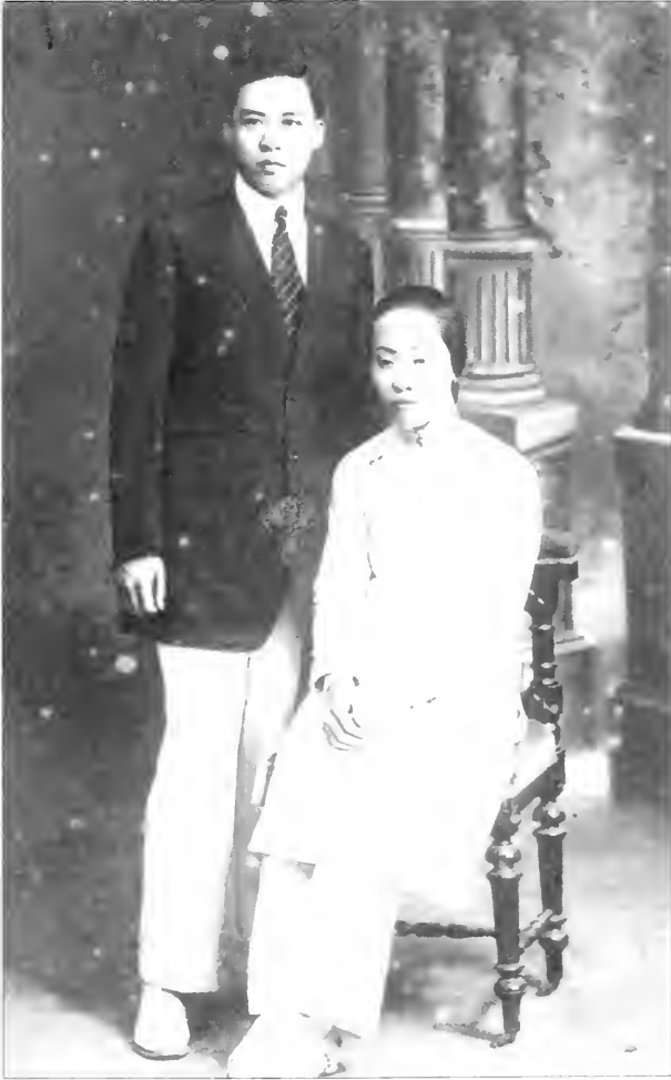
My parents in their early years, 1909-10