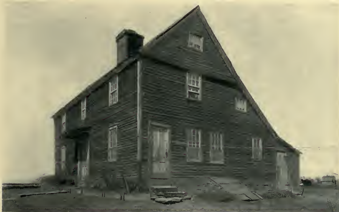
THE DEMING HOUSE, WETHERSFIELD, CONNECTICUT.

Original part of house built about 1660.