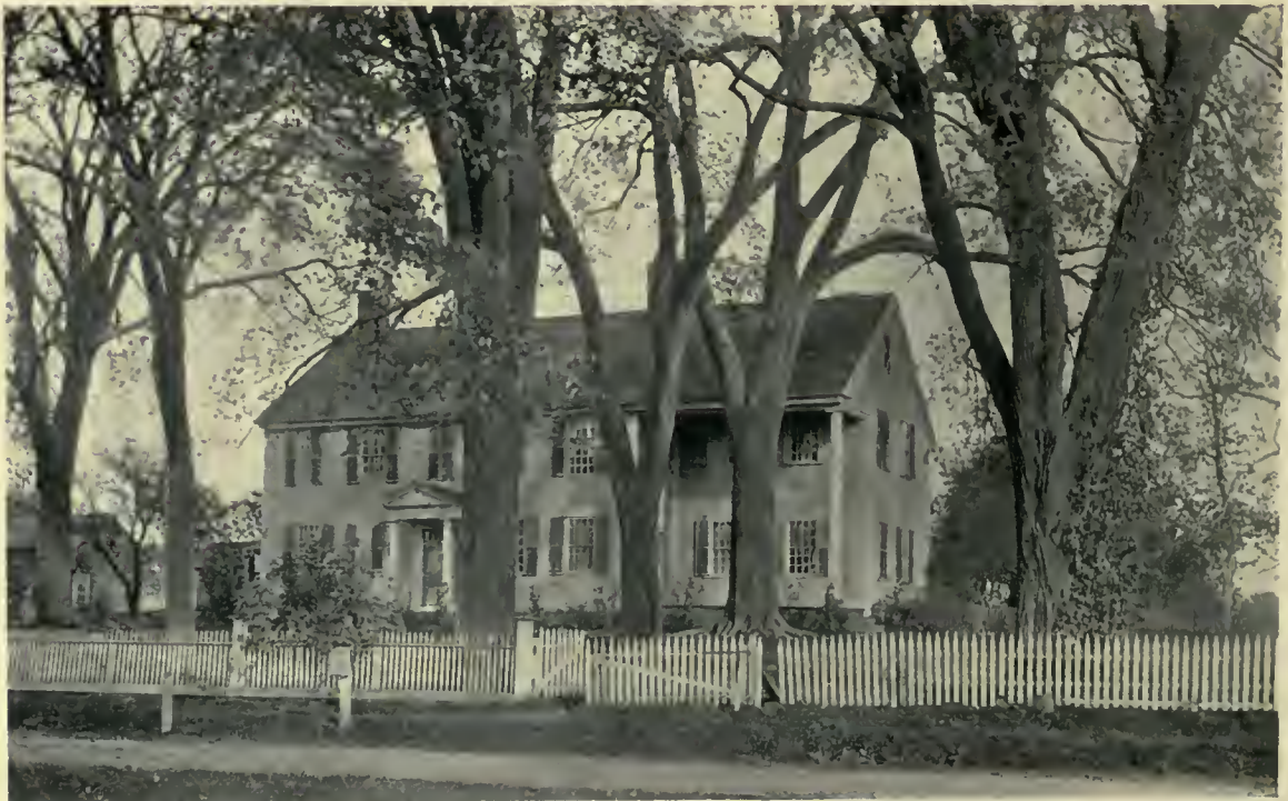
THE ELLSWORTH HOUSE, WINDSOR, CONNECTICUT.

It would be interesting to do an old house as the old men would have done it, and it is likely that most architects would welcome a chance to do this if it offered. Big White Pine timber grows abundantly to-day, though no longer in the East and at our very doors, but the facilities of transportation may almost do away with the handicap of this condition. Let some big lumberman offer us his large timbers and see whether this may not result in a reversion in some degree to older architectural types. These types, when added to our present ones, would furnish a broader basis of tradition on which to build our future native work.