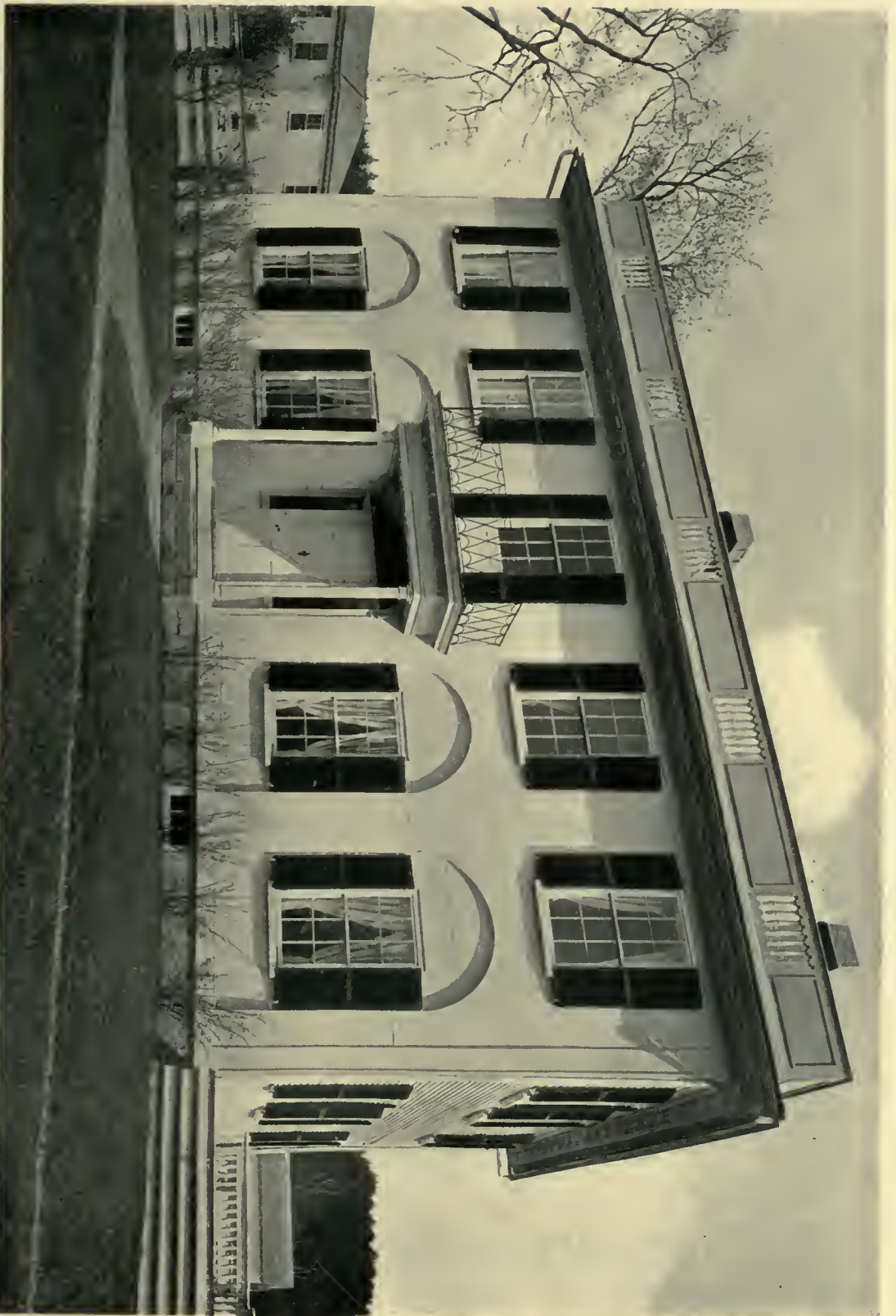
THE WHEELER HOUSE, ORFORD, NEW HAMPSHIRE.

It is believed this house was done by Bulfinch.