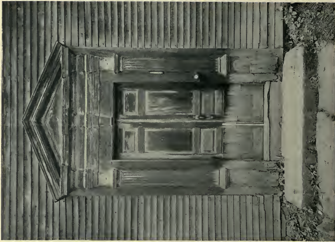
Frame with simple pediment.

Literal copies in wood of Georgian stone doorways made before Colonial woodworkers had learned the more graceful and more delicate possibilities of wood as a building material, yet early enough to show still a trace of Gothic feeling in the lower panels.