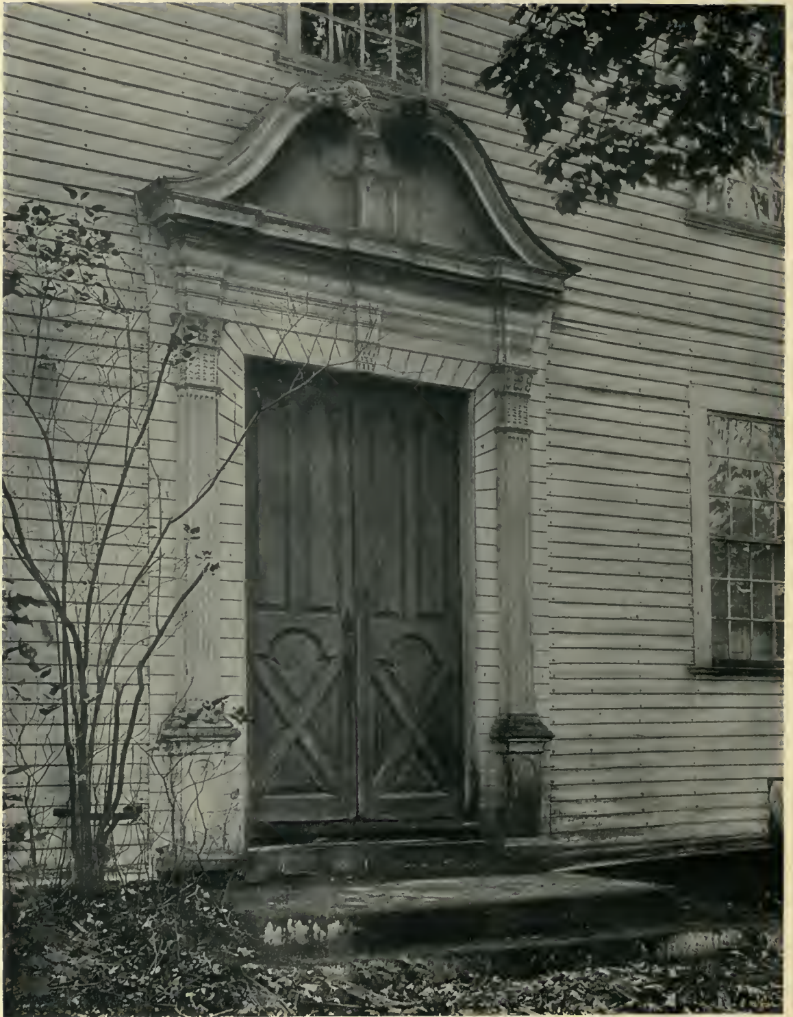
THE COLTON HOUSE, LONGMEADOW, MASSACHUSETTS. Detail of Entrance Doorway.