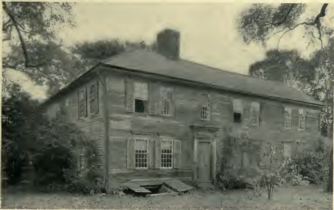
THE FRARY HOUSE, DEERFIELD, MASSACHUSETTS. North portion built in 1683. An L variety of the above Hoyt type of house.