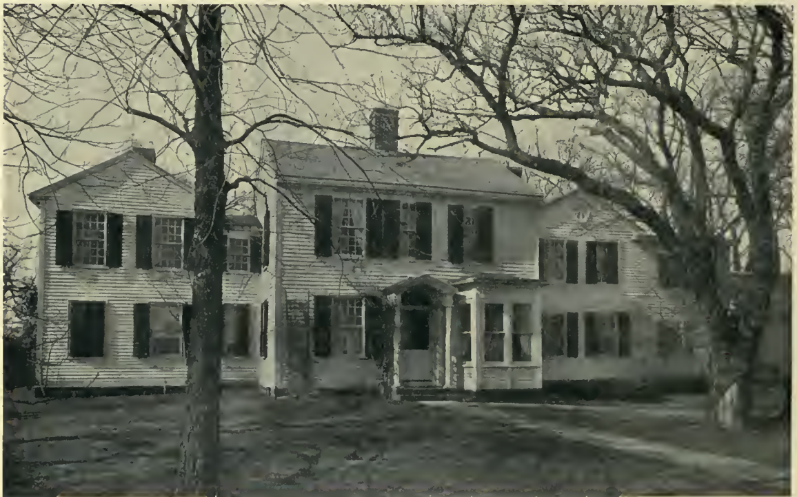
HOUSE OF GOVERNOR RICHARD GRISWOLD, BLACKHALL, CONNECTICUT. Built 1800. An unusual and interesting composition in spite of the regrettable bay.