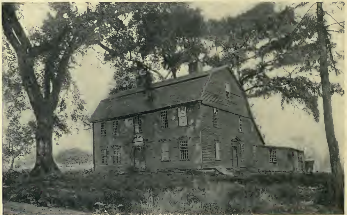
THE WILLIAMS HOUSE, EAST HARTFORD, CONNECTICUT. Characteristic of Connecticut third period work.