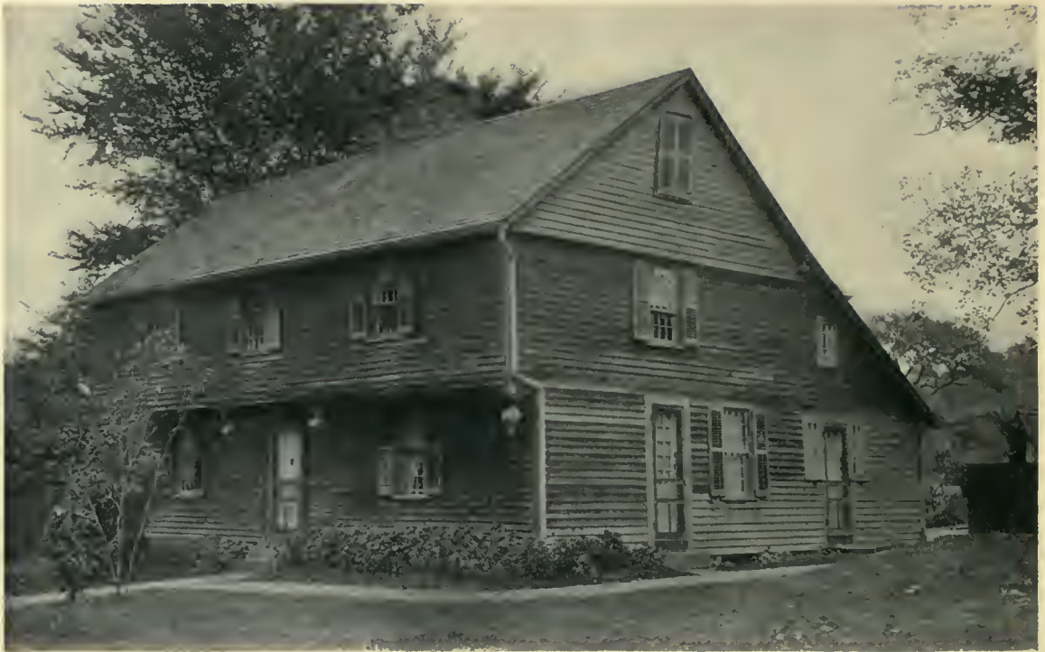
THE WHITMAN HOUSE, FARMINGTON, CONNECTICUT. Noteworthy as an example of the overhang construction with original drops and stone chimney.