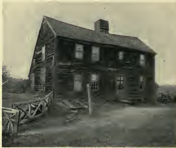
THE WAIT HOUSE, SOUTH LYME, MASSACHUSETTS.

(The earliest houses which they built have not come down to us. The Indians, who were friendly for the first years, took the war-path, and the life of the settlers for perhaps a hundred years included a constant warfare for defense among its other duties. As the whites increased in number they were more able to protect themselves. The first settlements were frequently destroyed. Springfield was burned in 1675 and Deerfield met the same fate twice, — smaller places even more frequently.) Men,