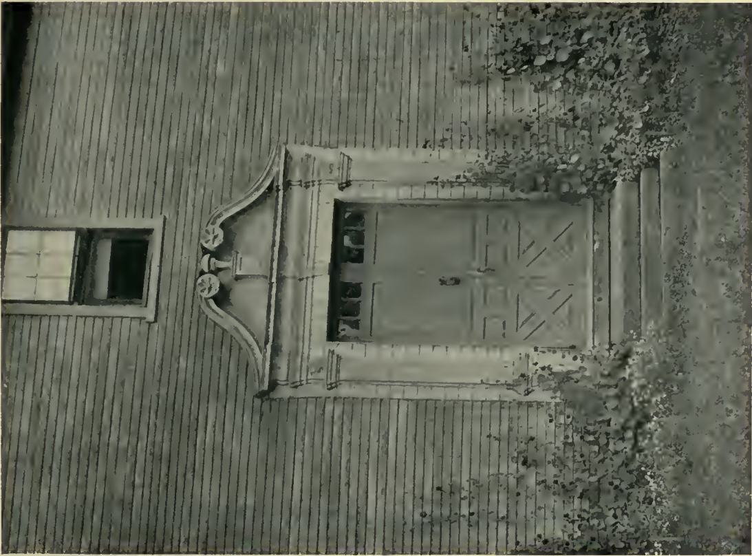
Detail of Entrance.

HOUSE AT GLASTONBURY, CONNECTICUT. Much of the charm of this porch may be the charm of age, but it is finely proportioned and of refined detail.