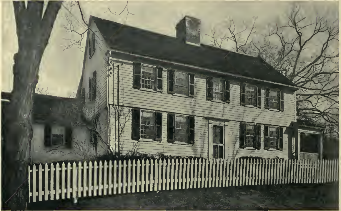
HOUSE AT HILLSTEAD, FARMINGTON, CONNECTICUT. Excellent but rather sophisticated example of type of house which embraces elements of design from several periods, all probably earlier than itself.