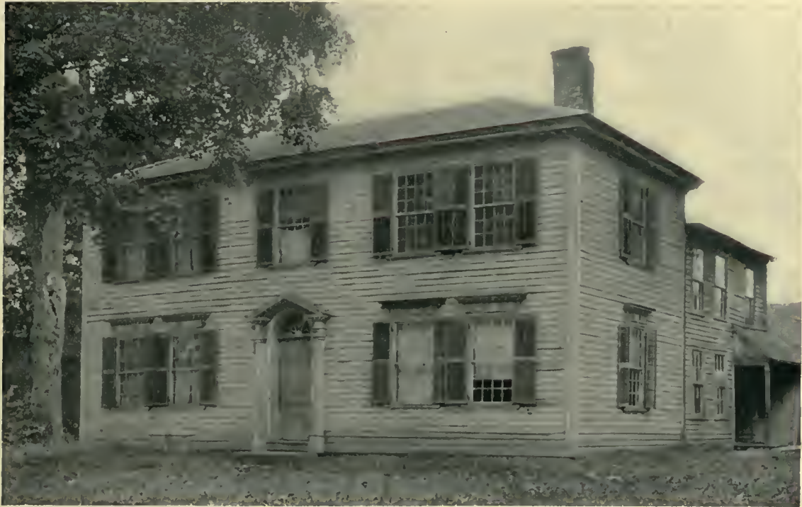
THE HORATIO HOYT HOUSE, DEERFIELD, MASSACHUSETTS Excellent example of Connecticut Valley variety of a type of house common to New England.