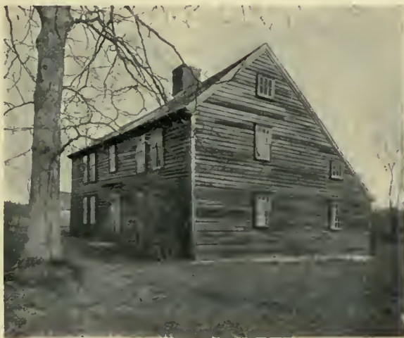
THE THOMAS LEE HOUSE, EAST LYME, MASSACHUSETTS.