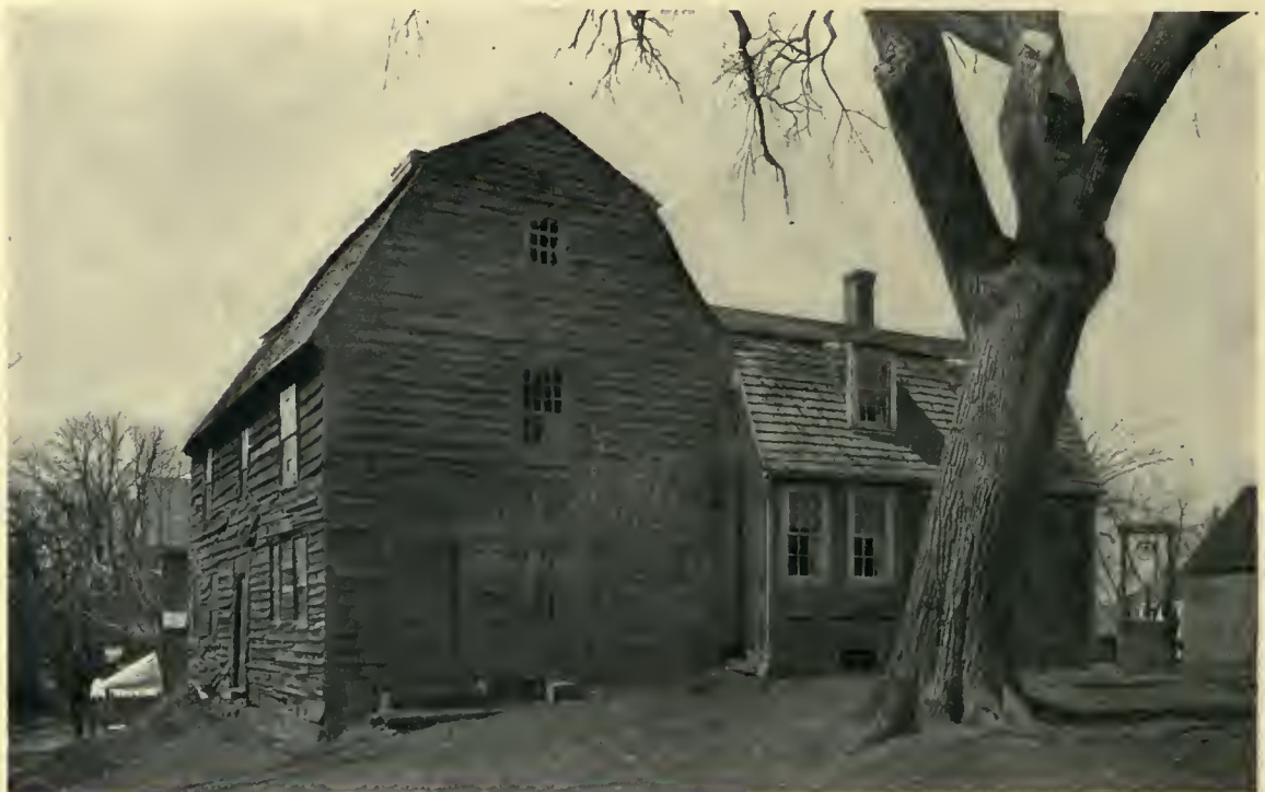
OLD HOUSE AT FARMINGTON, CONNECTICUT.

Gambrel of the third period with plan of the first period.