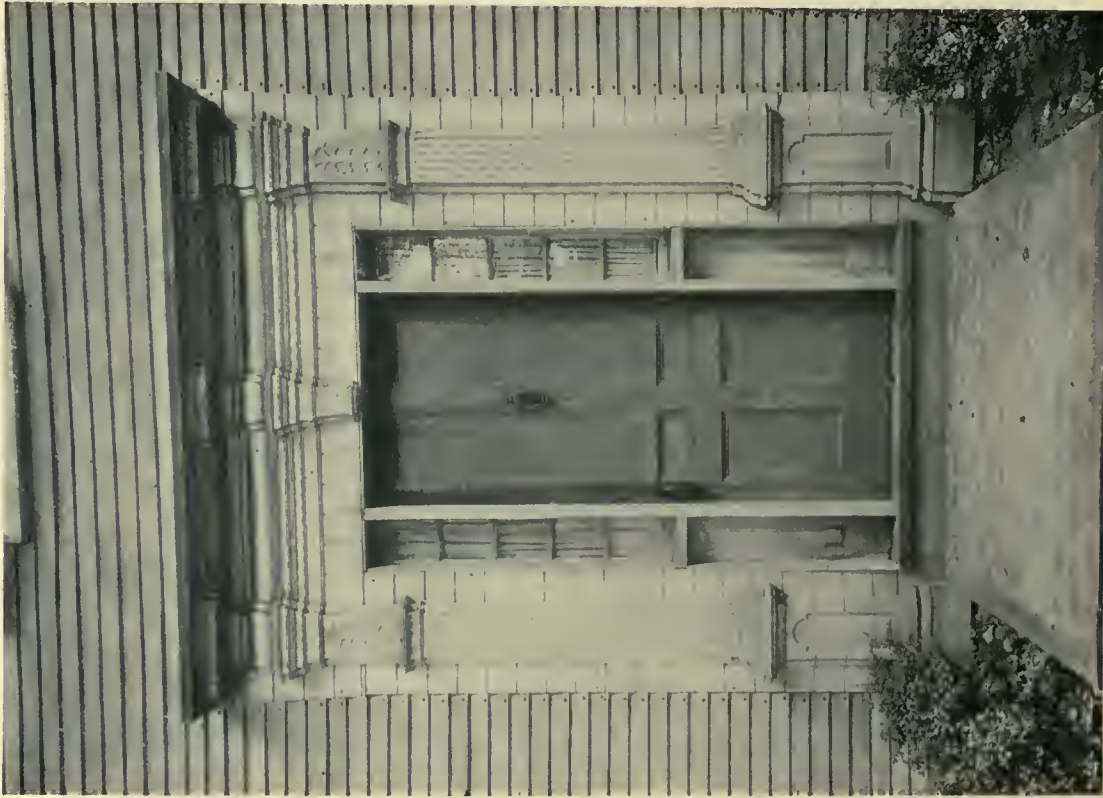
Frame with flat entablature.