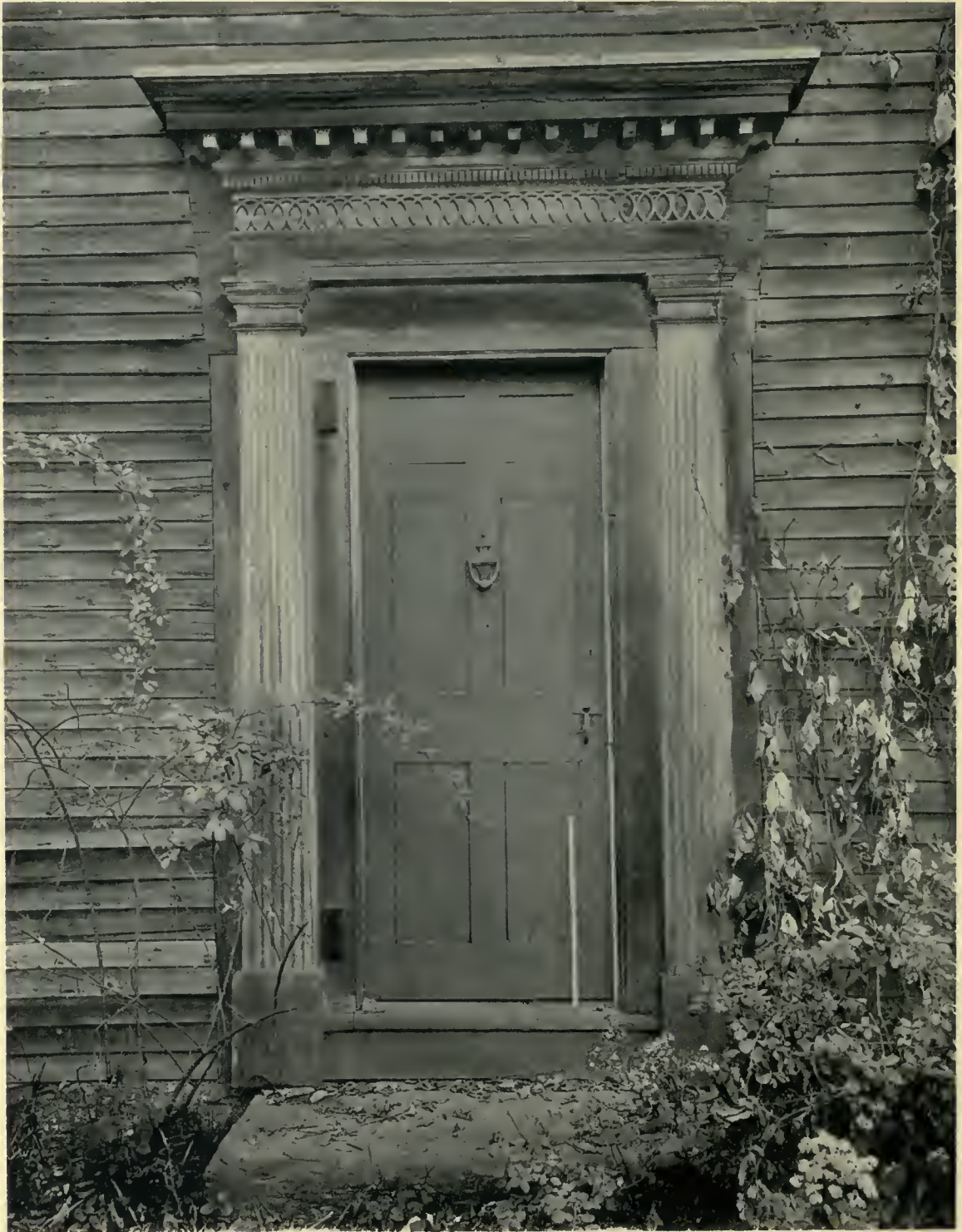
THE FRARY HOUSE, DEERFIELD, MASSACHUSETTS. Detail of Side Entrance Doorway.

Excellent in proportion and in well-executed detail.