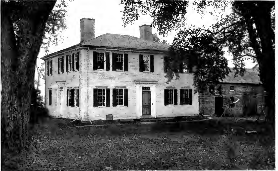
HOUSE AT WELLS, MAINE.

Well-proportioned façade, with wall texture refined by narrow clapboards.