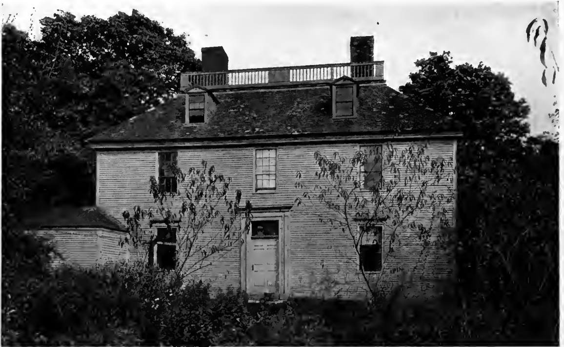
THE HOBBS HOUSE, SOUTH BERWICK, MAINE.

There are no more numerous or better land-locked harbors for "fitting out," while safely protected from all interference, than on the coast of Maine. The Dalmatian coast of the Adriatic and the gulfs of the Grecian peninsula alone compare with it. The famous Bonne Homme Richard of John Paul Jones was "fitted out" in the Great Bay up the Piscataqua River, and many a cargo has been laden from some concealed nook between York and Campobello.