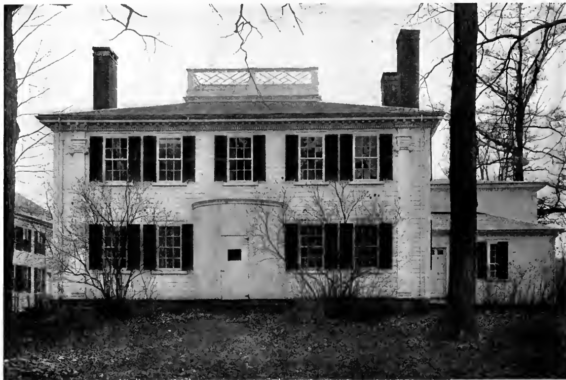
THE SMITH HOUSE, WISCASSET, MAINE.

The work in New England, somewhat more indigenous than elsewhere in the States, was more refined in its detail than elsewhere. There is more attention paid to entasis of columns, to fineness of fillets, to subtlety of curved profiles to mouldings. The fact is interesting, for English detail was less careful in contrasting sections, and in delicacy and avoidance of monot-