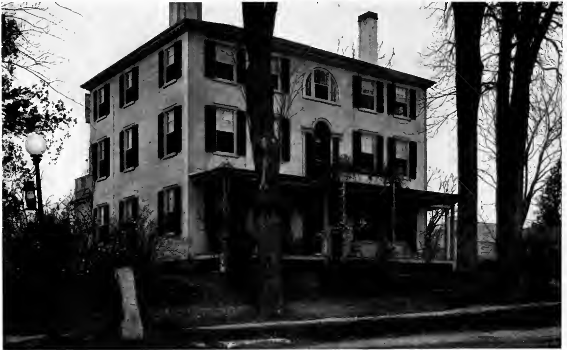
THE ABIEL WOOD HOUSE, WISCASSET, MAINE.

distinction. Classic architecture originates as a one-storied style, it progresses as a two-storied style, and later still more stories are added. The difficulty of adding these stories successfully increases geometrically with the increasing number of stories. This must necessarily be the case, as with the addition of each story the design departs farther from the original source of its inspiration. Therefore some of the smaller and simpler two-storied houses of more modest type built outside the towns are sometimes the more attractive.