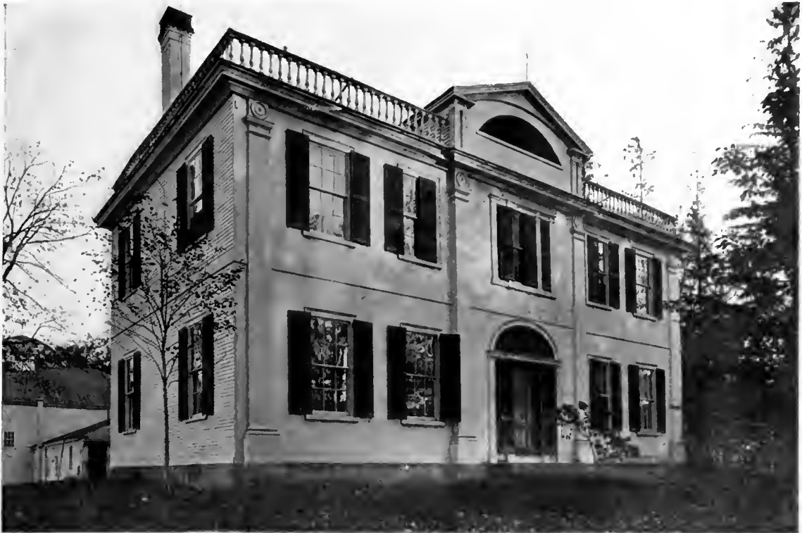
THE ROBERT LORD HOUSE, KENNEBUNK, MAINE.

Many of the houses in Maine were built between 1800 and 1810. That decade is an important one in residential building in American Eastern cities. The early economies of the years following the Revolutionary War were no longer felt necessary, and comfortable living, such as had been in the Colonies before the great struggle, began to reappear.