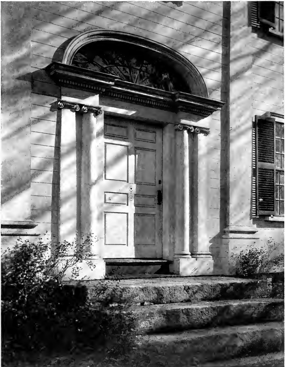
THE SEWELL HOUSE, YORK, MAINE. Detail of Entrance.

Dignified portal with adequate arch moulding. Note that the pilasters as well as the columns have entases.