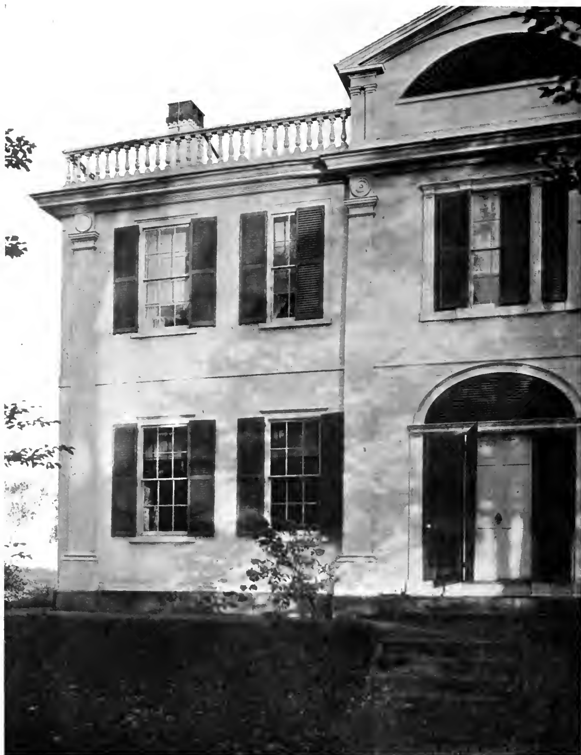
THE ROBERT LORD HOUSE, KENNEBUNK, MAINE.

Details especially good. Balustrade at top too weak at the corner. Sentinel window in gable upon entrance axis is out of harmony with the shape of the other openings.