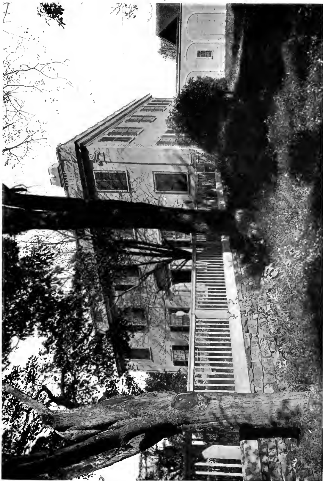
THE SEWELL HOUSE, YORK, MAINE.

Finely proportioned façade, simple fence with delicate urns, the square balusters to the fence are set diagonally to obtain the play of light and shade.