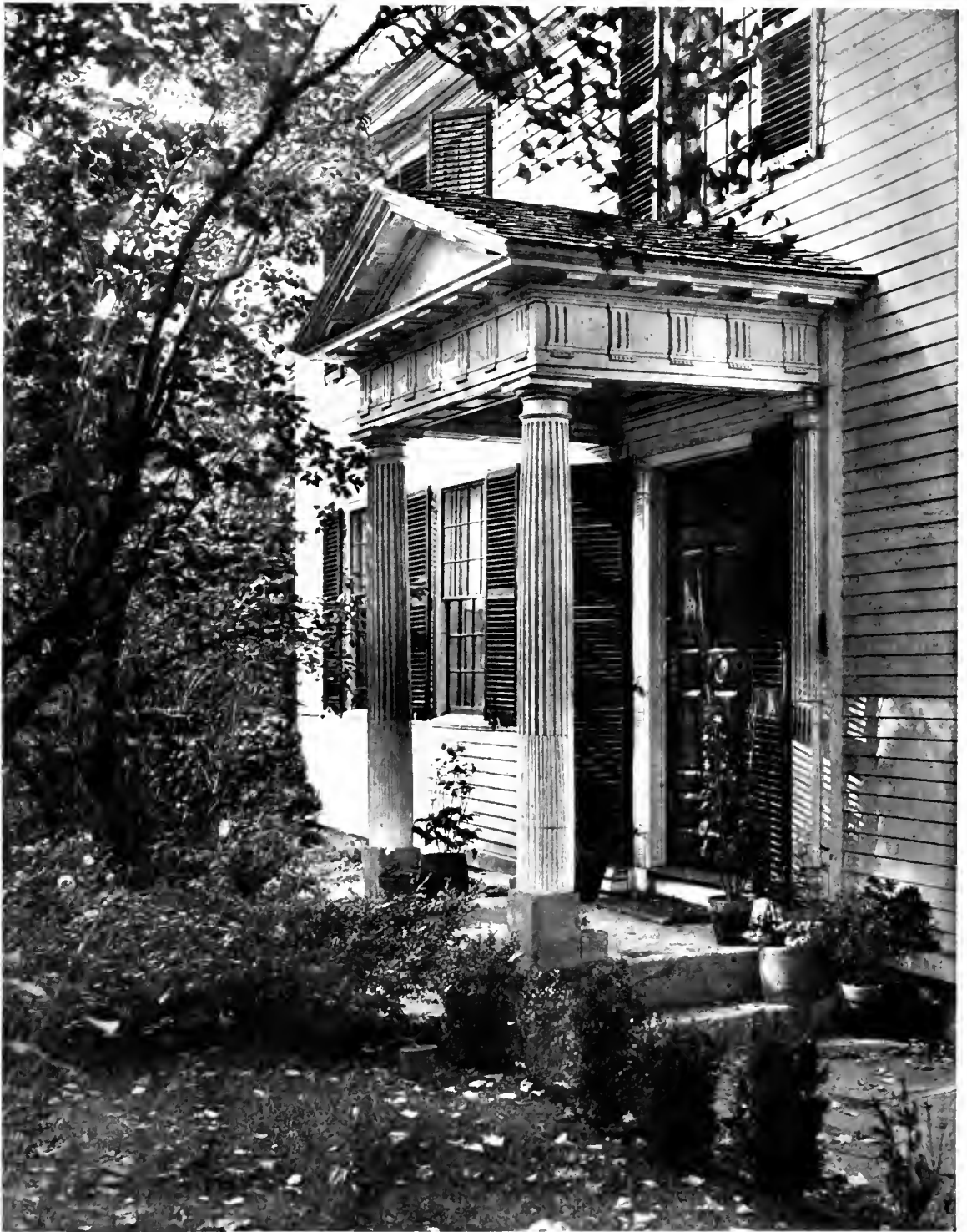
THE JEWETT HOUSE, SOUTH BERWICK, MAINE.

A remarkably well proportioned and delicate Roman Doric porch. Note the filling of the flutes in the lower third of the columns to avoid too great apparent slenderness in the columns.