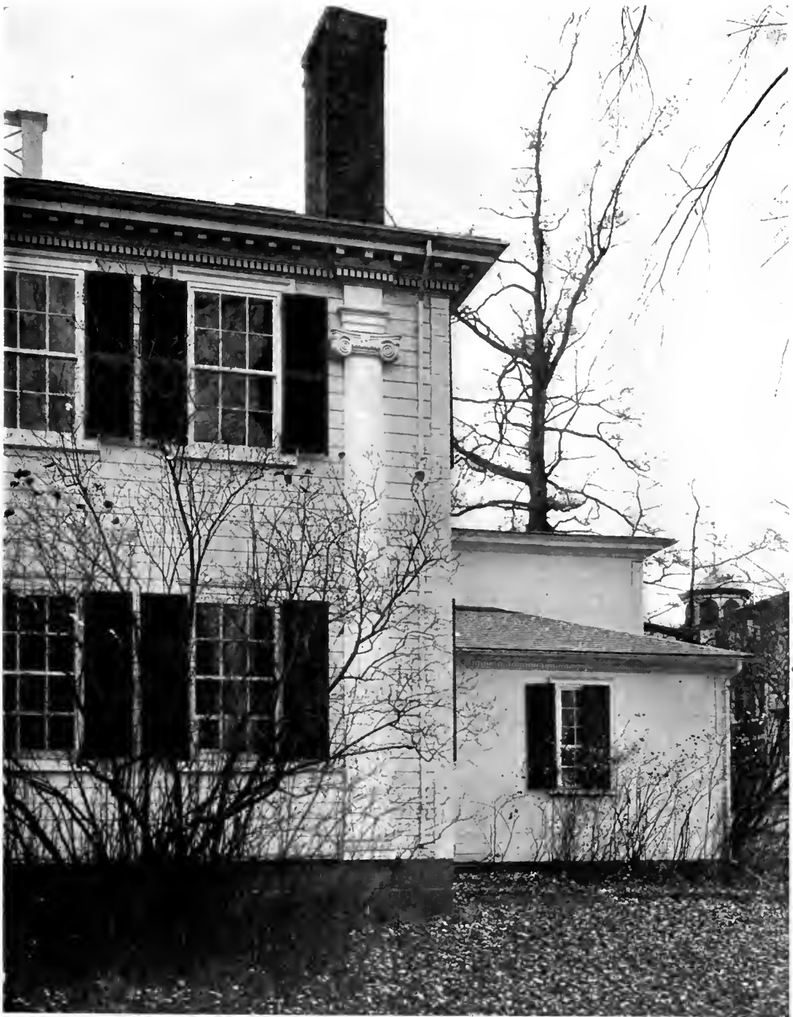
THE SMITH HOUSE, WISCASSET, MAINE.

Admirable cornices, both upon main façade and the smaller masses. Note the angle of these cornices is more acute than 45 degrees, which is usually the case in Colonial exteriors, and gives an effect of additional refinement.