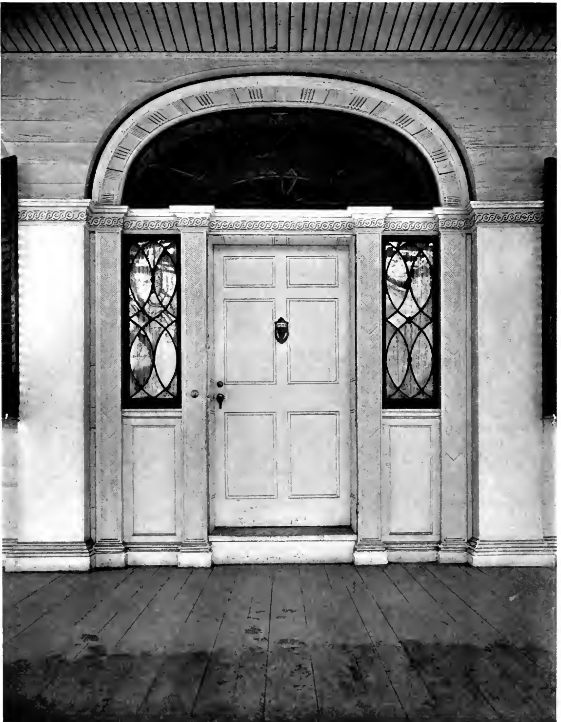
THE NICKELS HOUSE, WISCASSET, MAINE. Detail of Entrance Doorway.

Interesting textures obtained by very simple means. The graduation of the reeds and darts in the arch from the same centre as the divisions of the fan-light, instead of being at right angles to the arch curve, is unusual, as is also the herring-bone reeding of the pilasters.