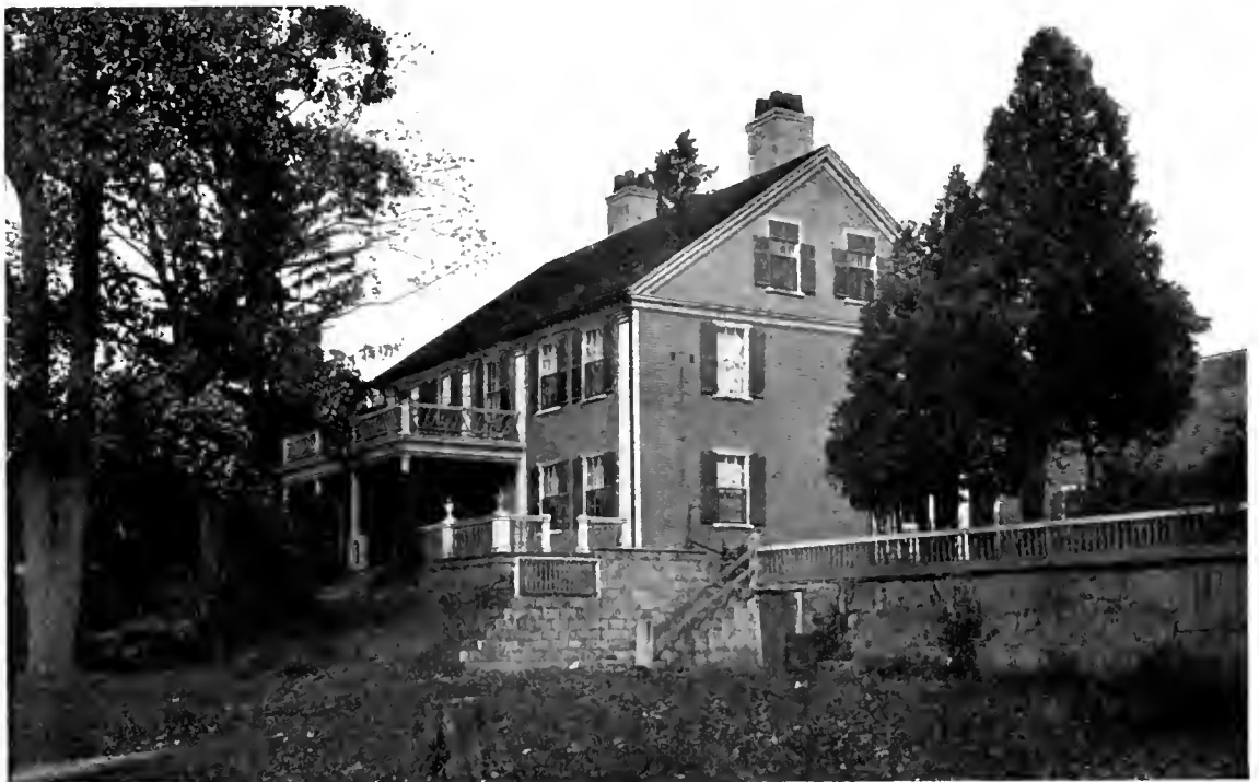
THE JUDGE HAYES HOUSE, SOUTH BERWICK, MAINE.

Well-proportioned façade, with wall texture refined by narrow clapboards.