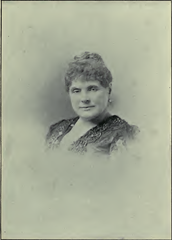
Louise Chandler Moulton.