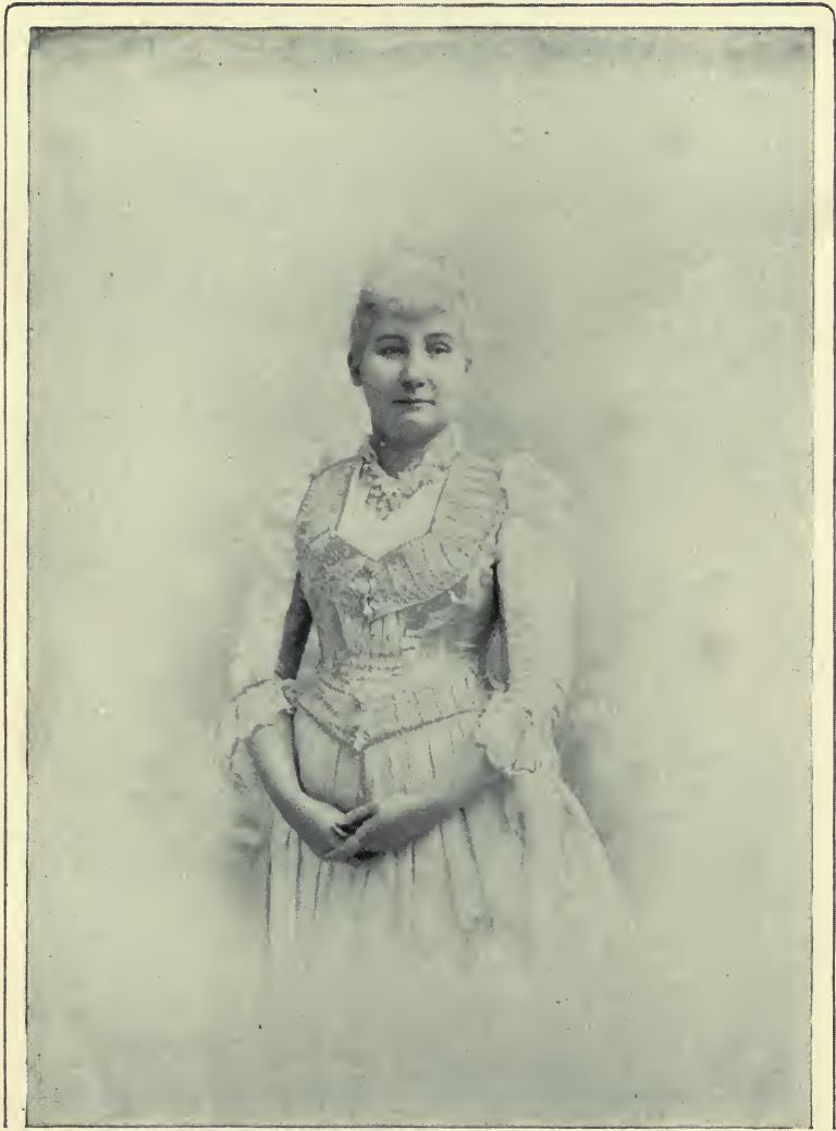
May Wright Sewall.