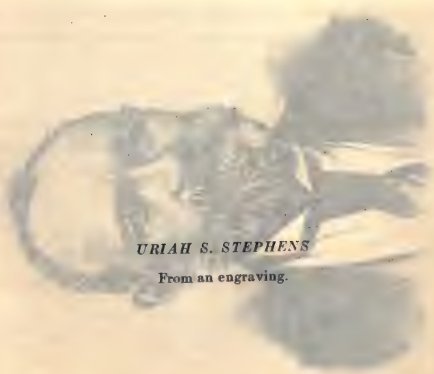
URIAH S. STEPHENS