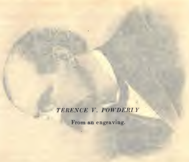
TERENCE V. POWDERLY