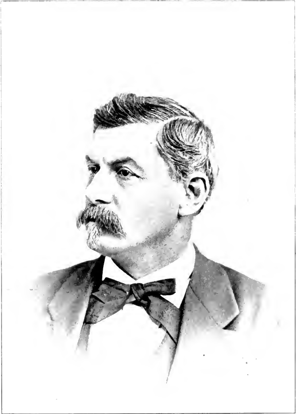
MAJOR-GENERAL GEORGE B. McCLELLAN, U. S. A.