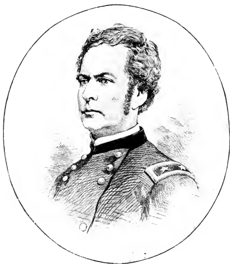
MAJOR-GENERAL JOSEPH HOOKER, U. S. A.