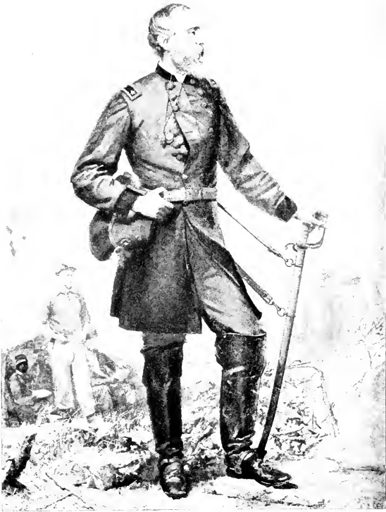
MAJOR GENERAL GEORGE G. MEADE, U. S. A.