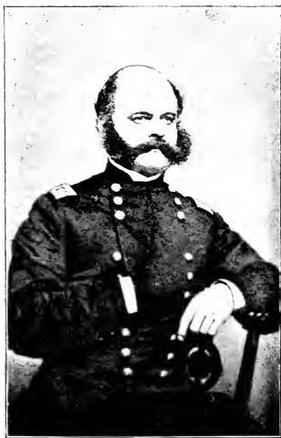
MAJOR-GENERAL A. E. BURNSIDE, U. S. A.