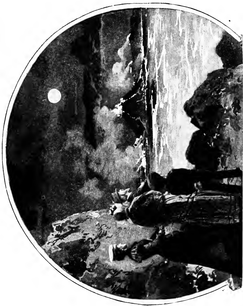
“Oh, Josiah,” sez I, “what a sight!” — Frontispiece. Page 125.