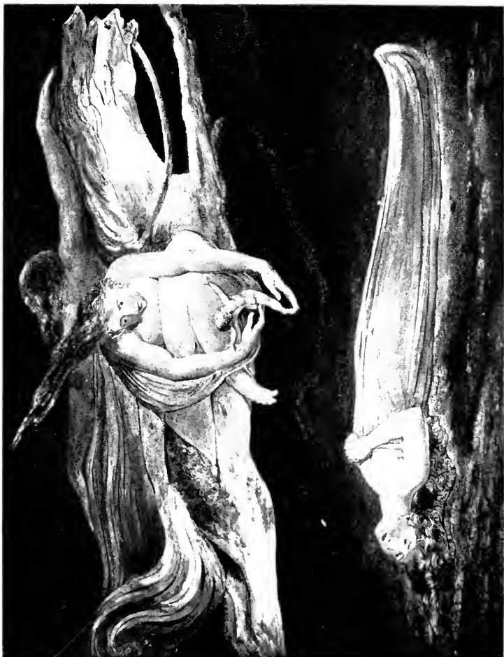
“PITY LIKE A NAKED NEW-BORN BARE, STRIDING THE BLAST, OR HEAVEN’S CHERUBIM HORSED UPON THE SIGHTLESS COURSERS OF THE AIR.”