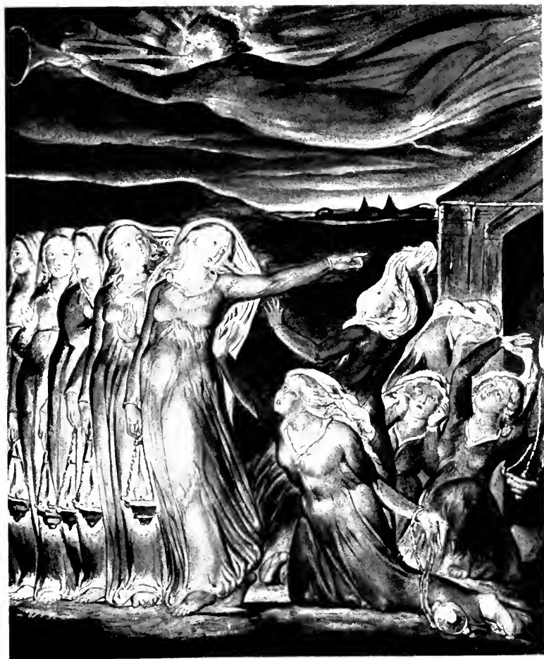
THE WISE AND FOOLISH VIRGINS