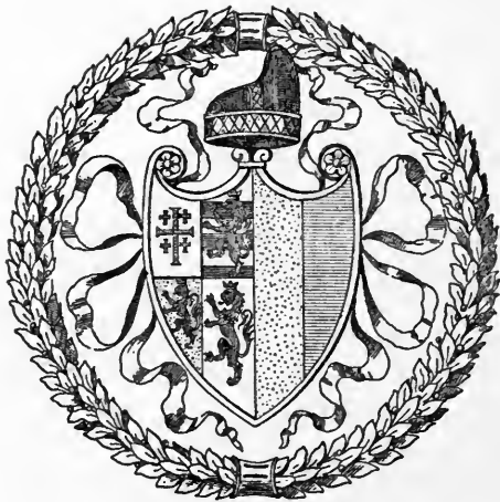
THE CORNARO COAT OF ARMS

Copyright, 1903 BY WILLIAM F. BUTLER All rights reserved