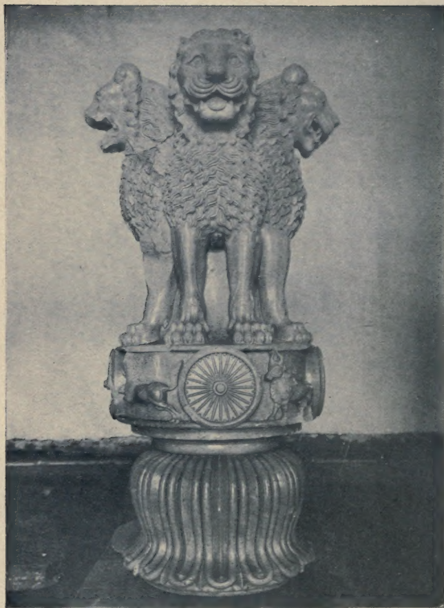
THE LION PILLAR CAPITAL OF SARNATH. (P. 56).