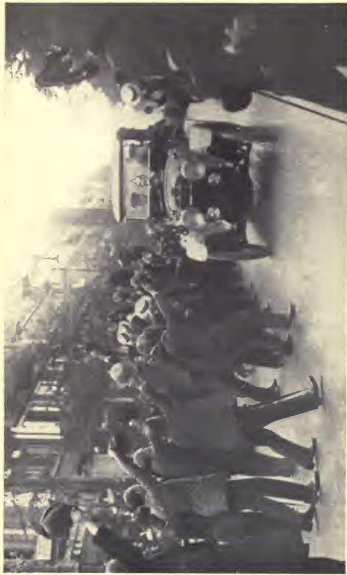
Greeting the Kaiser (in helmet) the day he declared Germany "in a state of war," July 31st, 1914.