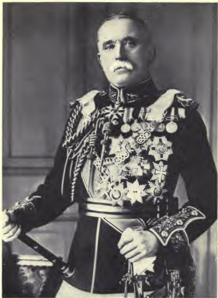
Sir John French.