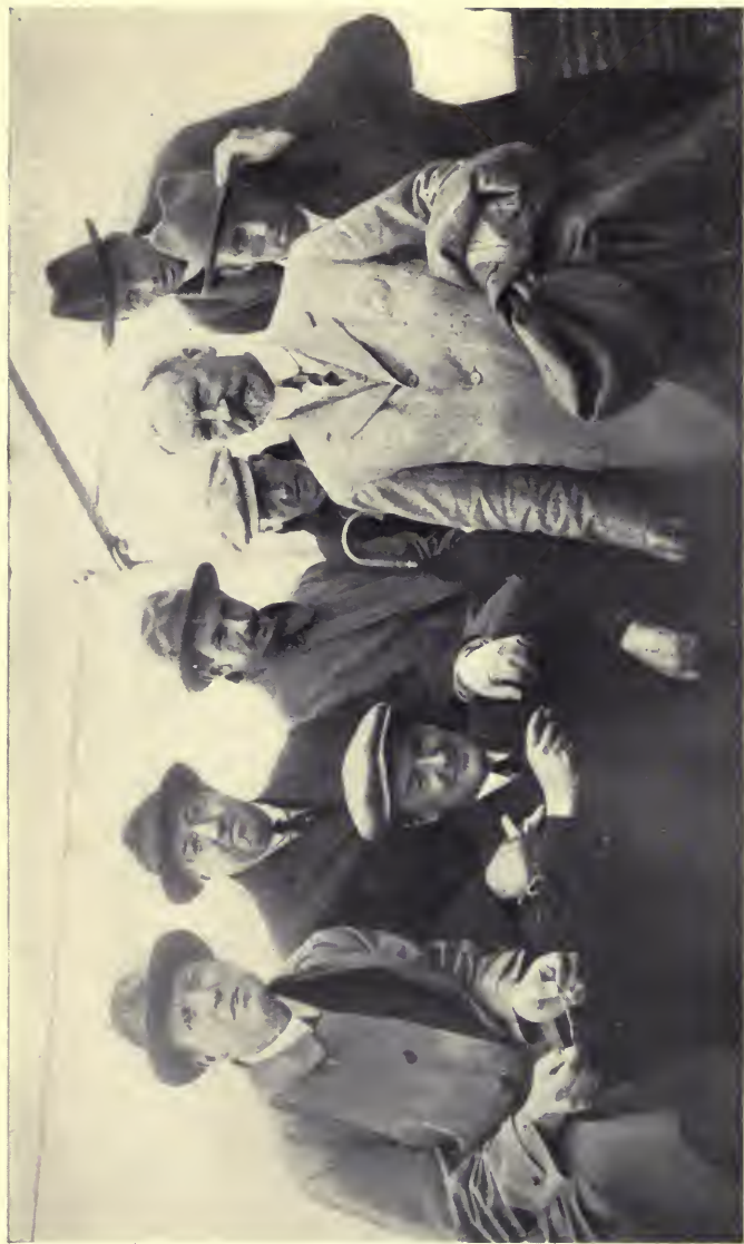
Berlin newspaper refugees on S. S. St. Petersburg.