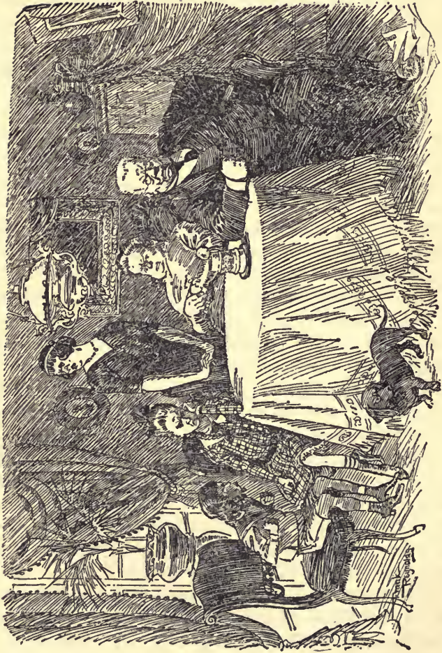
"A PRUSSIAN HOUSEHOLD AT THEIR MORNING HATE"—From London Punch