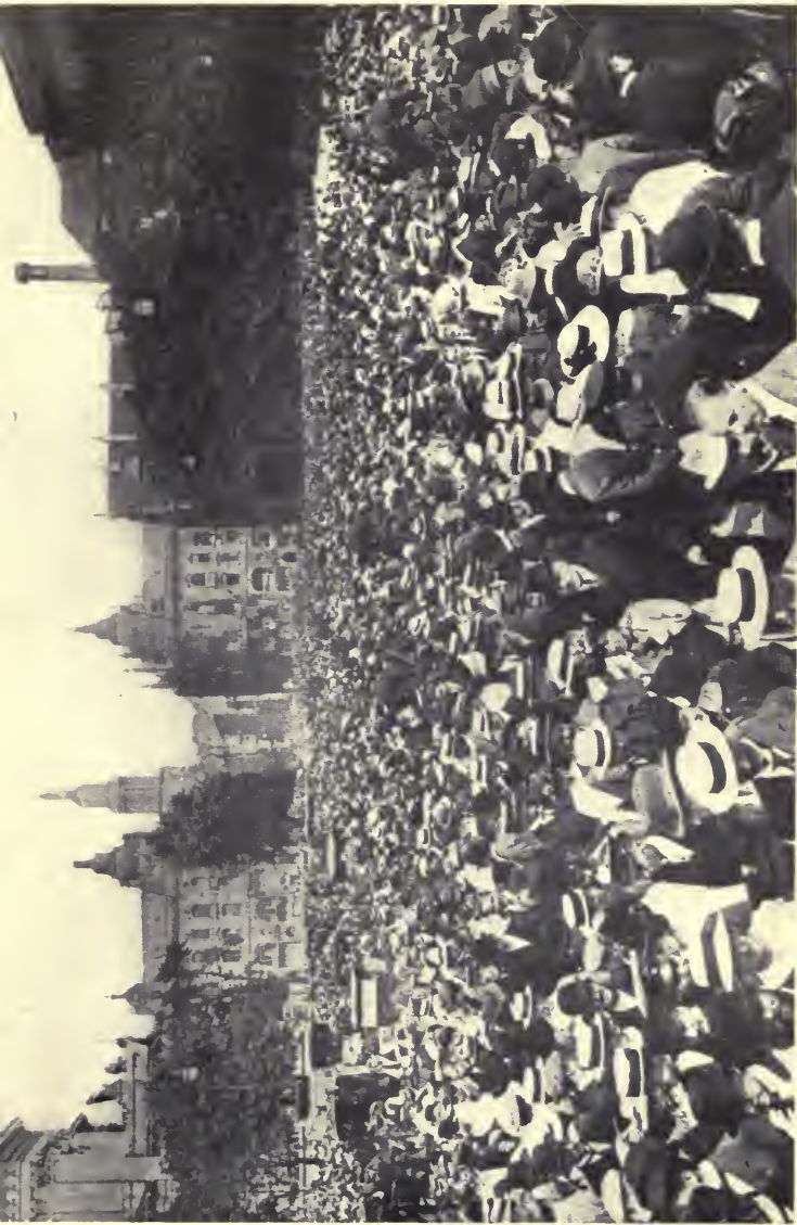
In front of the Royal Castle, Berlin, waiting for announcement of mobilization, August 1st, 1914.