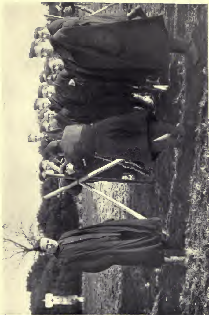
Soldiers in the making—aiming practice.