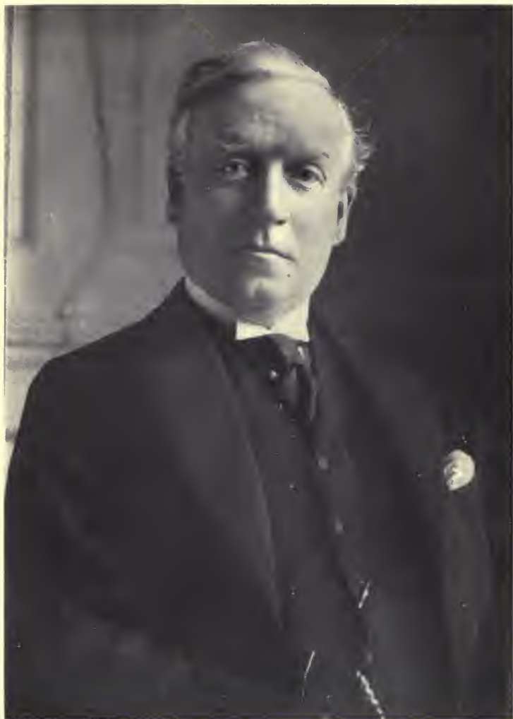
Herbert Henry Asquith.