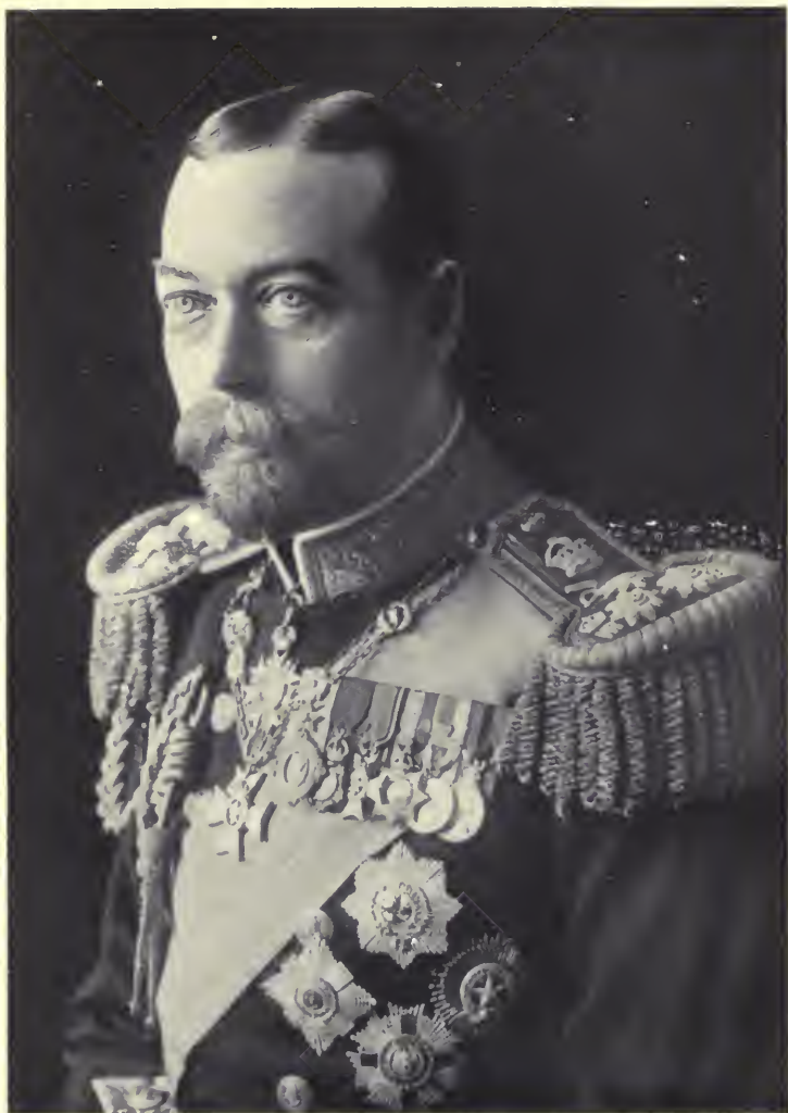
King George V.