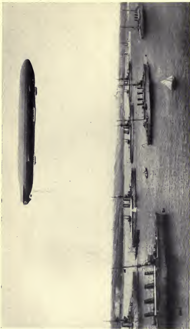
A naval Zeppelin cruising over the British squadron at Kiel.