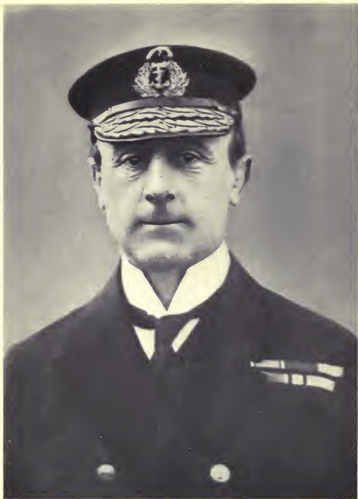
Sir J. R. Jellicoe.