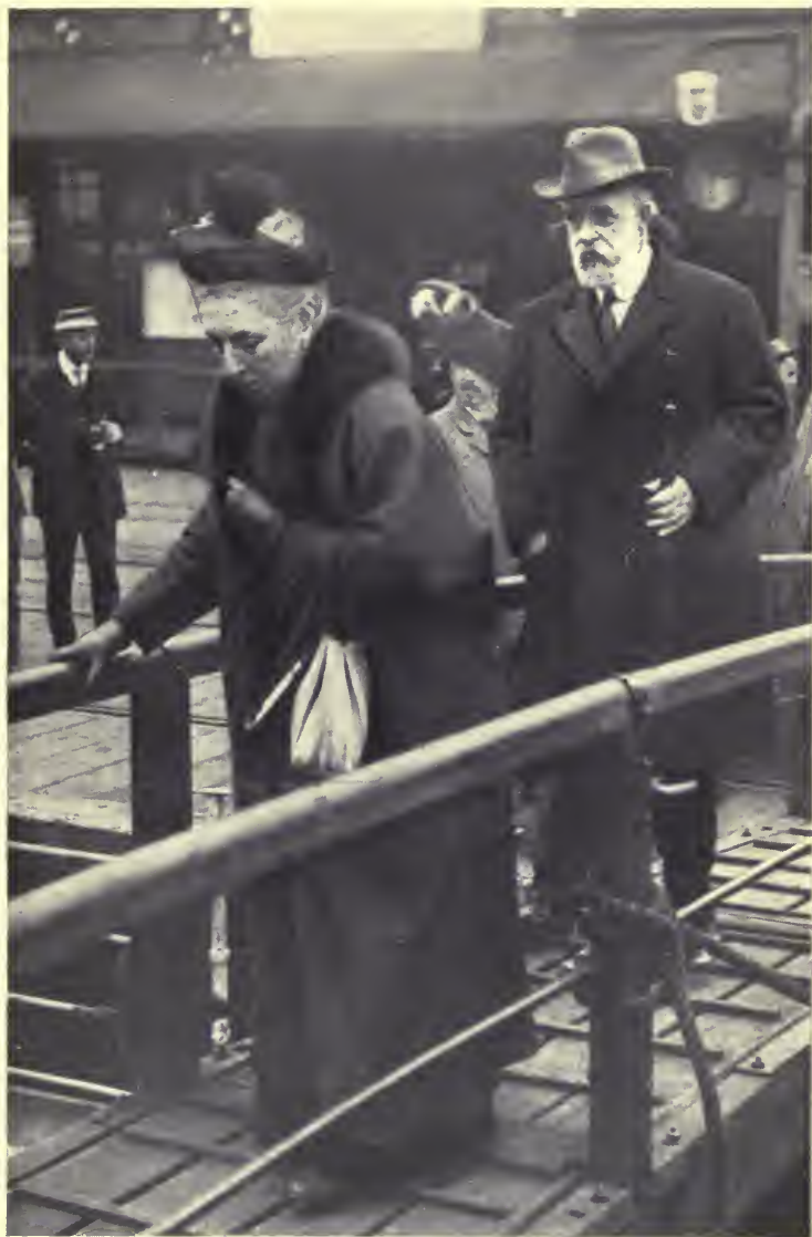
Sir Edward Goschen, late British Ambassador in Berlin, boarding S. S. St. Petersburg, en route to London, August 7th, 1914.