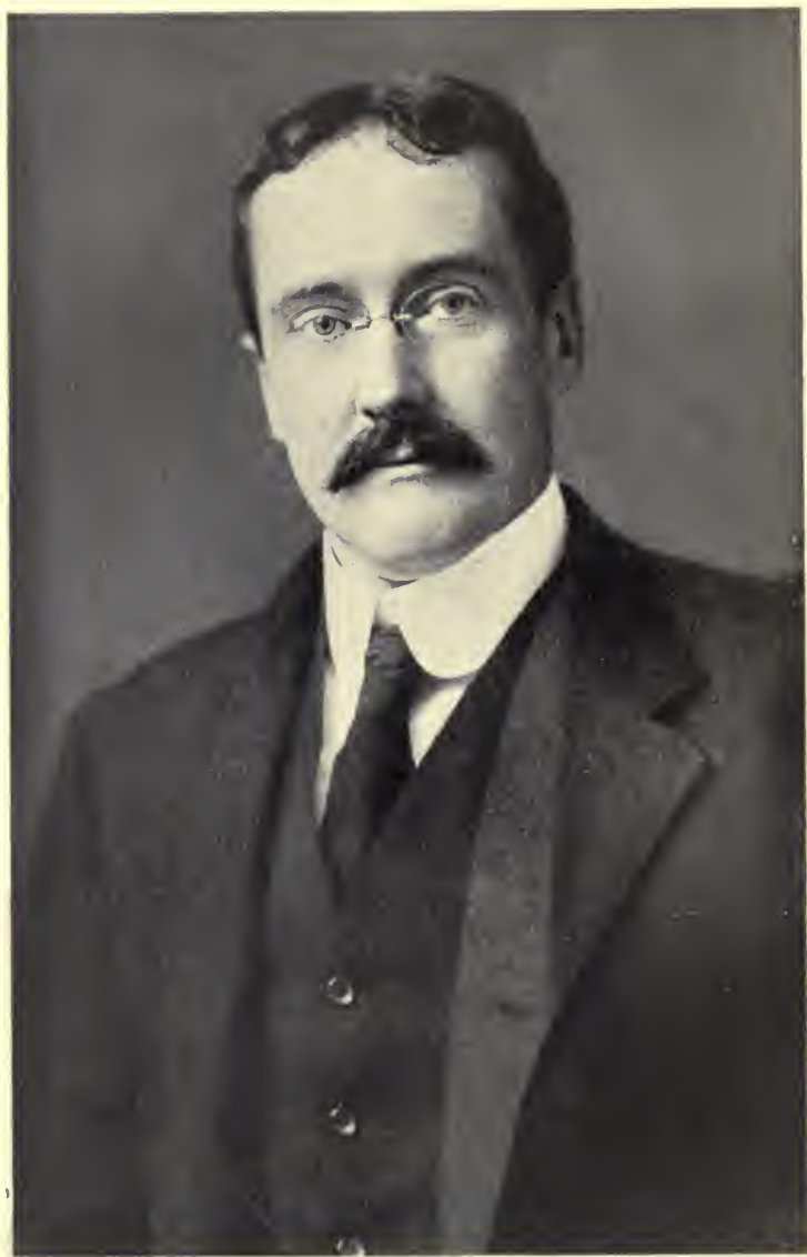
Ambassador Gerard.