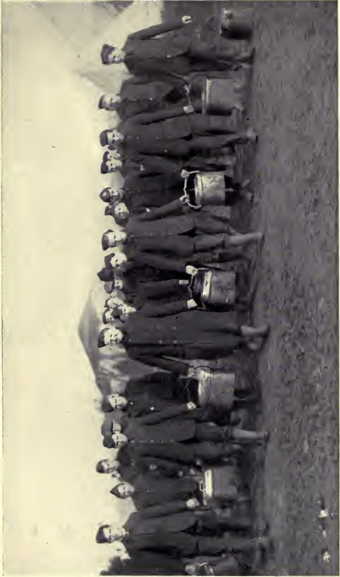
Soldiers in the making—11th Battalion cook-house.