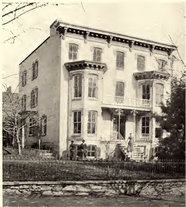
THE GAY STREET HOME