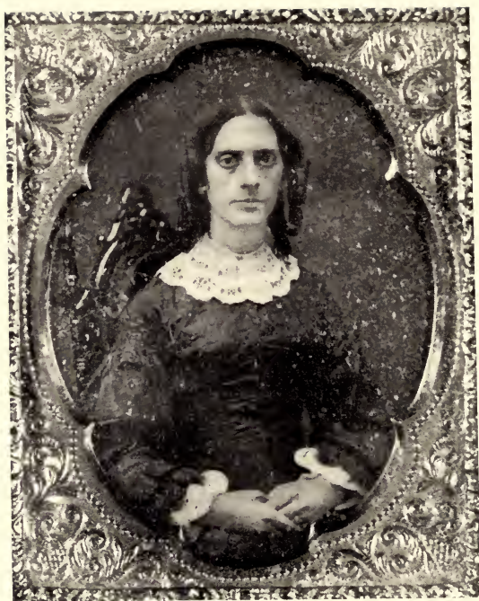
AN OLD DAGUERREOTYPE