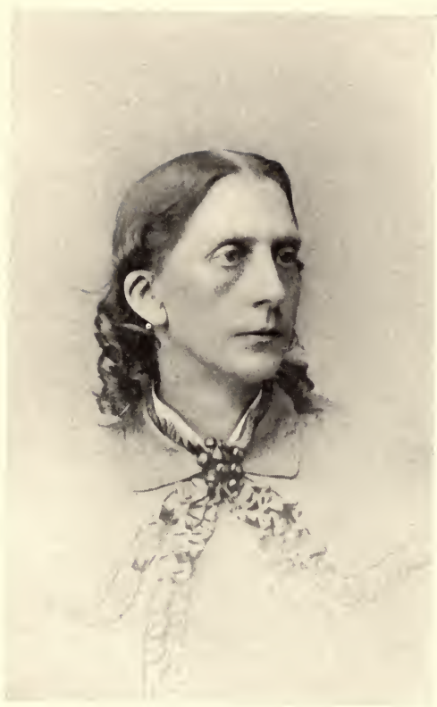
PHOTOGRAPH OF 1878