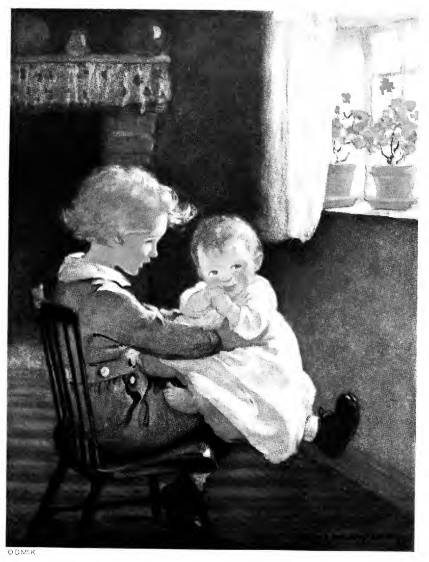
So Diamond sat down again and took the baby in his lap.