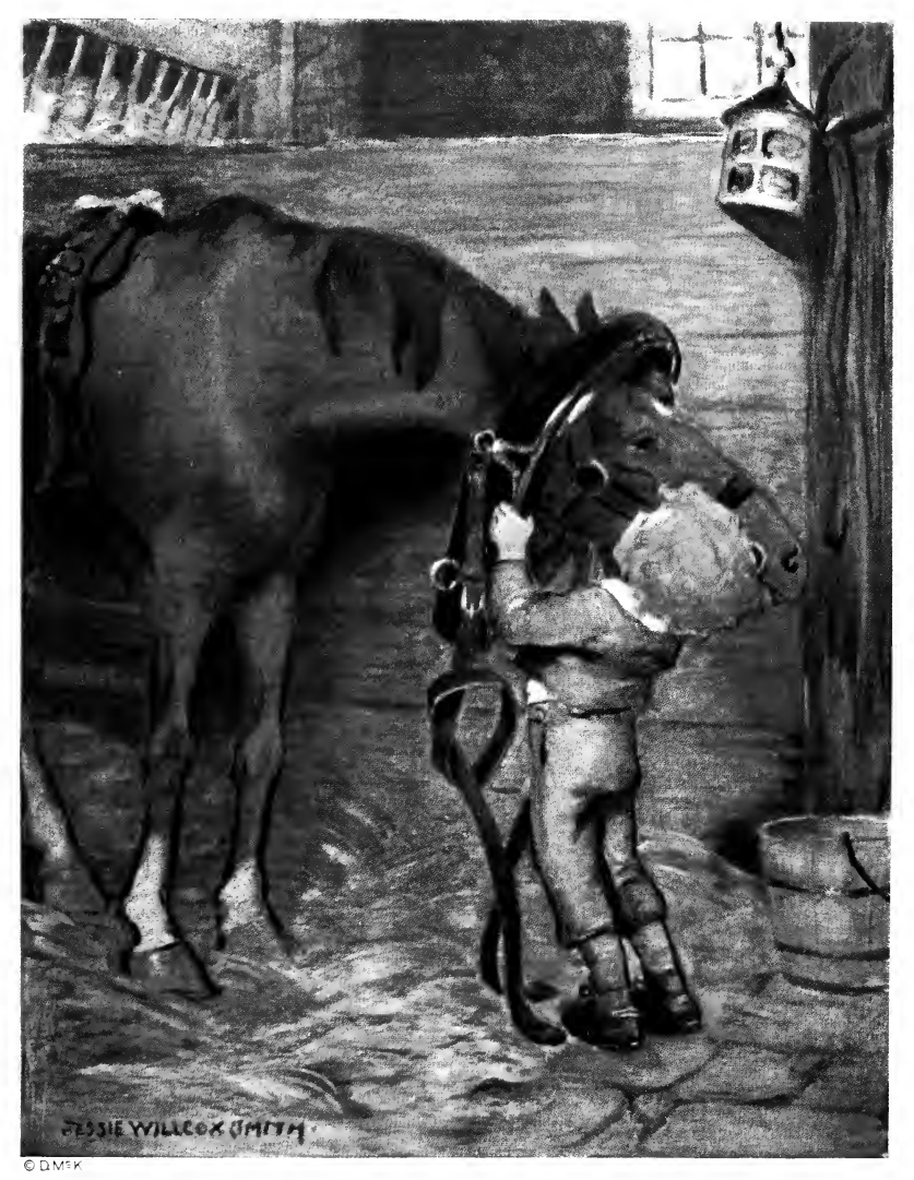
The collar was almost the worst part of the business.