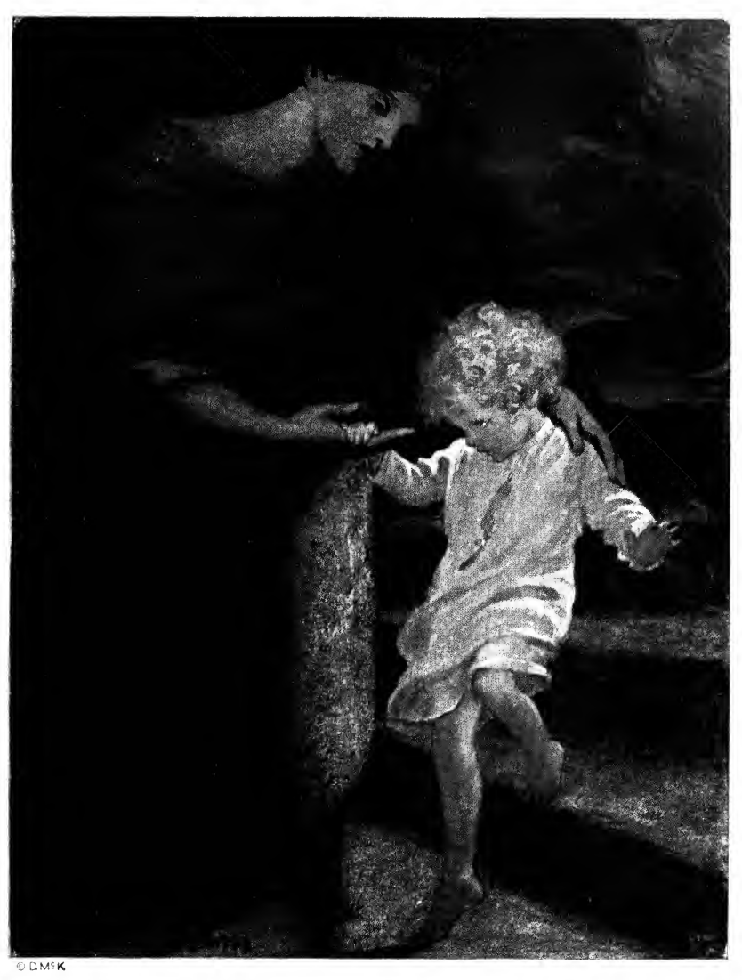
She took his hand, and giving him the broad part of the spiral stair to walk on, led him down a good way.