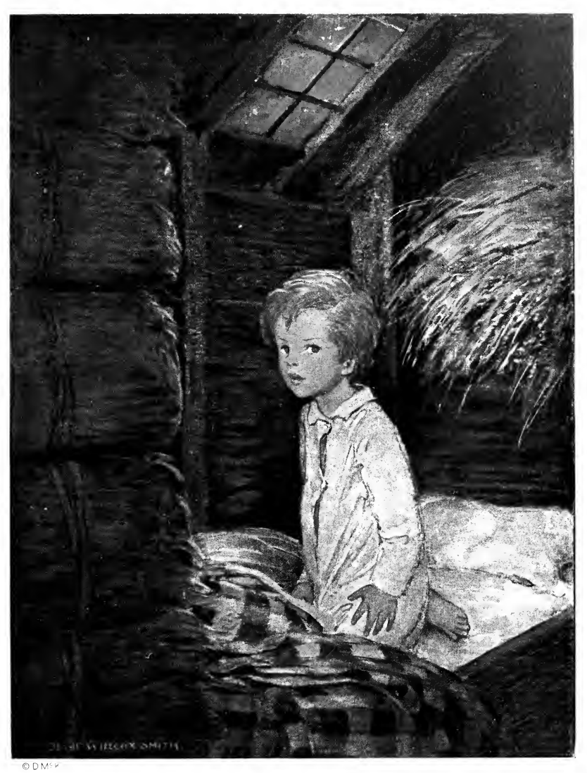
Against this he laid his ear, and then he heard the voice quite distinctly.