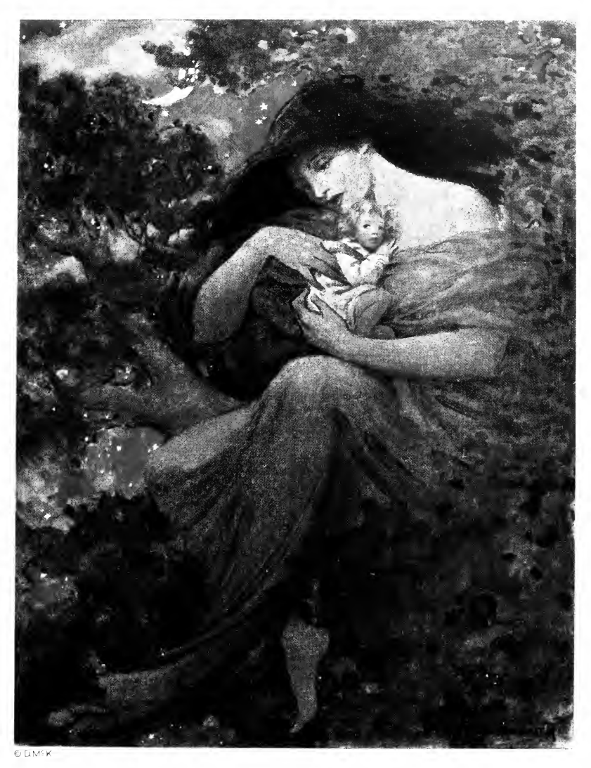
On the top of the great beech-tree.