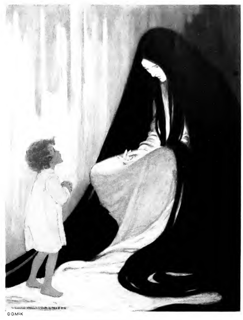
"Are you ill, dear North Wind?"