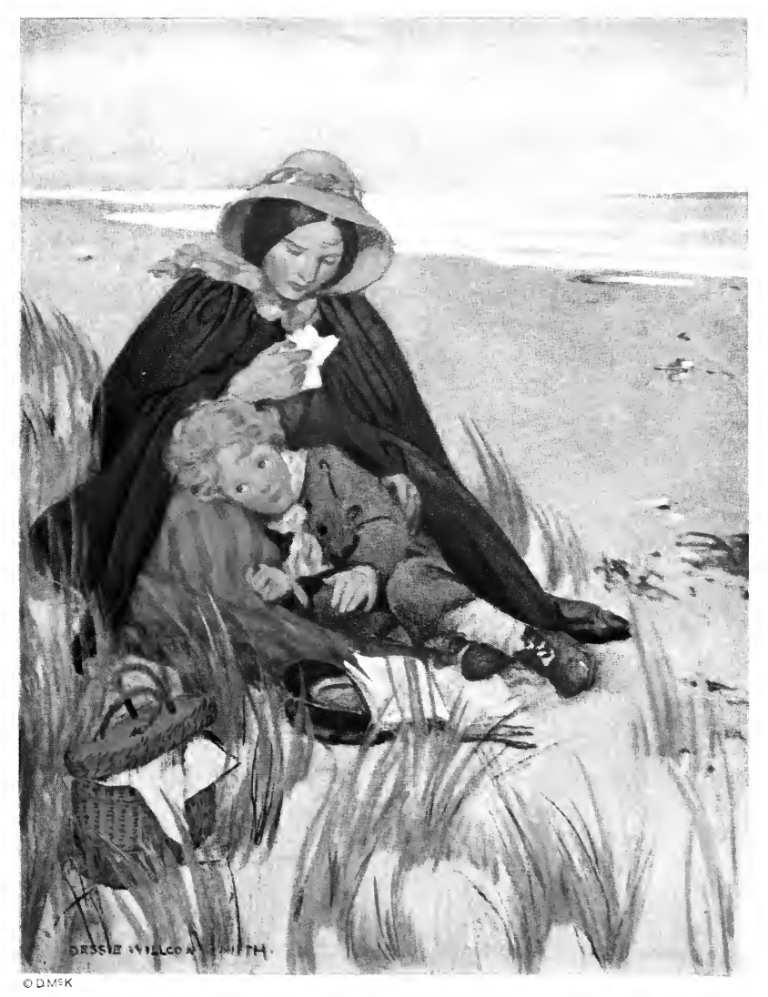
"Dear boy!" said his mother; "your father's the best man in the world."