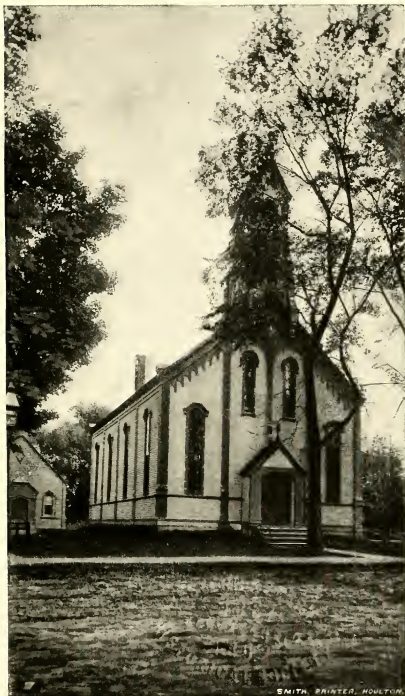
HOULTON MEETING HOUSE.