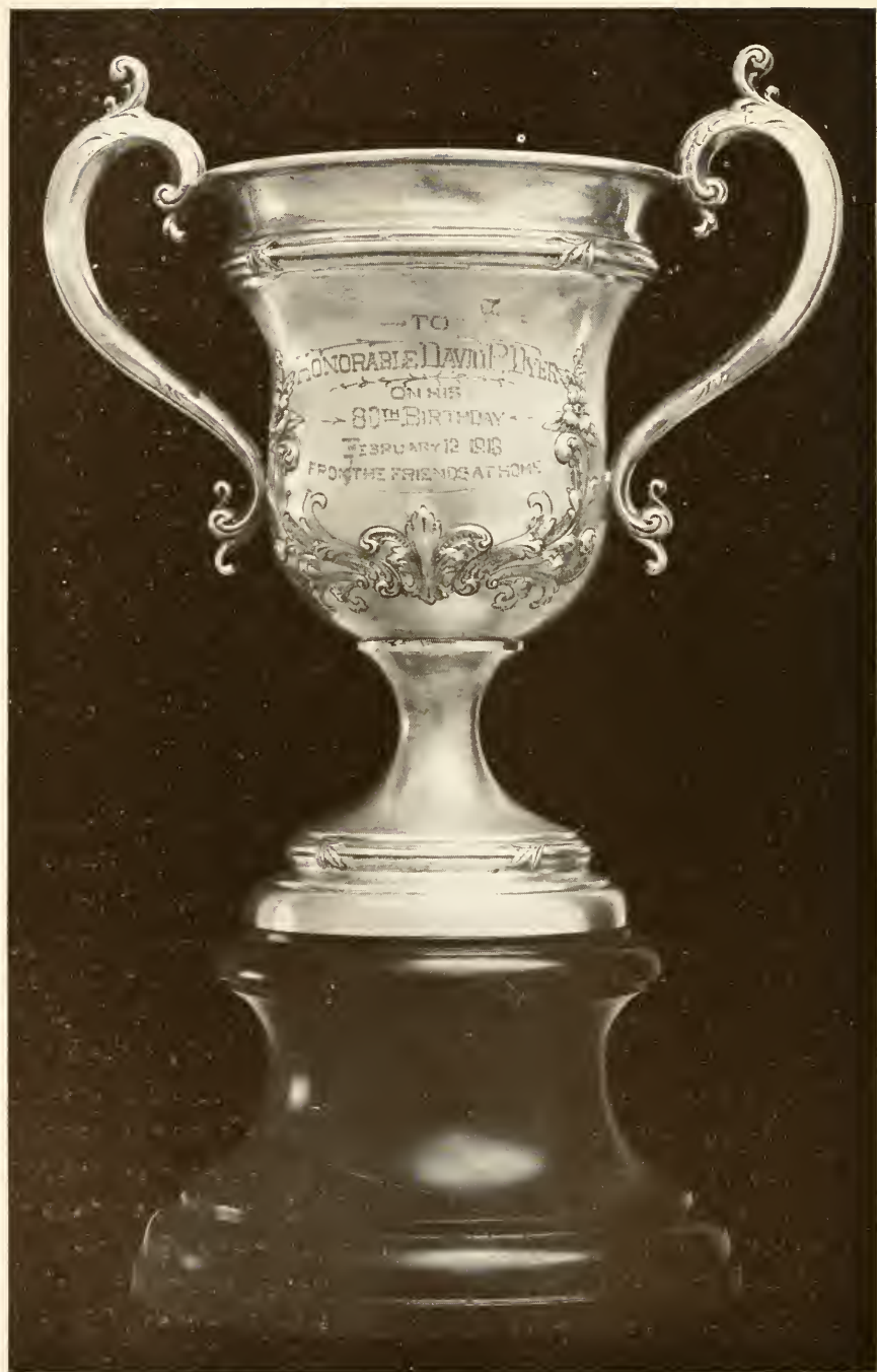
LOVING CUP PRESENTED BY FRIENDS FROM PIKE COUNTY, MISSOURI