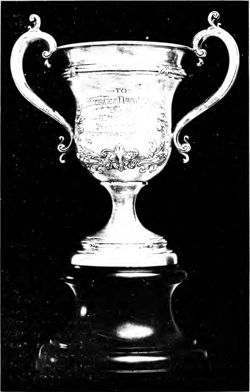
LOVING CUP PRESENTED BY FRIENDS FROM PIKE COUNTY, MISSOURI