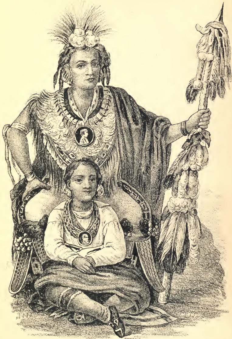
KEOKUK AND SON.