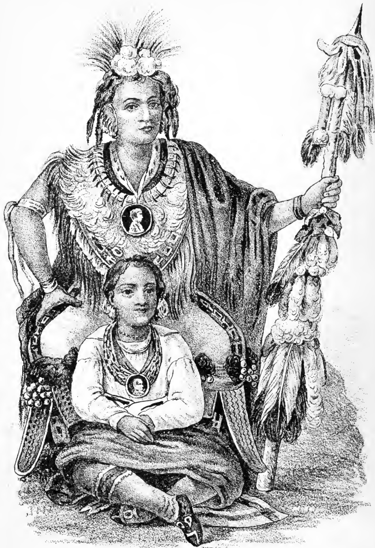
KEOKUK AND SON.