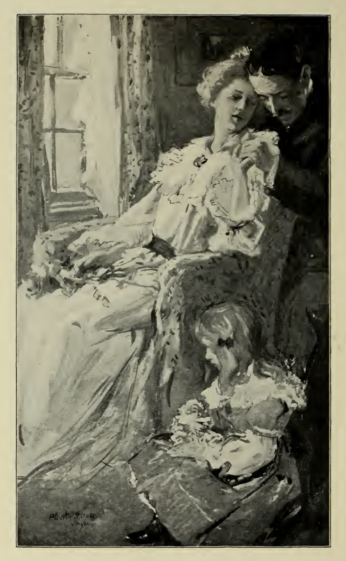
"YOU ARE SO GENEROUS TO ME" (page 24)