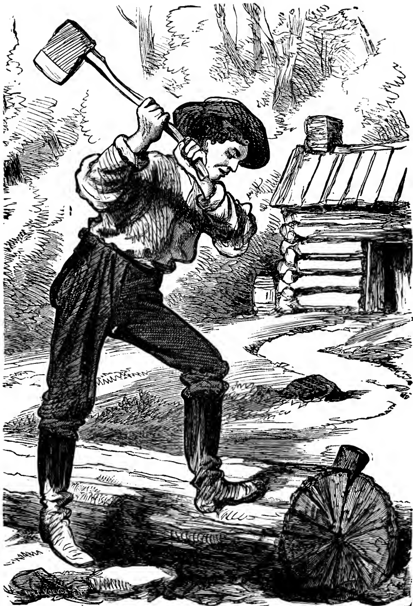
THE YOUNG RAIL SPLITTER. Page 57.