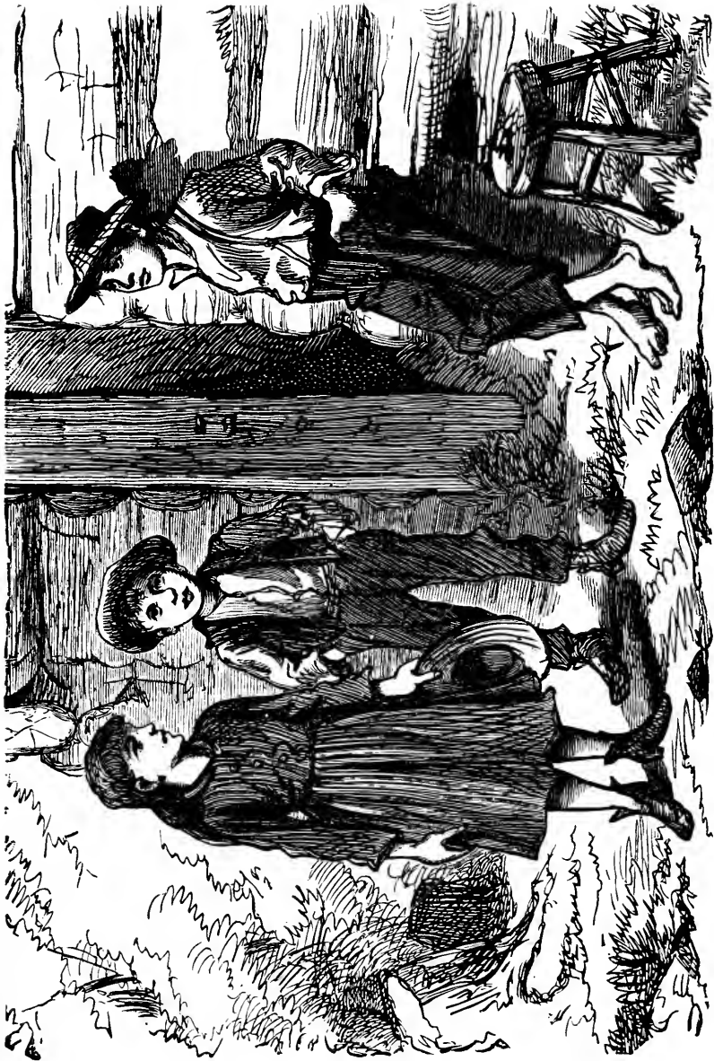
ABE'S EARLY HOME. THE LOG CABIN. Page 9.