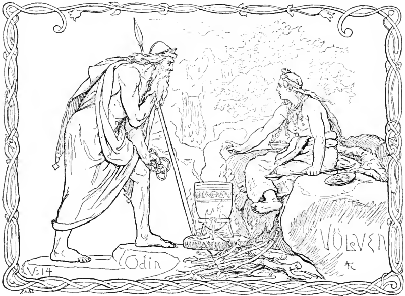
ODIN QUESTIONING VALA.

But Odin: "Speak, Vala! I shall bind thee with runes, that thou answer, For yet I must learn of his slayer."