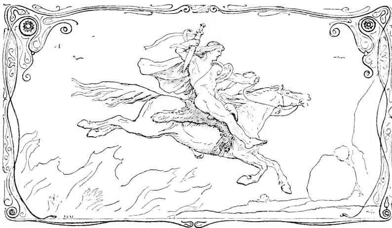
HERMOD DEPARTING FOR HELL.

In the meantime fleet Sleipner sped northward, And never he stopped or turned back As he galloped through valleys, o'er chasms, Save once, at the Bridge, where a herald, Its keeper, called "Hail!" to challenge His passing. "I am Hermod! To Hel