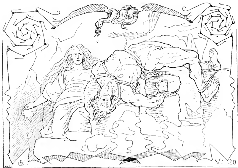
SIGYN, LOKE AND THE SERPENT.

reproaches the Asas with their own wrong doing,