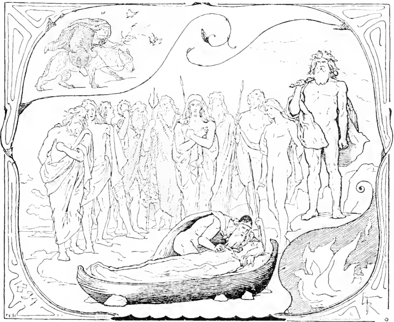
ODIN WHISPERING RUNES TO BALDER DEAD.

And when it had passed their horizon And Day went, and Night came, blackshrouded,