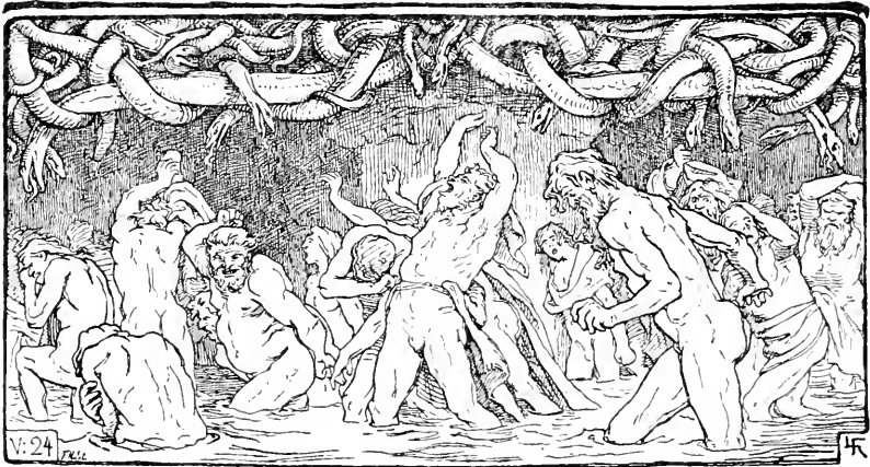
SLID, RIVER OF VENOM.

And now Hermod continued his journey To offer Frigg's ransom to Hel, Through Slid he swam, River of Venom, And kingdom and kingdom he traversed Till he came to the lowest and darkest, The Ninth, where Hel dwells in Anguish, Her palace, and feasts at Famine, Her banqueting-board, and rules From Despair, her black throne, double seated And canopied, waiting a mate— But a mate will there never be found To rule in that kingdom despairing, For sole of her kind is Queen Hel.