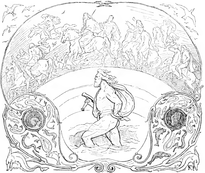
THE ASAS ASCENDING TO ASGARD OVER BIFROST.

But Loke relents not, and speaks not, Save when, her cup overflowing