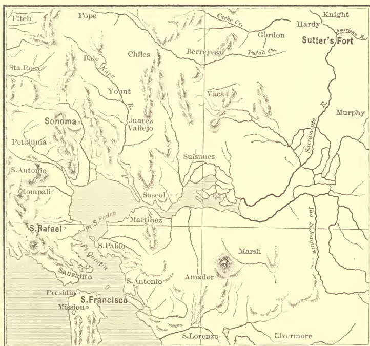
REGION NORTH OF BAY.

a sample of what could be done, so as in the main to avoid bloodshed, could not be effectual unless the enemy were allowed an advantage of five to one; and even then a retreat must be feigned" 11 ! Soon it was learned that Todd also had been captured through the treachery of a guide employed to conduct him to the coast. 11 Ford tells us, being confirmed in this particular by Carrillo's testimony already cited, that two