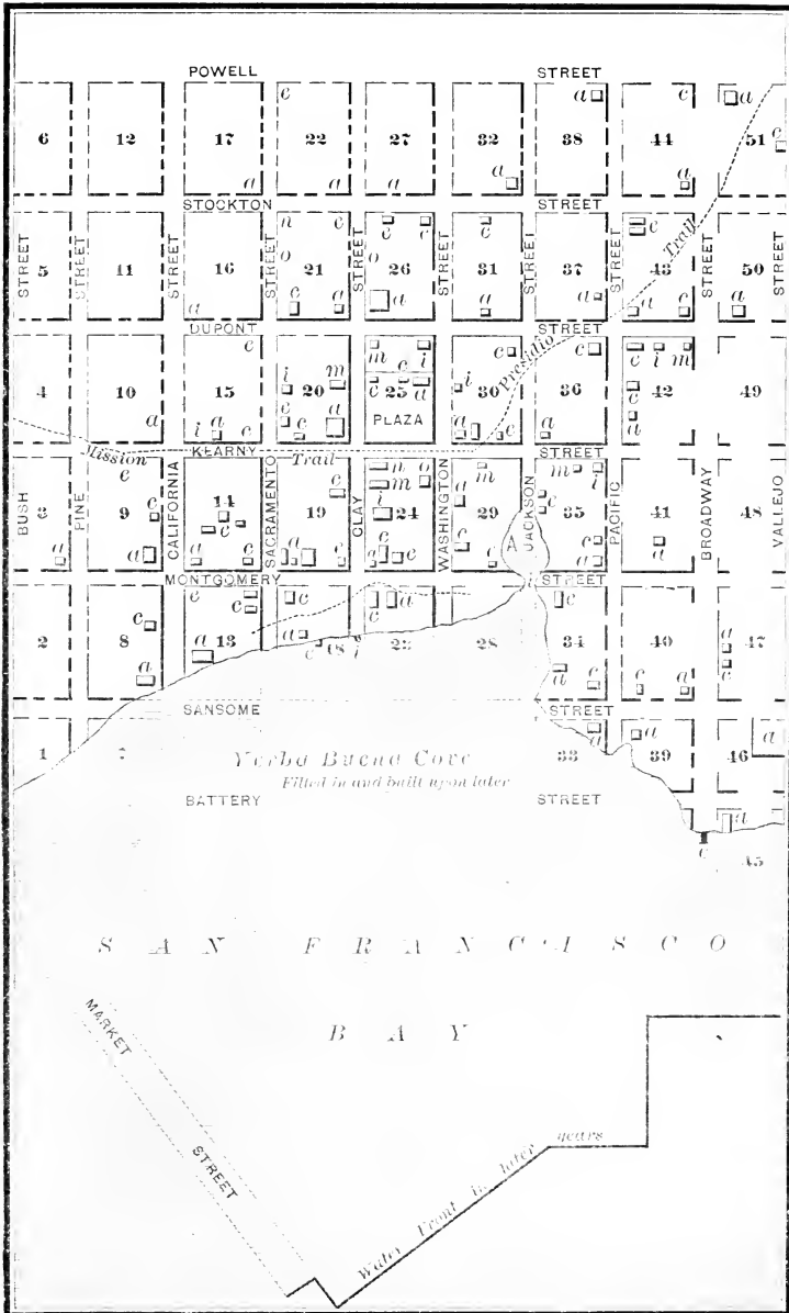
SAN FRANCISCO IN 1848.