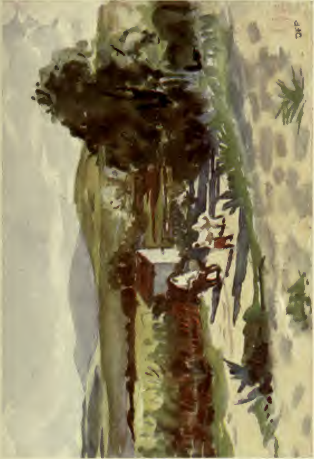
THE FEZ ROAD OUTSIDE TANGIER