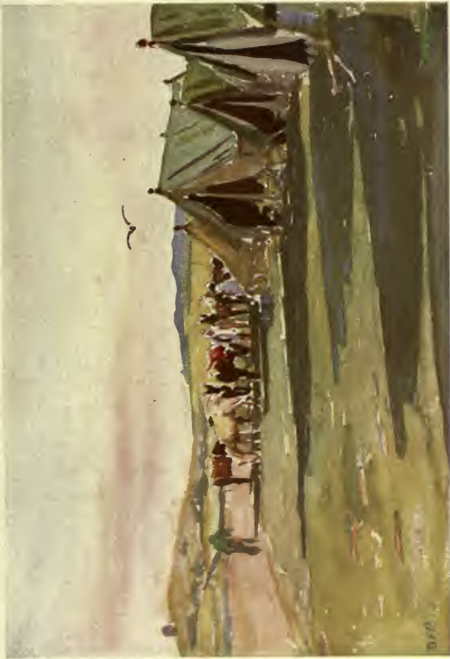
OUR CAMP AT ELCAZAR