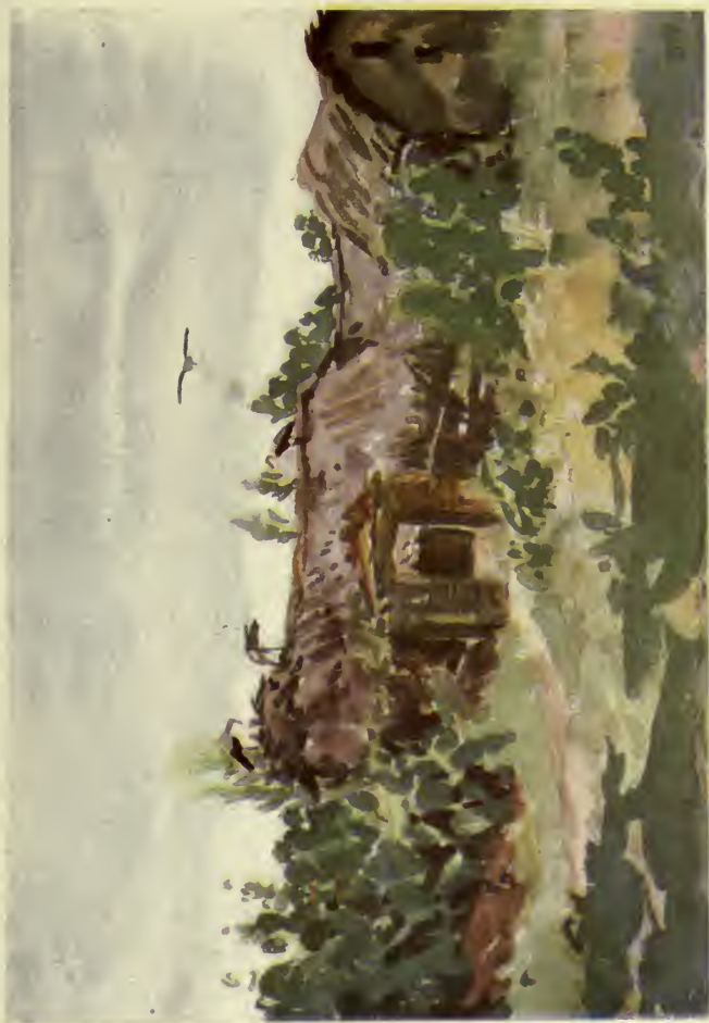
A MOORISH HUT