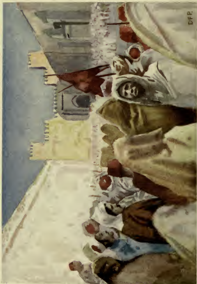
SULTAN AB-DEL-AZIZ RECEIVES THE TRIBES AT FEZ