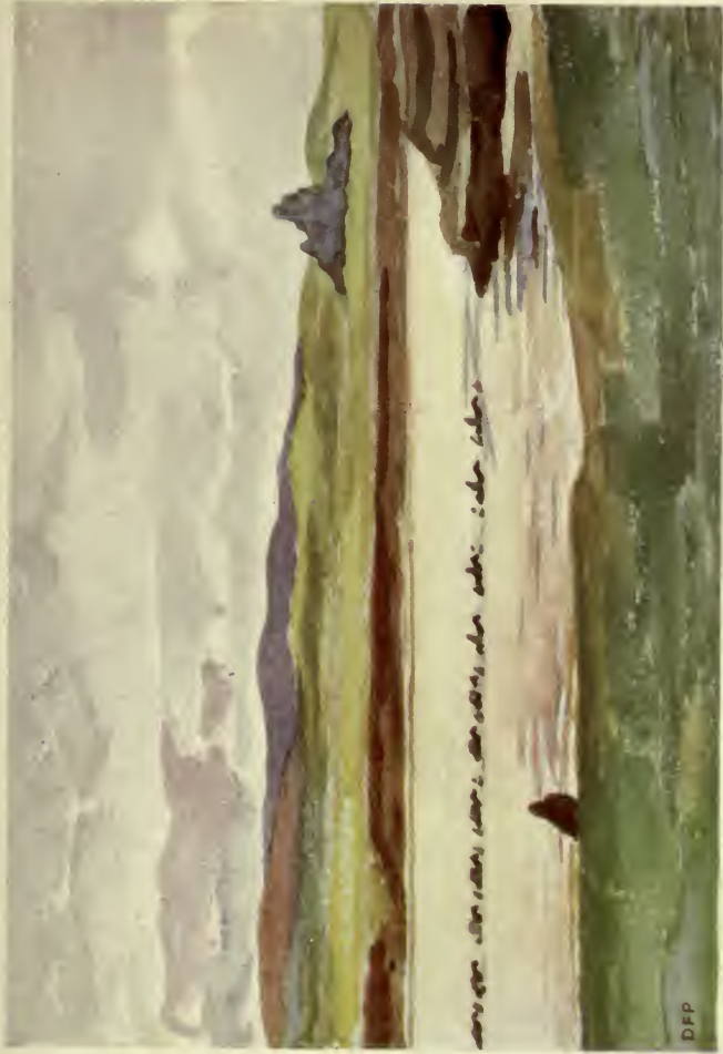
CROSSING THE SEBU