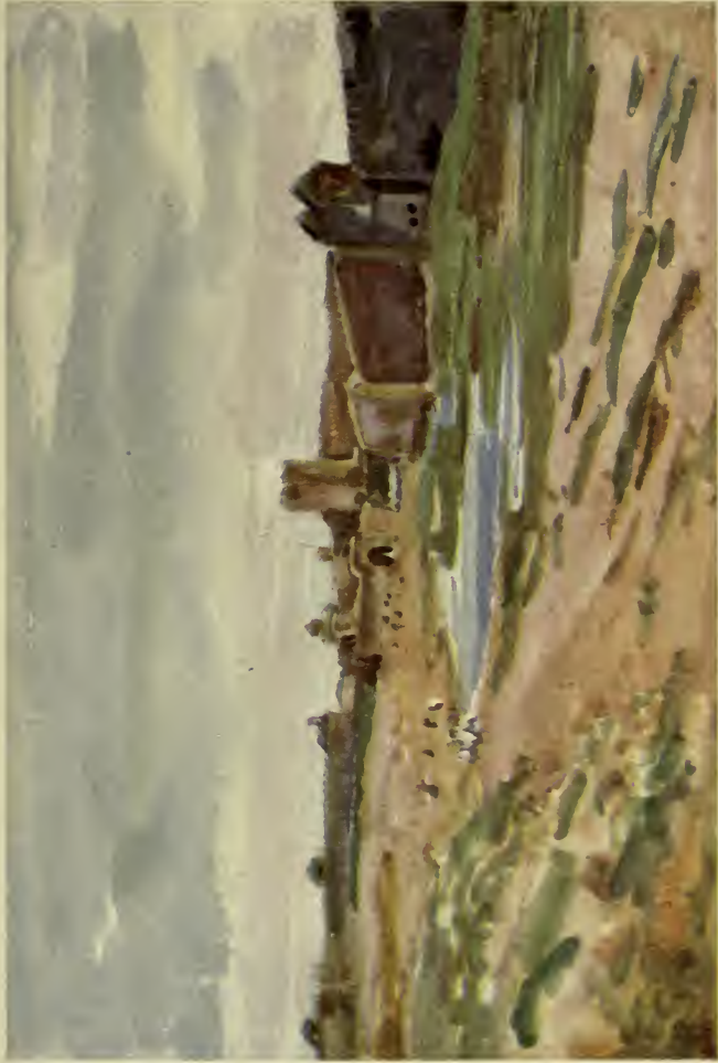
NORTHERN ENTRANCE TO FEZ