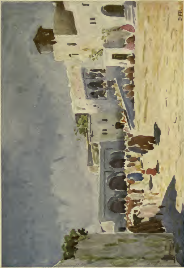
THE KASBAH, TANGIER