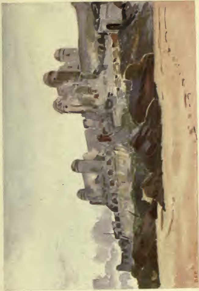
THE FORT AT LARASH