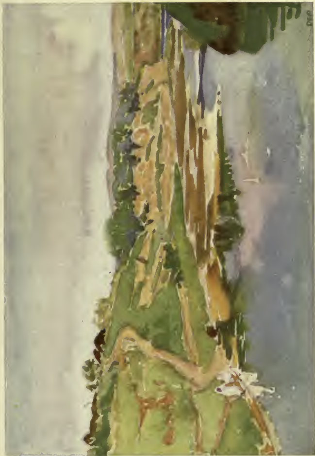
A PLEASANT CAMPING SPOT