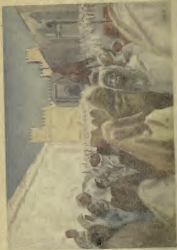
SULTAN AL DEL-AZIZ RECEIVES THE BRITISH CONSUL