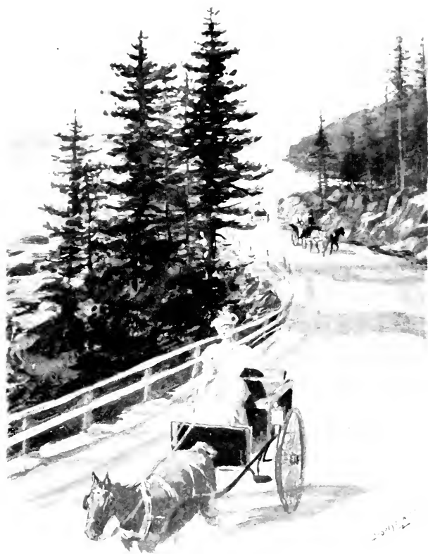
On the Corniche Road