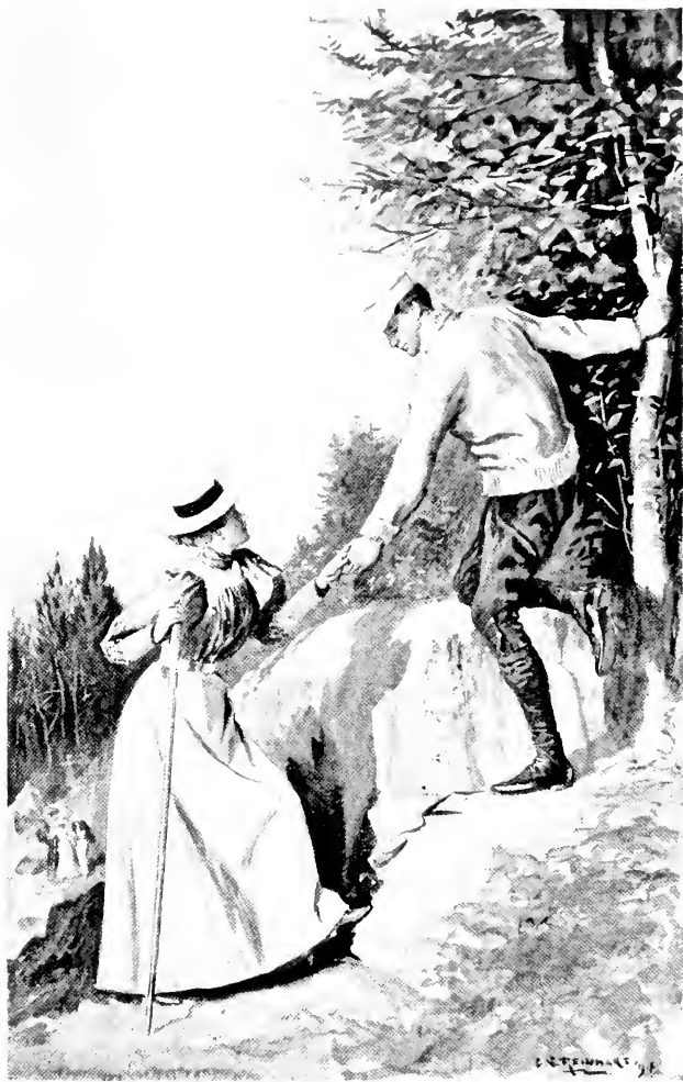
Climbing Newport Mountain