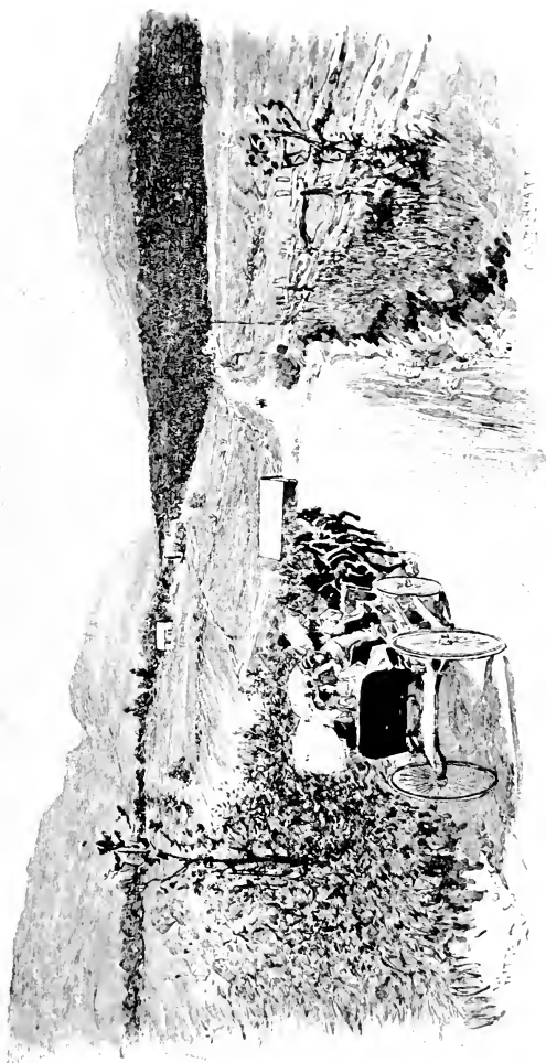
A Buckbeard Party