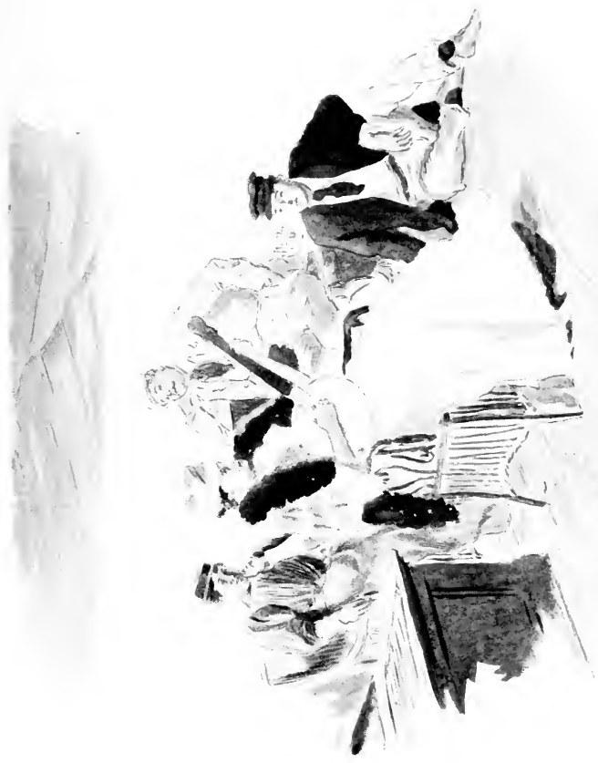
A Yachting Party