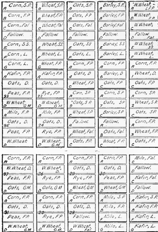
FIG. 2.—Diagram of the dry-land rotation field at the Amarillo Field Station. The lettering shows the cropping practiced in 1914. The explanation of the abbreviations used after the name of a crop is as follows: D.—Disked, Fal.—summer tilled, F. P.—fall plowed, G. M.—green manured, L.—listed, M.—manured, S. P.—spring plowed, S. S.—subsoiled.

The yields given in these tables begin with the second year of crop production at each station. All crops are produced the first year on land under uniform treatment. In some cases an entire crop has been lost by hail. These years are not considered in computing averages, as the crops under all methods alike were destroyed.