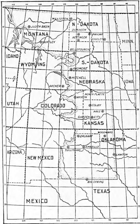
FIG. 1.—Sketch map of the Great Plains area, which includes parts of ten States and consists of about 400,000 square miles of territory. Its western boundary is indicated by the 5,000-foot contour. The location of each field station within the area is shown by a dot within a circle (⊙).

Another climatic factor of much importance in crop production on the Plains is the distribution of the rainfall, which within certain limits is more important than the total amount. A relatively low rainfall properly distributed may produce a crop where a much higher rainfall coming with unfavorable distribution may result in a crop failure, each starting with the same amount of available water in the