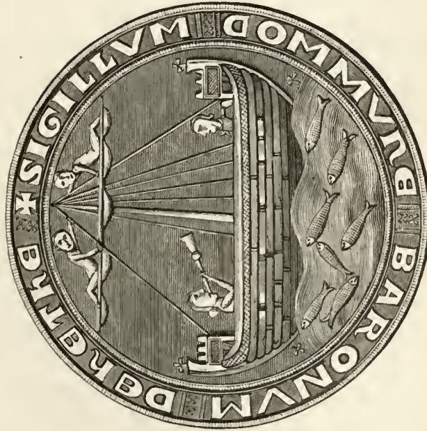
THE COMMON SEAL OF THE BOROUGH OF HYPHE.