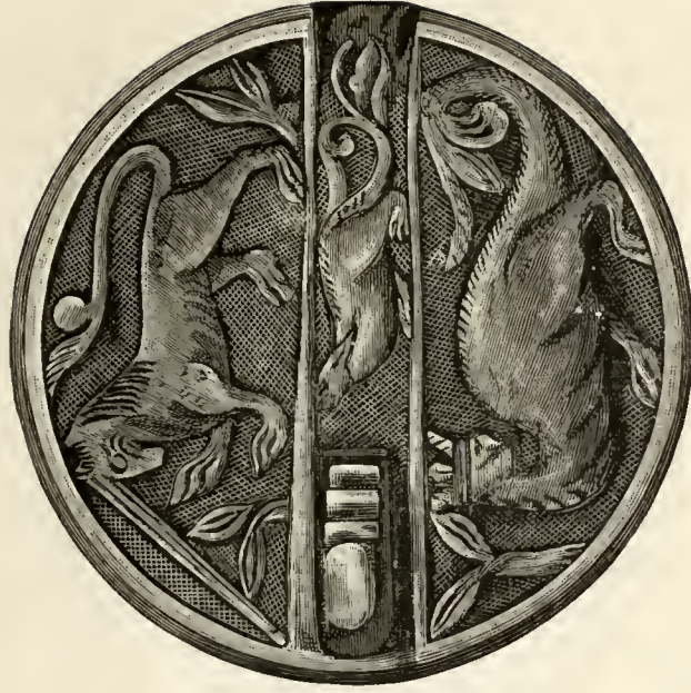
THE REVERSE OF THE SEAL.