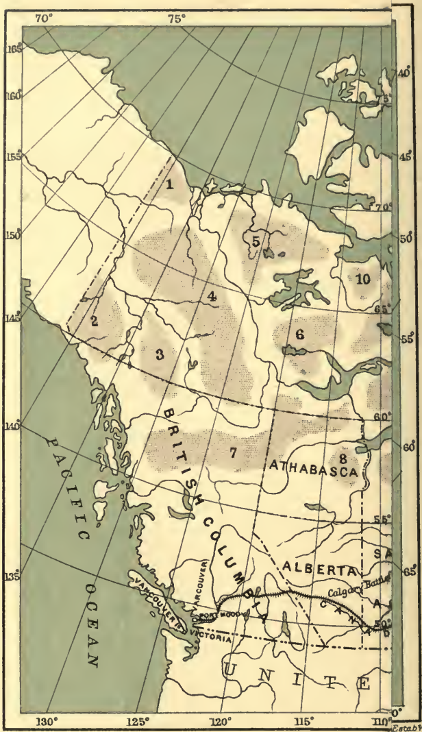
DOMINION OF CAN