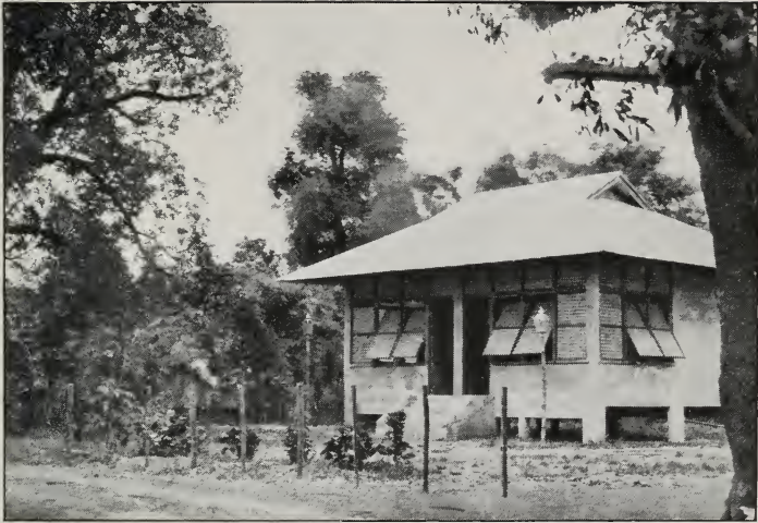
Bureau of Education, Manila, P. I. A permanent barrio school building.