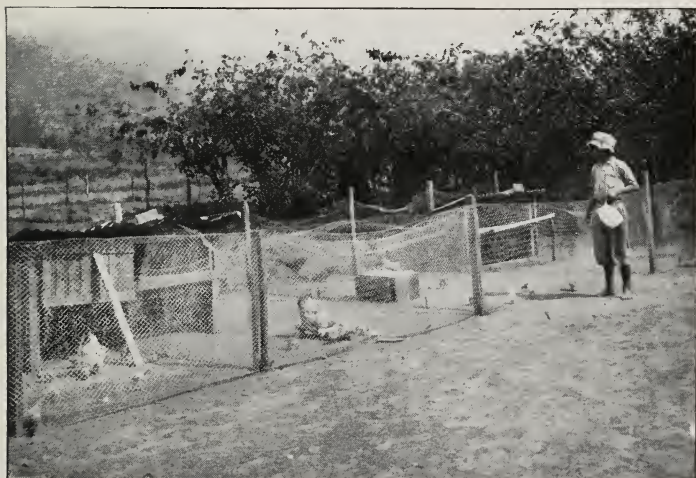
Bureau of Education, Manila, P. I.