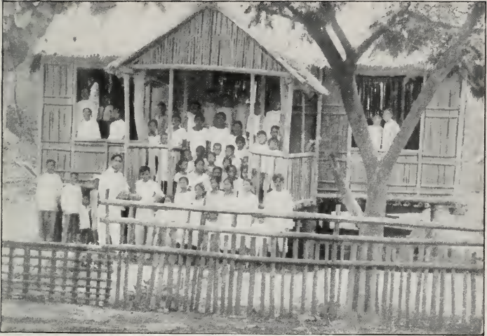
Bureau of Education, Manila, P. I. A temporary barrio school building.