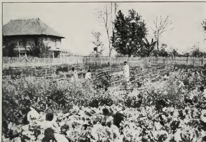
Bureau of Education, Manila, P. I.