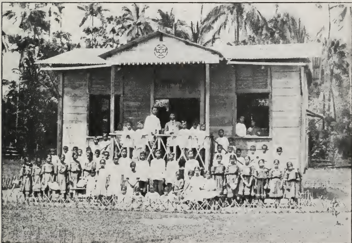
Bureau of Education, Manila, P. I. A barrio schoolhouse built from voluntary contributions of barrio people.