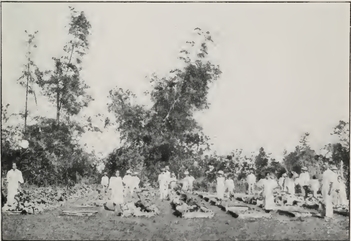
Bureau of Education, Manila, P. I. School garden at Lingsat, barrio of San Fernando, Union.