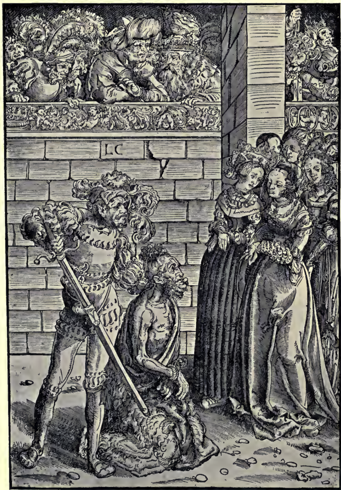
AN EXECUTION AT THE TIME OF THE REFORMATION.