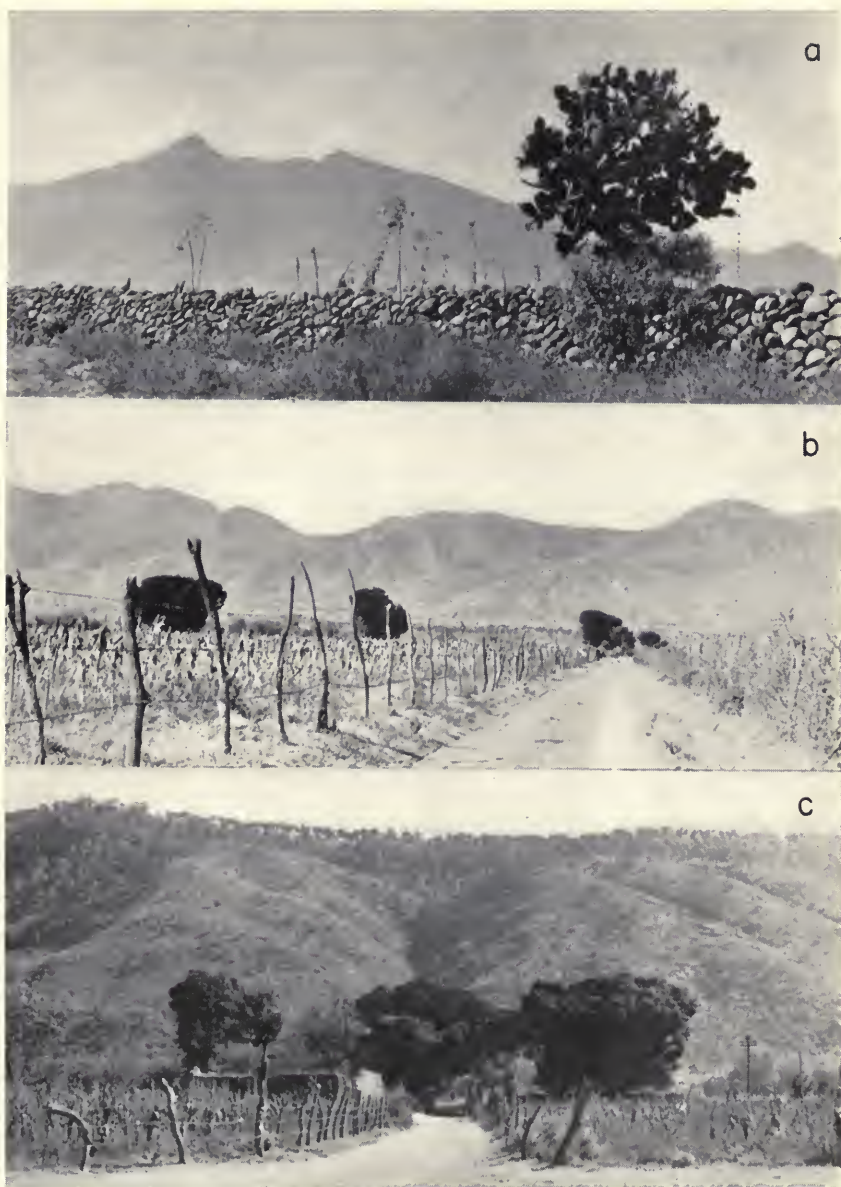
FIG. 146. a , View from the Ciudad Guzmán basin to the southwest. Volcán de Colima in the distance. b , View of basin showing scattered fig trees frequented by fruit-eating bats. c , Eastern edge of basin showing feeding habitat of Enchisthenes harti , Artibeus j. jamaicensis , A. cinereus toltecus , Sturnira lilium parvidens , and Micronycteris megalotis mexicana .