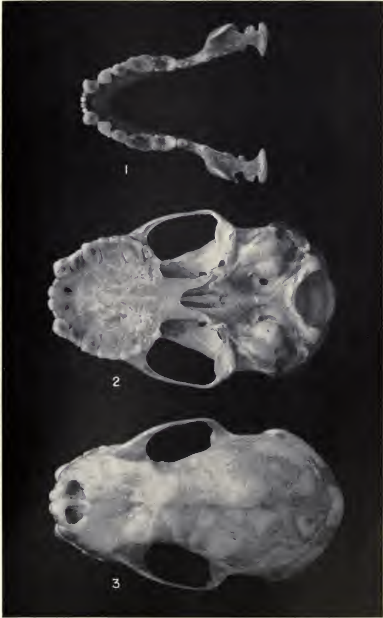
Enchisthenes harti : 1, mandible; 2, ventral surface of skull; 3, dorsal surface of skull. \times 4 .