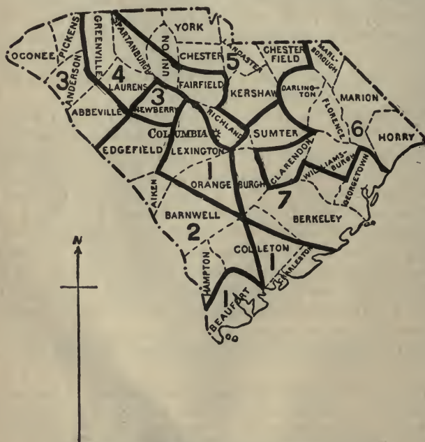
An illustration of "compact and contiguous territory."