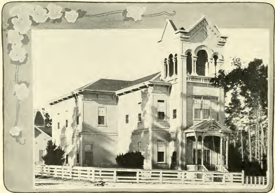
A public school