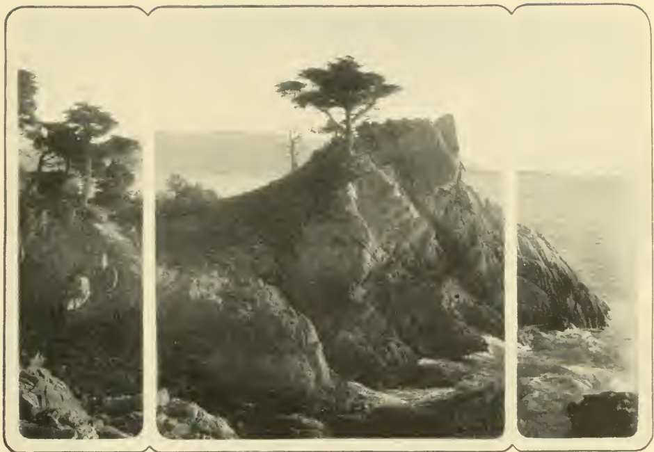
"Midway Point on the Seventeen-mile Drive"