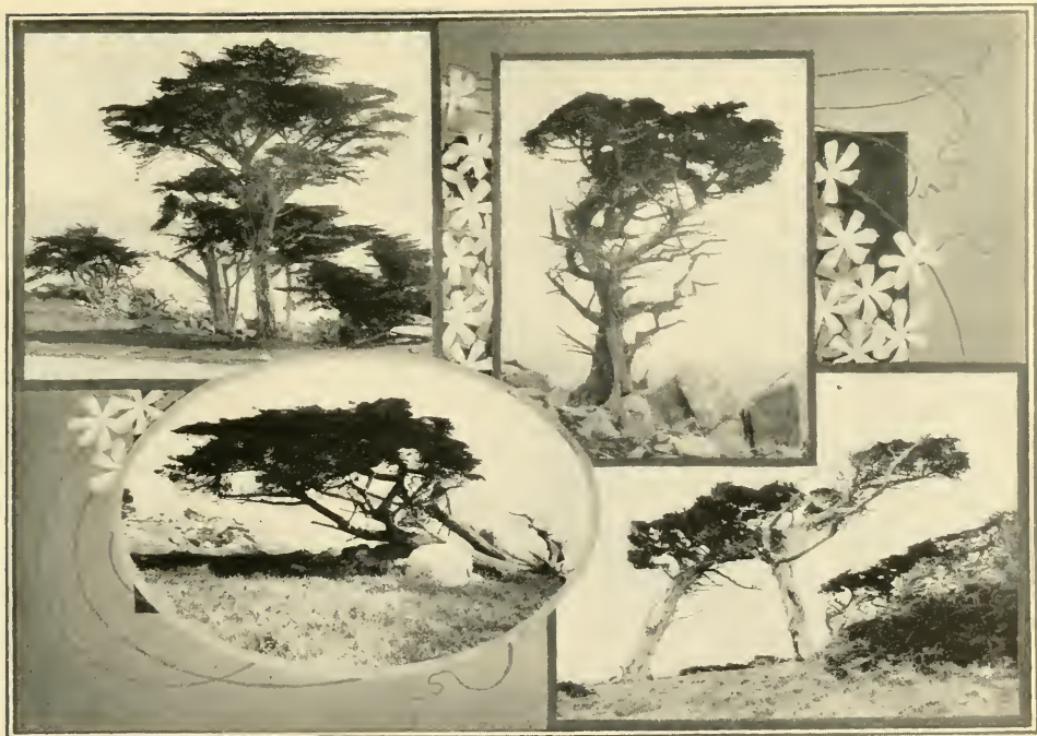
"Cypress Grove—gnarled giants, mighty in stature and hoary with age"