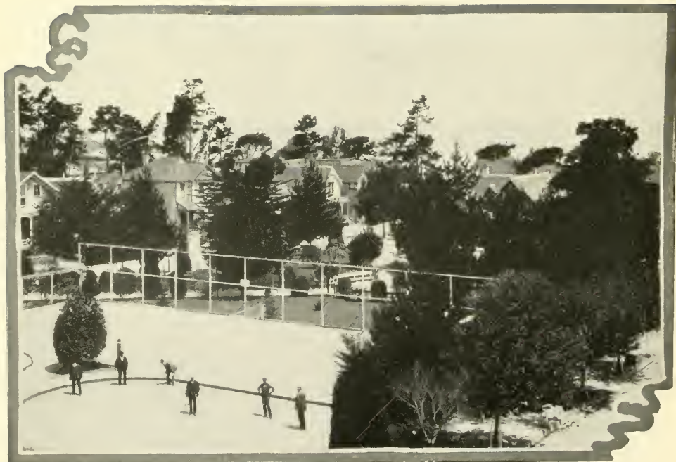
"Well-kept tennis and croquet grounds"