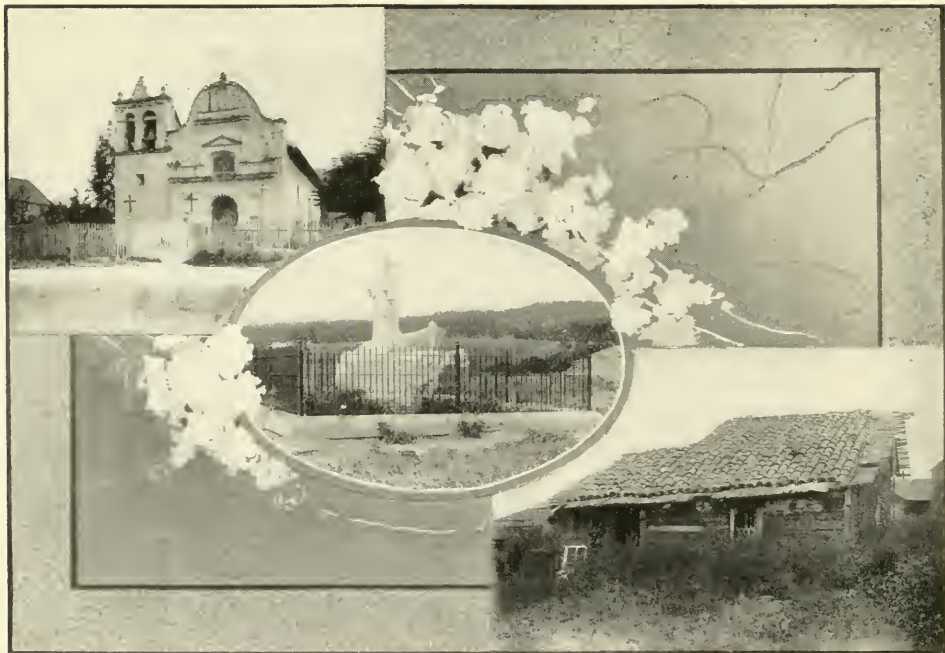
Remnants of the past