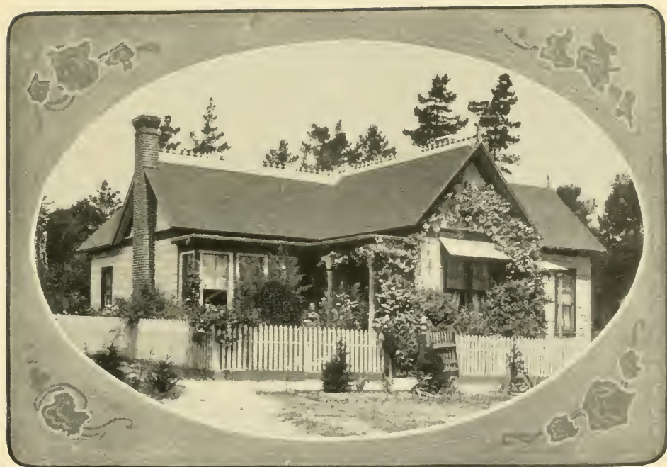
A vine-clad cottage