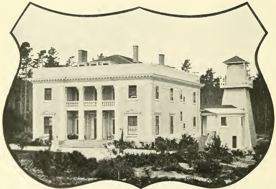
John Tennant Memorial Home