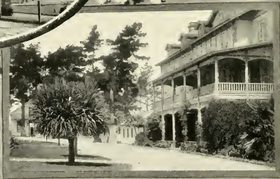
"The elegant and commodious El Carmelo"