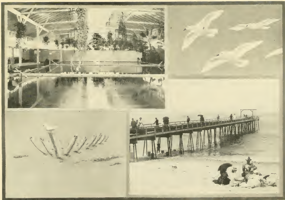
Bathing, summer and winter