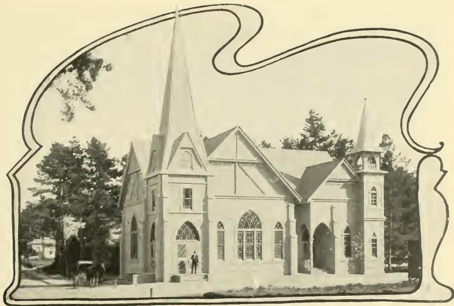
Mayflower Congregational Church