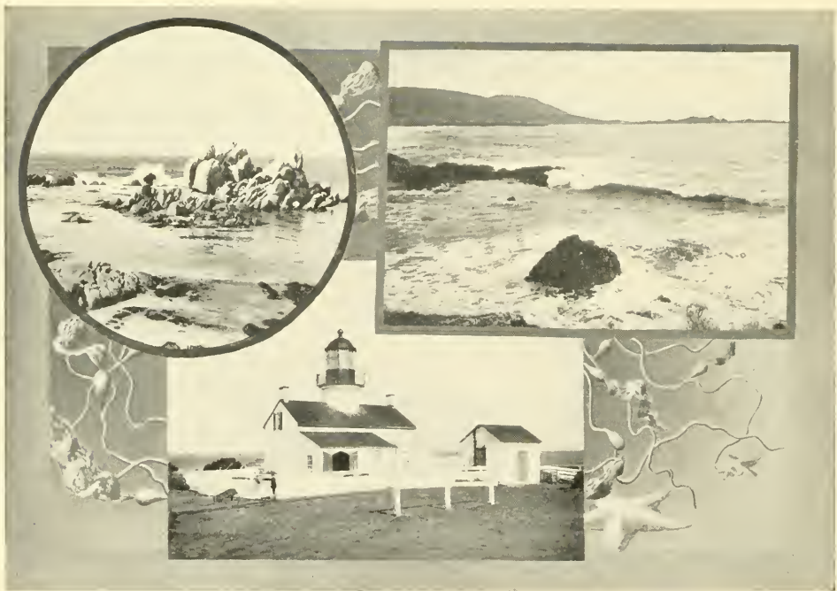
"From the lighthouse, along the surf-beaten shore"