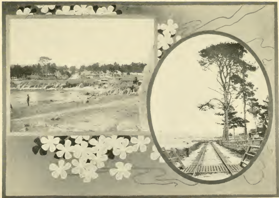
"Along a wondrous shore"