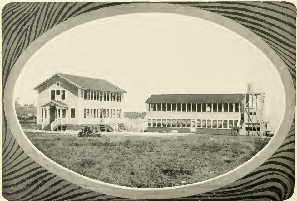
Hopkins' Seaside Laboratory, largest on the coast