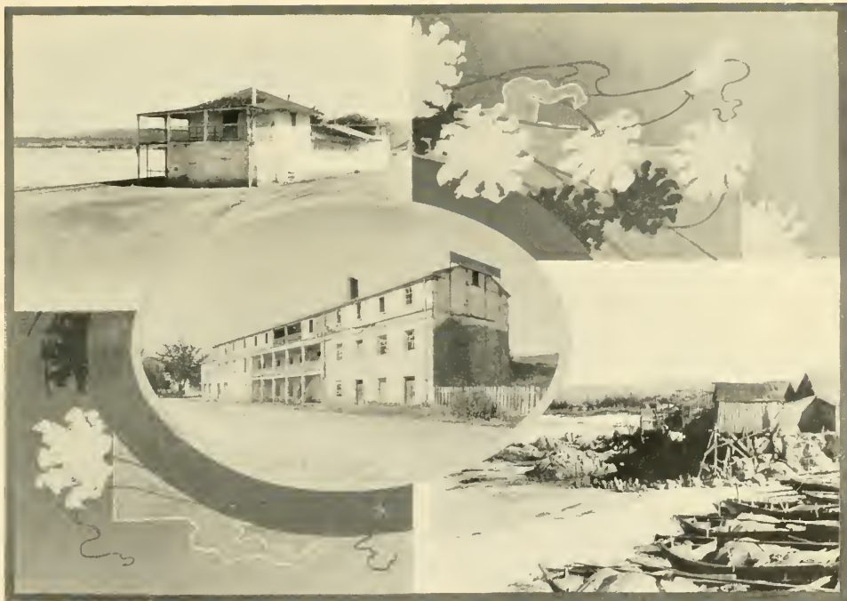
"The old historic town of Monterey"