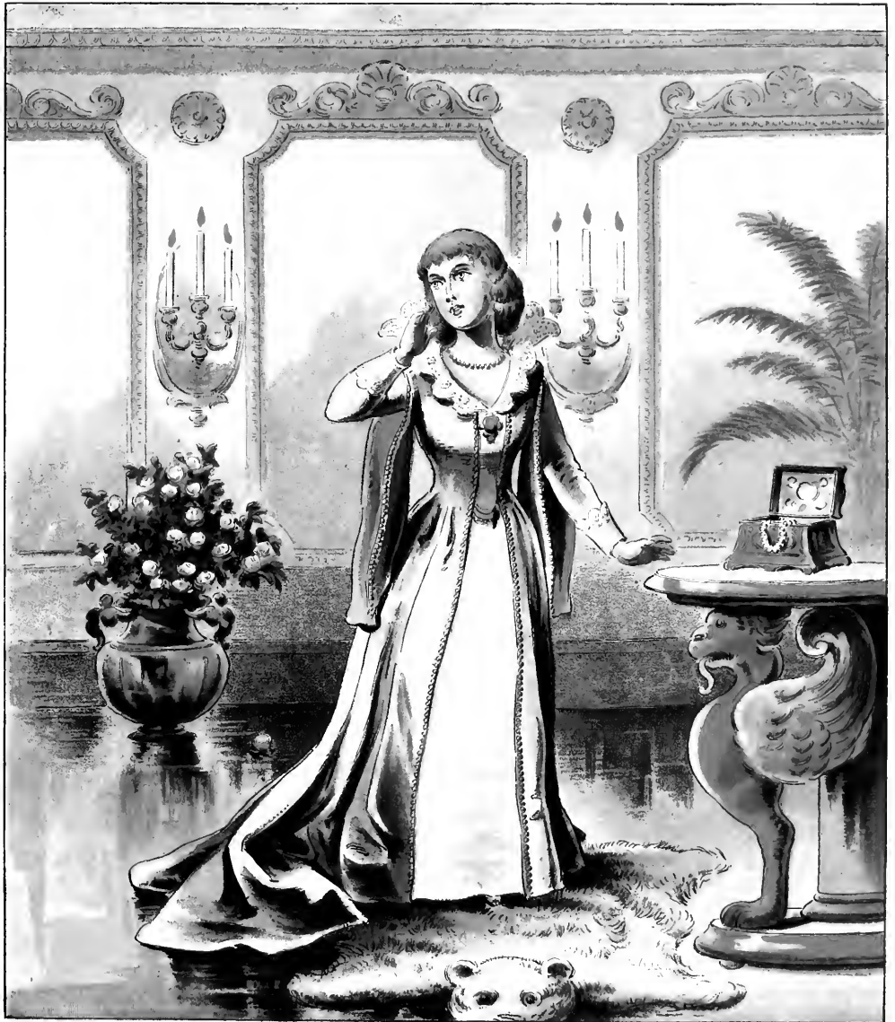
BEAUTY IN HER ROOM IN THE PALACE.