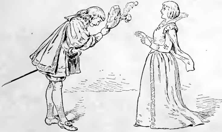
A SURPRISING TRANSFORMATION.