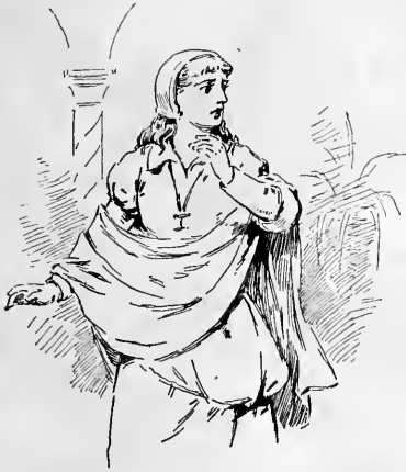
BEAUTY HEARS A VOICE.

quiry as to whether she had any wish that he could gratify, she said that she was tired of never seeing any one, and of being waited upon by beings that were invisible to her, and she asked him if he would not appear in his own form, and let those who attended her do the same.