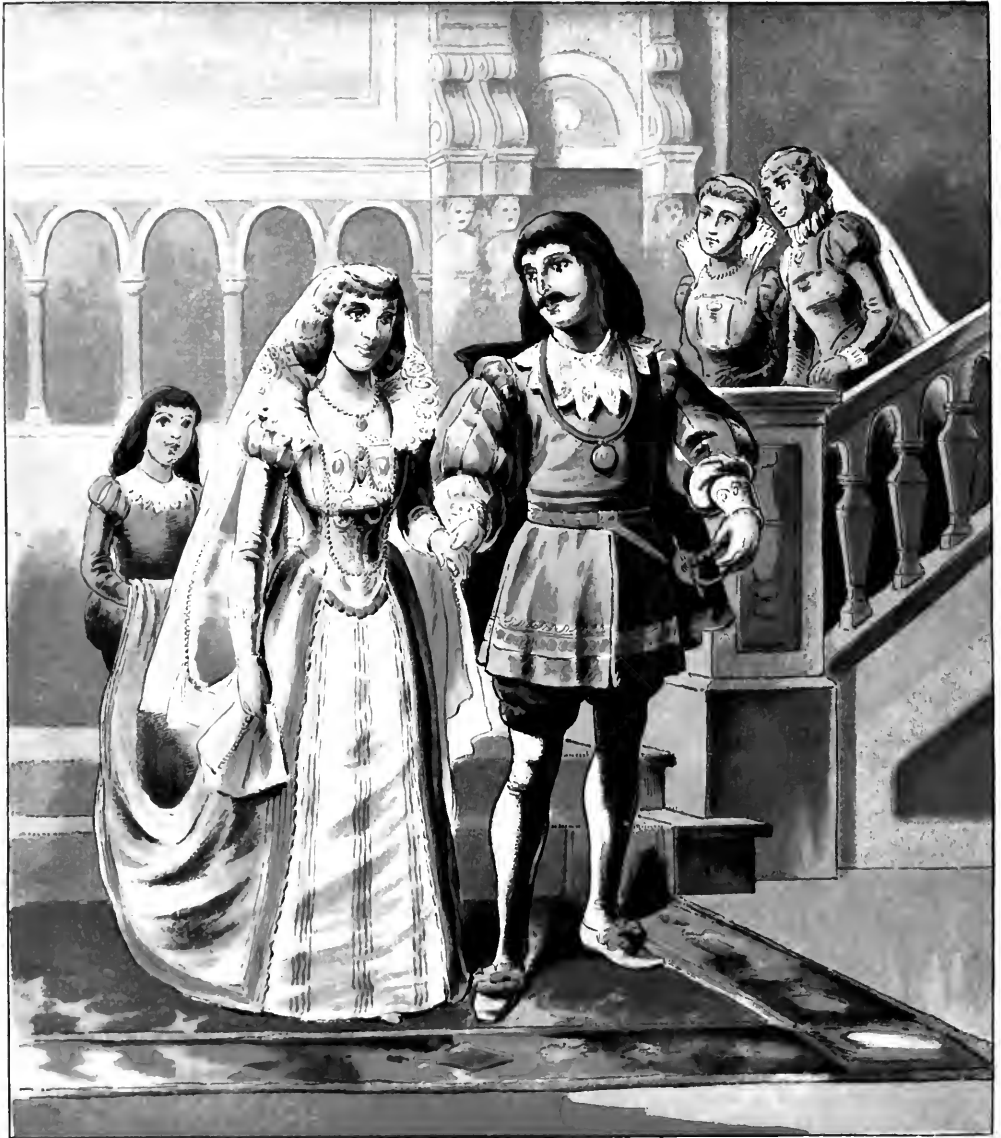
WEDDING OF BEAUTY AND THE PRINCE.