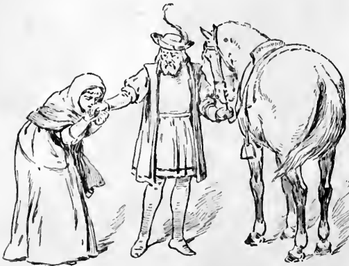
BEAUTY AND HER FATHER PARTING.

Several days passed, and Beauty grew to like the Beast so well that at last she began to feel a curiosity to see as well as hear him. So one evening when he made his usual in-