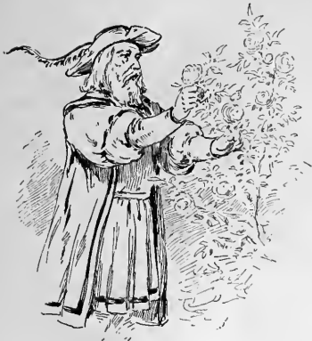
PLUCKING THE ROSE.

the horse, and taking Beauty behind him set out for the Beast's palace.