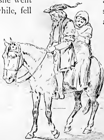
A SAD JOURNEY.

She looked about in surprise but could see no one. Somewhat comforted, she returned within the palace, and sought to occupy herself in exploring its many apartments.