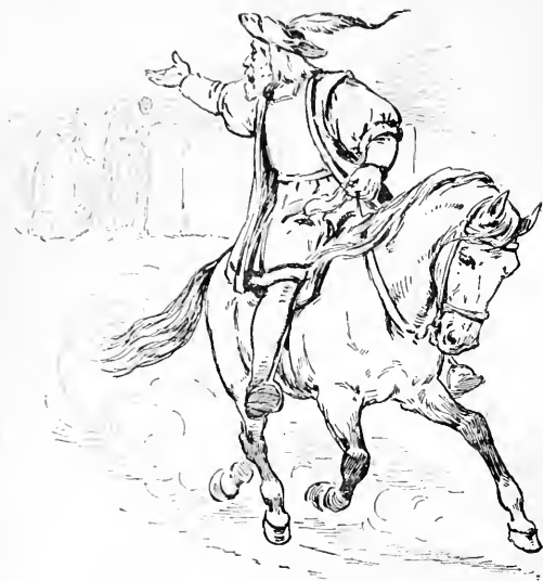
THE MERCHANT STARTS FOR THE CITY.

money amongst themselves. He went to law to obtain his share, but after long worry and delay, succeeded in getting very little more than enough to pay the expenses to which he had been put, and he started for home nearly as poor as when he left it.