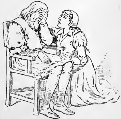
THE MERCHANT'S GRIEF.