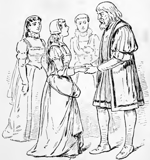
BEAUTY'S MODEST REQUEST.

The merchant then started upon his journey. When he reached the city, he found that while it was indeed true that one of his ships had come in, the people who had been his partners in business had taken advantage of his absence to sell the ship and its cargo, and had divided the