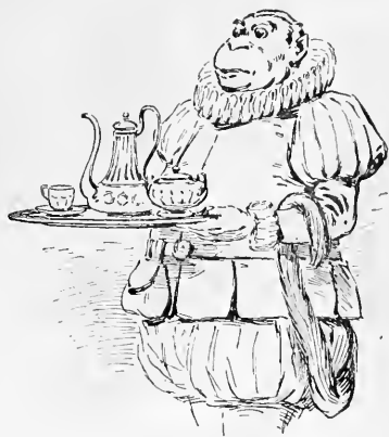
ONE OF THE ATTENDANTS.

away, and Beauty's life continued to be so pleasant that she would have been quite happy if it were not for the separation from her father and sisters. But at last this feeling became very keen, and her manner began to show it so clearly that the Beast was led to press her to say why she seemed so sad. When she told him of her longing to see her father, he said that he could gratify her in this, and that she would find in her room, the next day, a mirror in which she could see all that was passing at home.