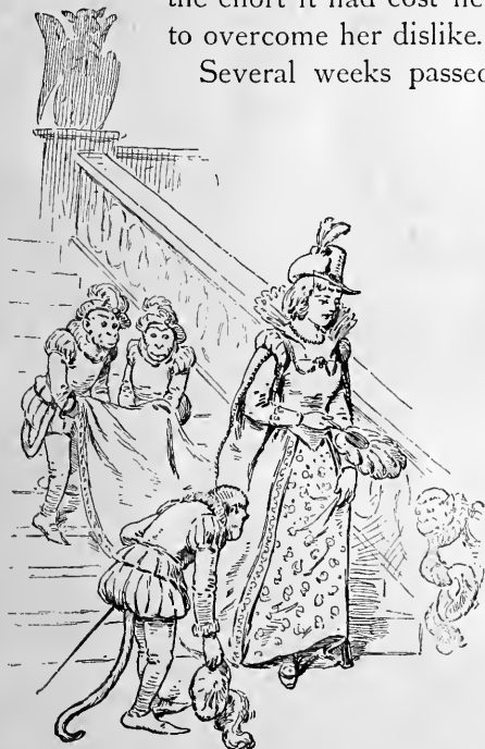
THE ATTENDANTS BECOME VISIBLE.