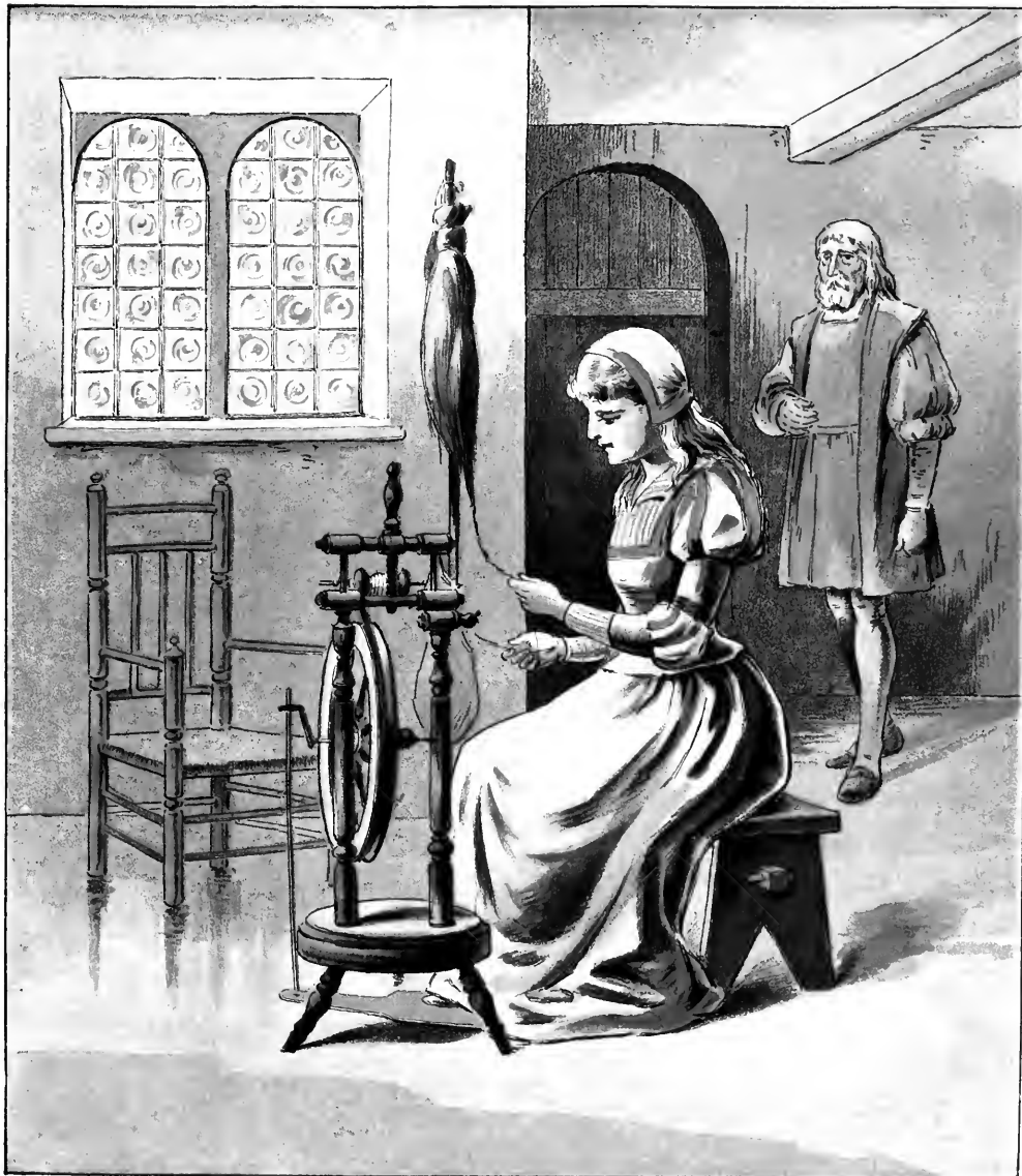
BEAUTY AT HER SPINNING WHEEL.