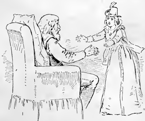
BEAUTY AND HER FATHER.

She rushed into the cottage, and into her father's arms, where he sat in his chair as she had seen him in the magic mirror. He opened his languid eyes, and when he saw his darling child it seemed as if new life came into them at once. He reached out his arms and clasped her to his breast while tears of joy ran down his cheeks. Her sisters, too, were glad to see her, and could not help