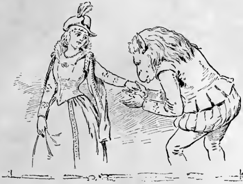
BEAUTY BIDS THE BEAST GOOD-BYE.

said Beauty, "I love you very much, but not enough for that."