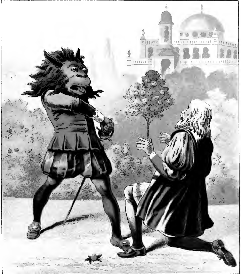
THE BEAST APPEARS TO THE MERCHANT.