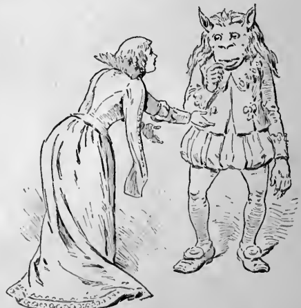
BEAUTY ENTREATS THE BEAST TO LET HER GO TO HER FATHER.