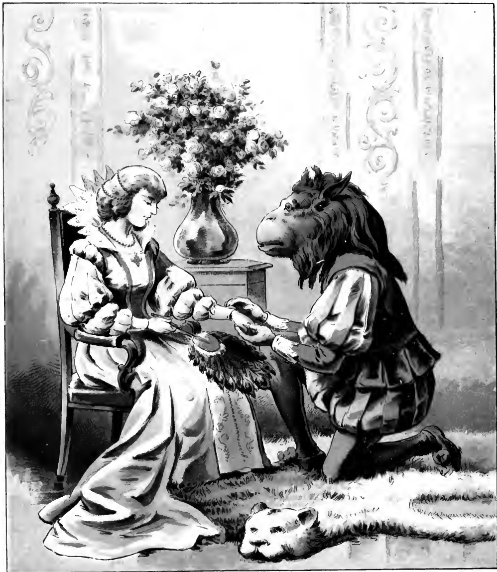
THE BEAST ENTREATS BEAUTY TO PROMISE TO MARRY HIM.