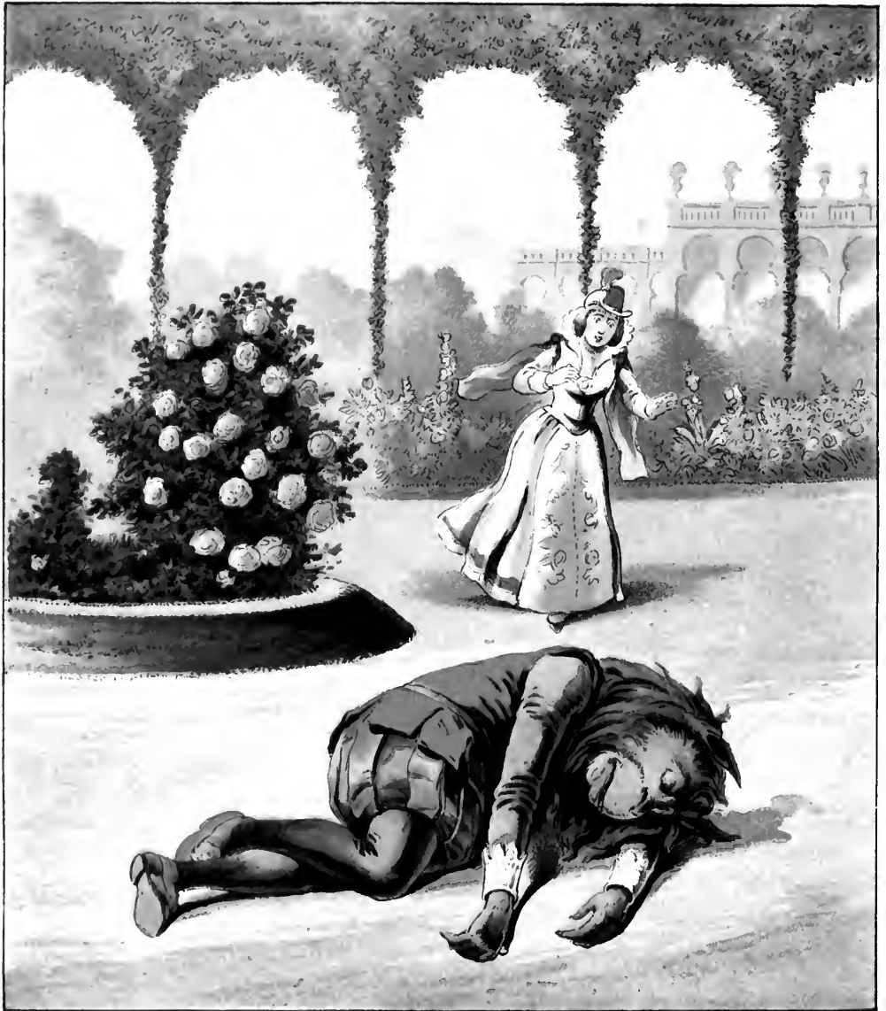
BEAUTY'S PAINFUL DREAM.