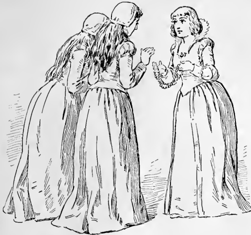
BEAUTY'S GIFTS TO HER SISTERS.

being pleased when they saw the beautiful presents she had brought them.