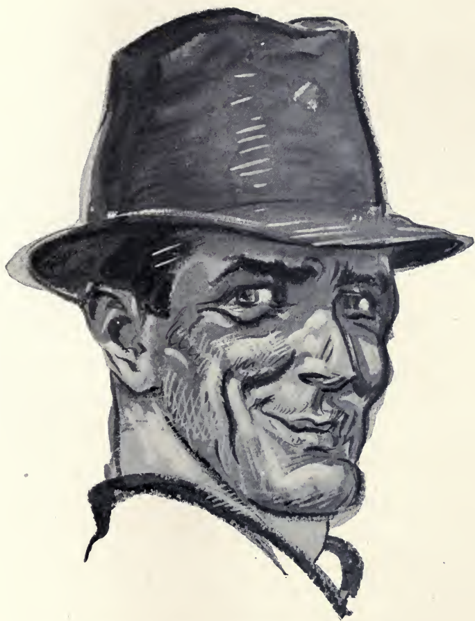
SENATOR ARTHUR I. CAPPER OF KANSAS