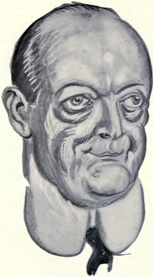
SENATOR JAMES W. WADSWORTH OF NEW YORK