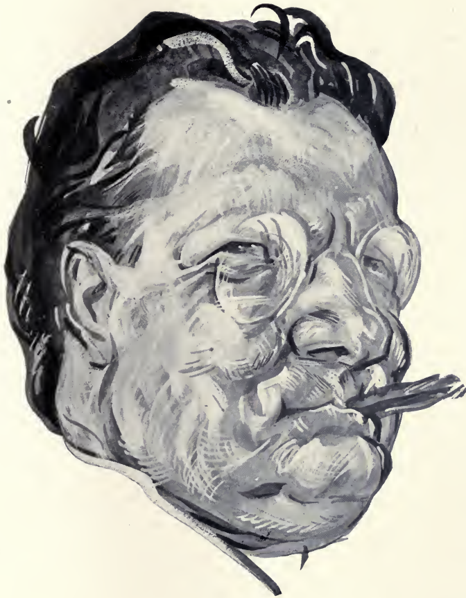
SENATOR JAMES E. WATSON OF INDIANA