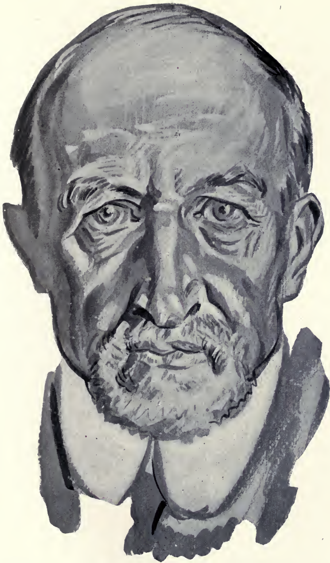
REPRESENTATIVE FREDERICK H. GILLETT OF MASSACHUSETTS