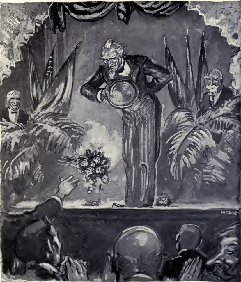
UNCLE SAM'S CONFERENCE