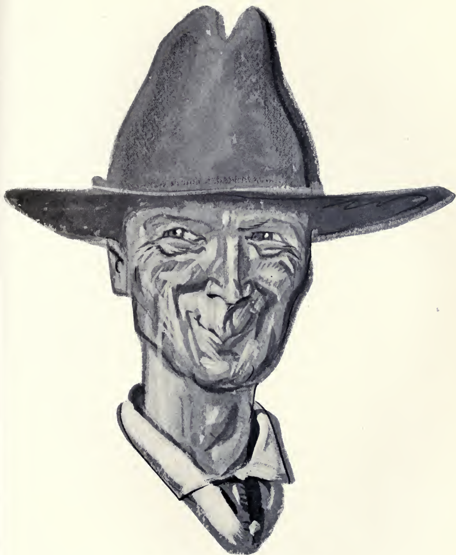
SENATOR HARRY S. NEW OF INDIANA