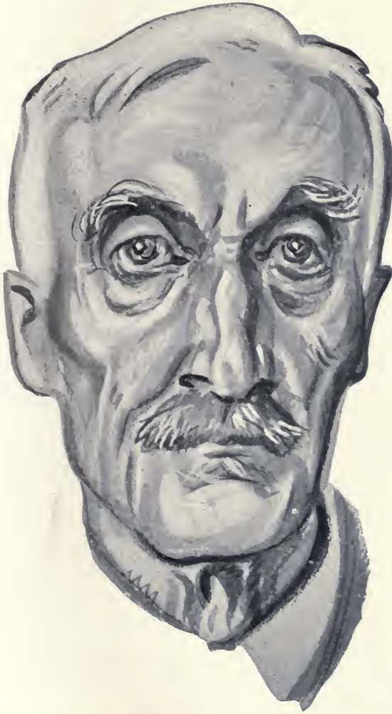
ANDREW W. MELLON, SECRETARY OF THE TREASURY