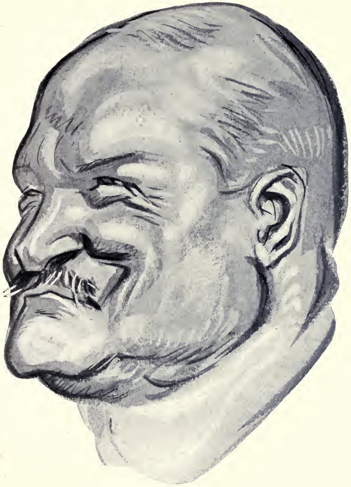
SENATOR WILLIAM M. CALDER OF NEW YORK