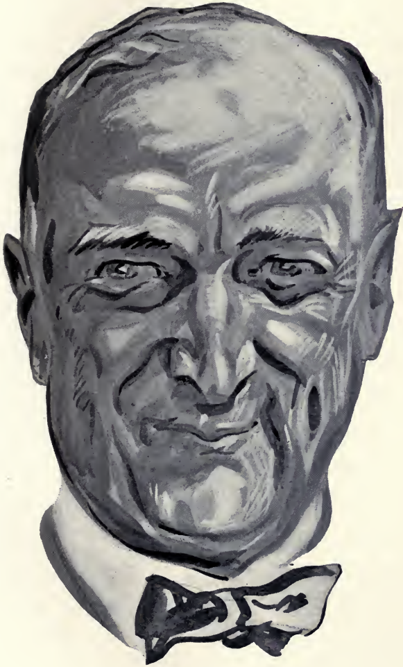
ATTORNEY-GENERAL H. M. DAUGHERTY