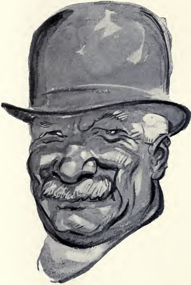
SENATOR JOSEPH S. FRELINGHUYSEN OF NEW JERSEY