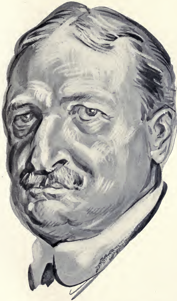
REPRESENTATIVE FRANK W. MONDELL OF WYOMING