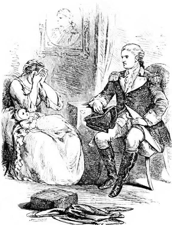
WASHINGTON'S INTERVIEW WITH MRS. ARNOLD.