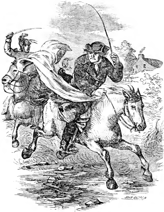
OLD HAMILTON SAVING HIS CLOTH.