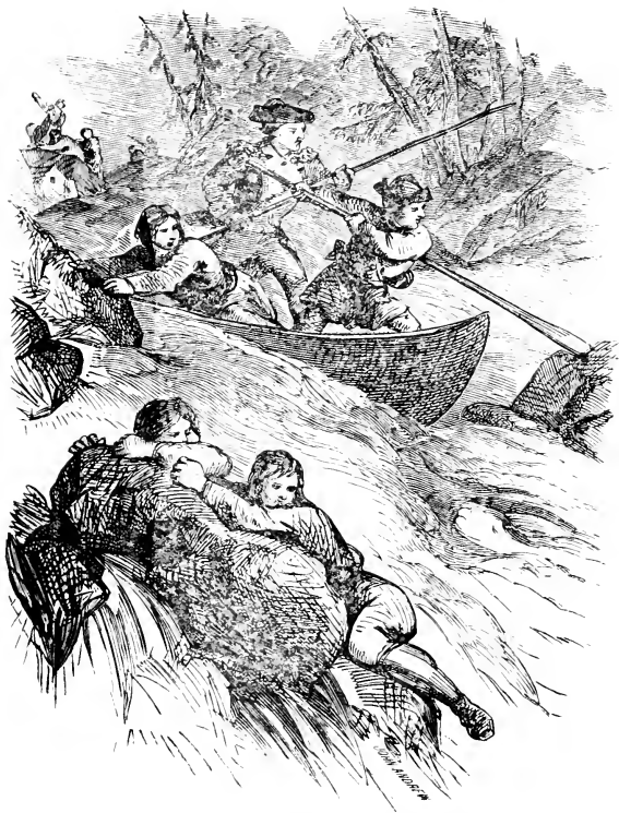
SURPRISED IN THE RAPIDS.