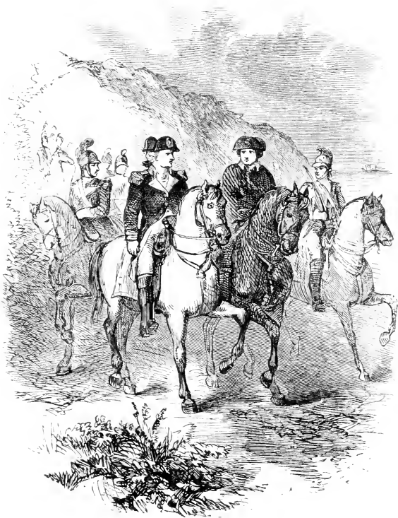
ANDRE ON THE ROAD TO TAPPAN.