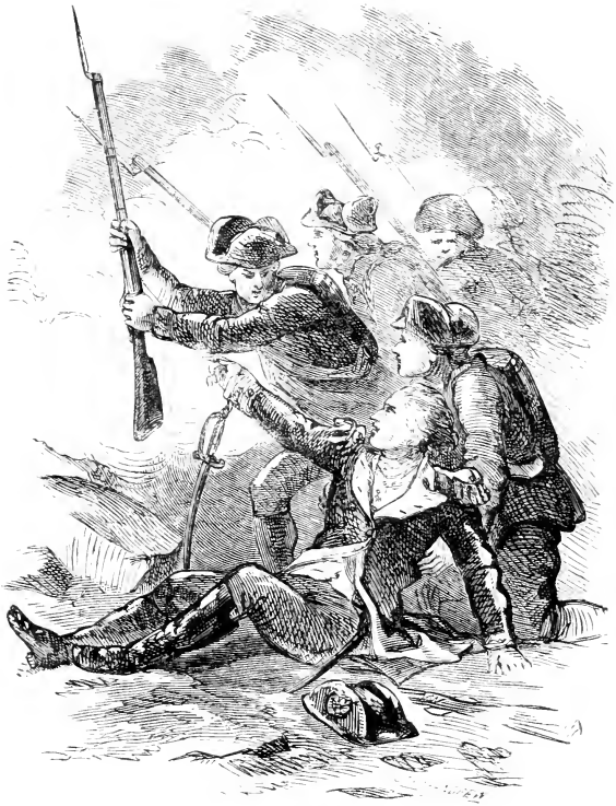
DEATH OF MONTGOMERY.