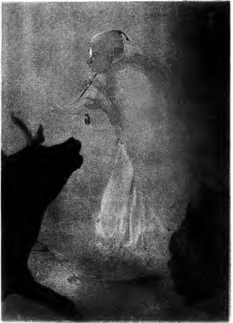
THE MAN WHO WAS ENRICHED BY ACCIDENT