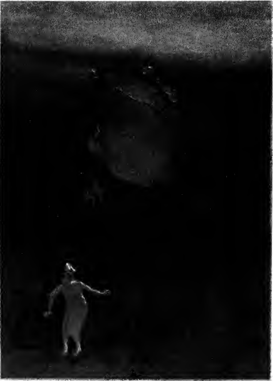
THE MAN WHO WAS ONLY A FINGER AND A HALF IN STATURE