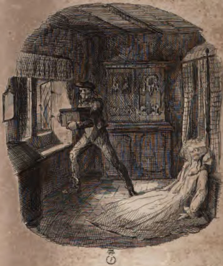
The little velvet shoe