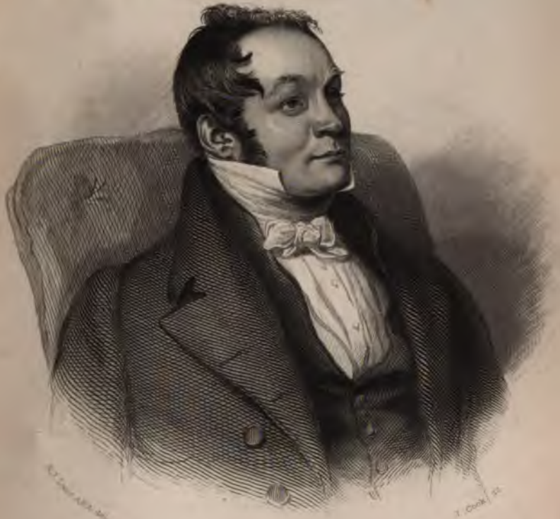
REV. RICHARD HARRIS BARHAM.