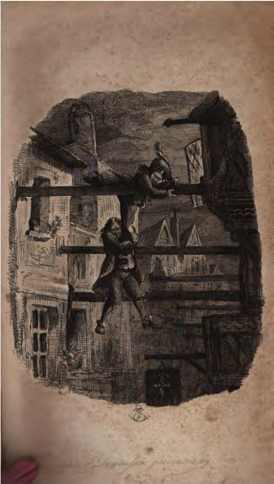
Illustration presented by...