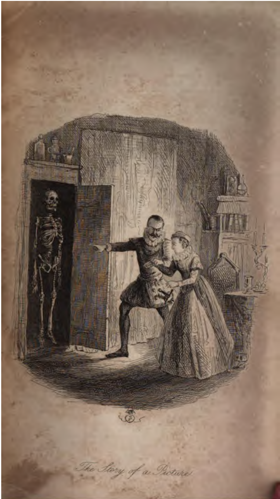
The Story of a Picture