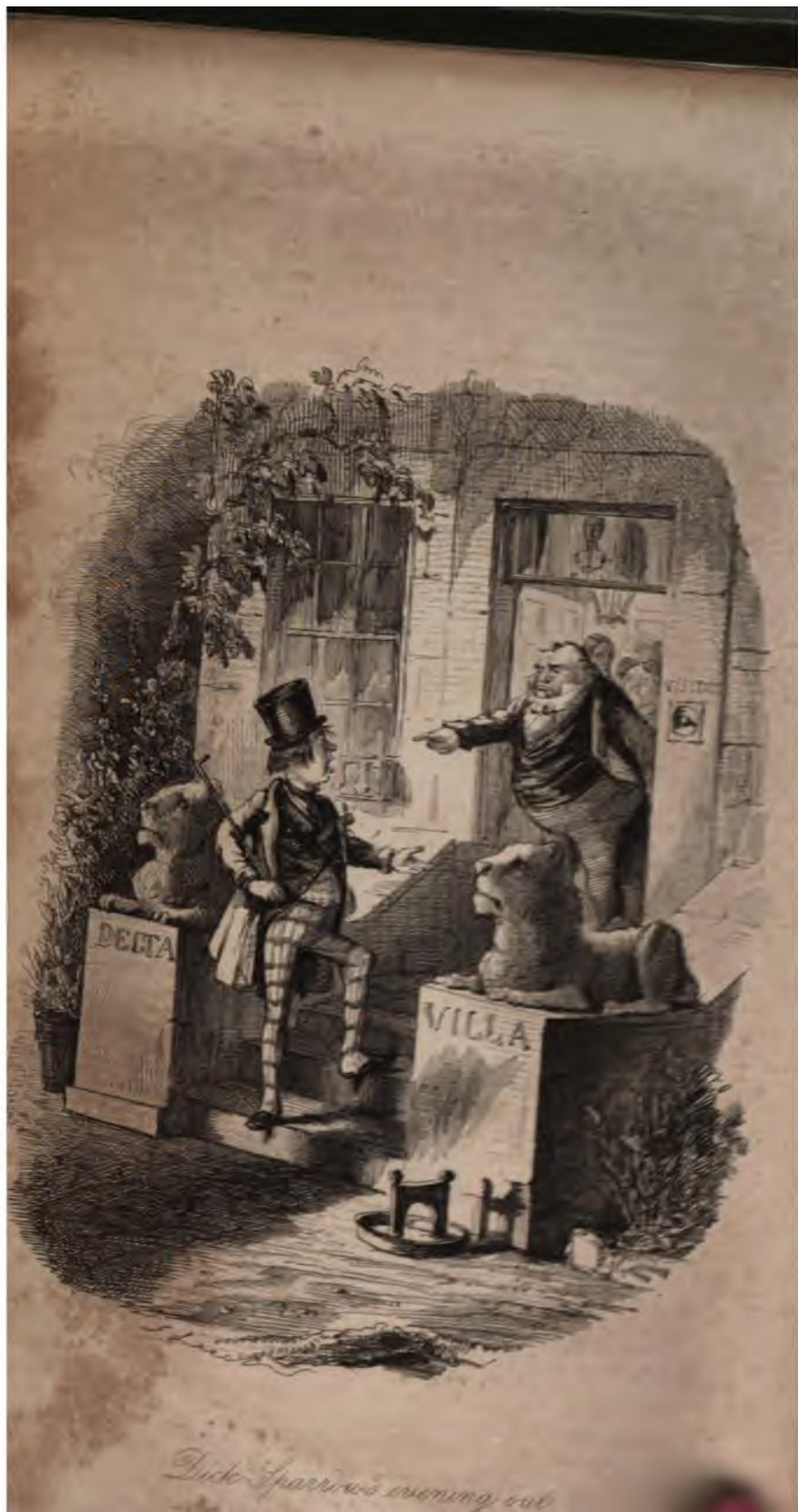
Tick Sparrows evening out