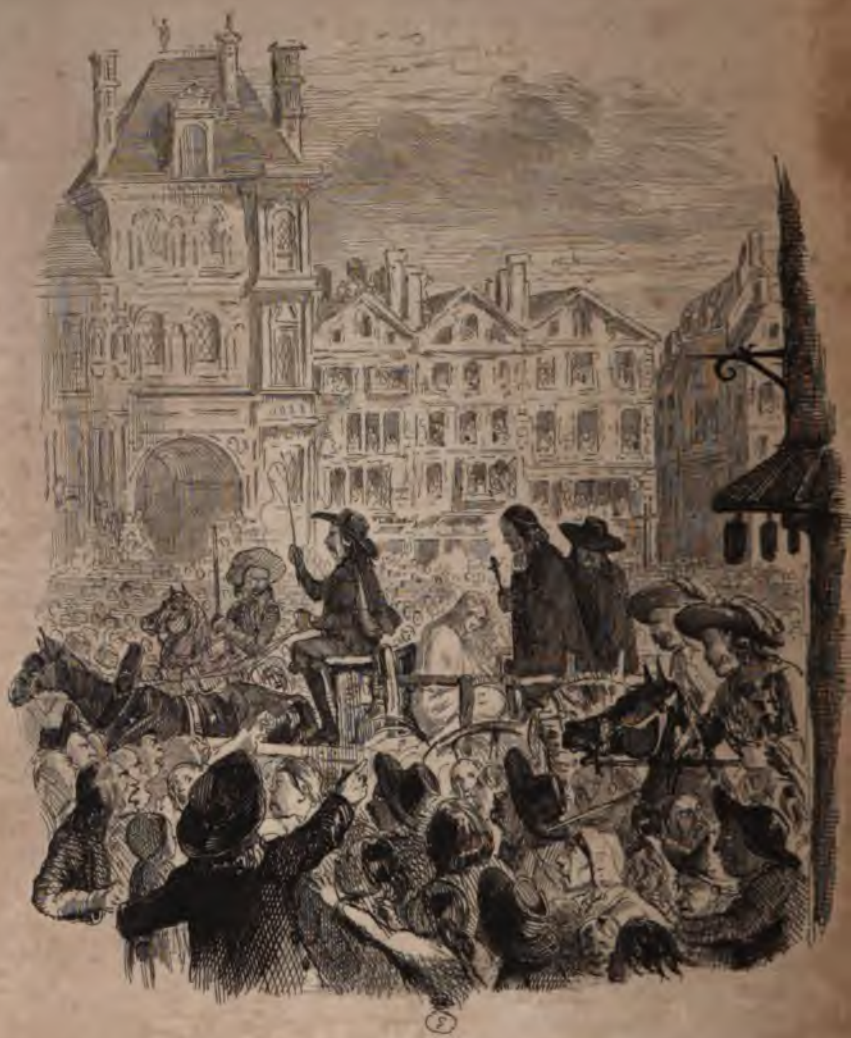
The Marchioness going to execution