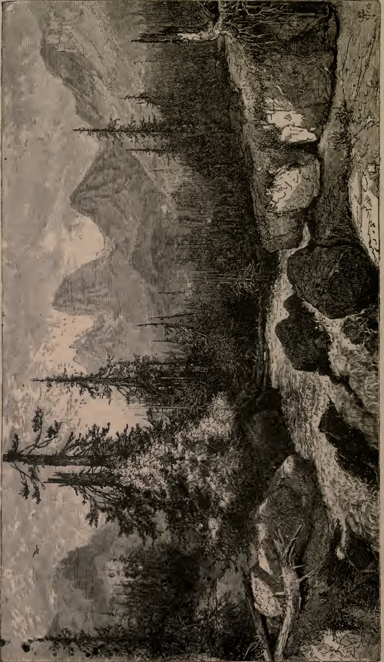
SCENE IN THE ROCKY MOUNTAINS, NEW MEXICO.