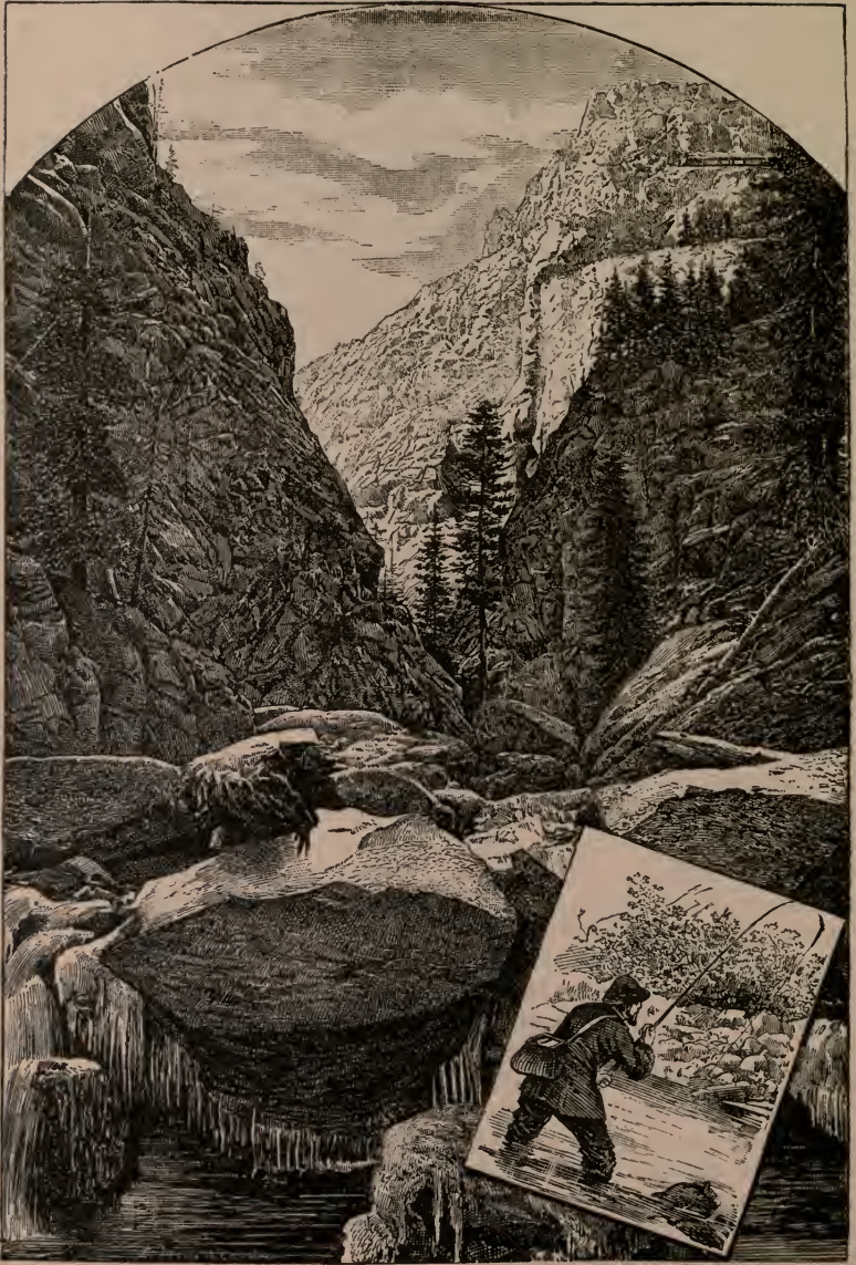
TOLTEC GORGE, BELOW THE TUNNEL.