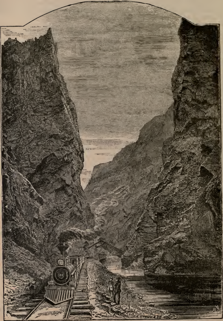
ROYAL GORGE, ON THE LINE OF THE D. & R. G. R. R.