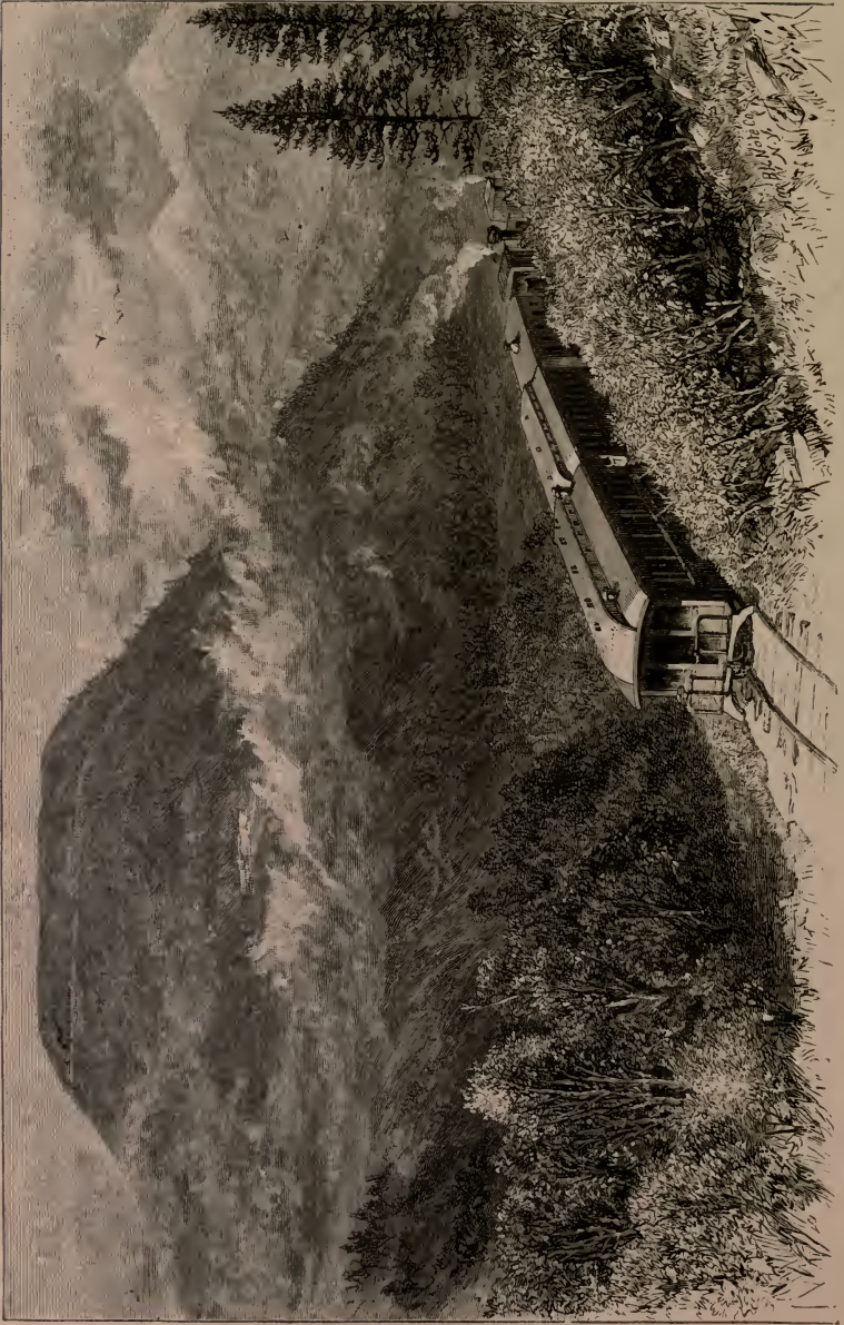
LA VETA PASS, ON THE LINE OF THE DENVER & RIO GRANDE R. R.