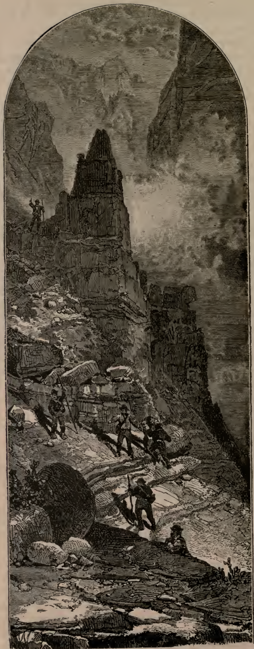
GRAND CANYON OF THE COLORADO, ON LINE OF A. & P. R. R.